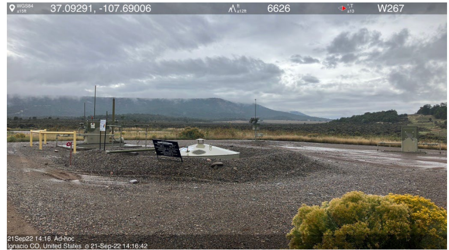
IMG 02 Location overview