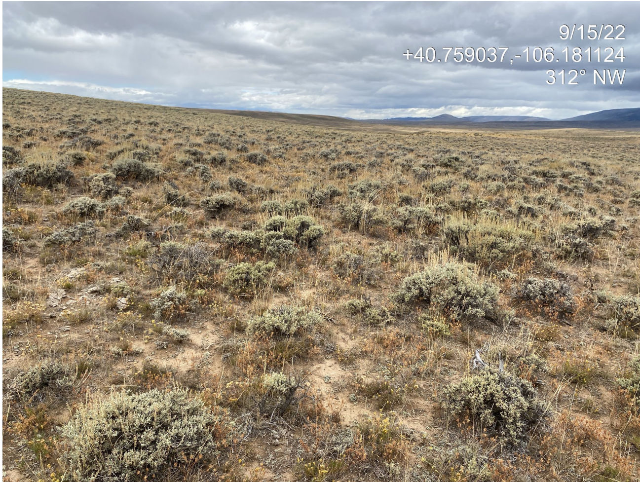
Photo 13. Photo taken to the north of the Location shows reference area vegetation.