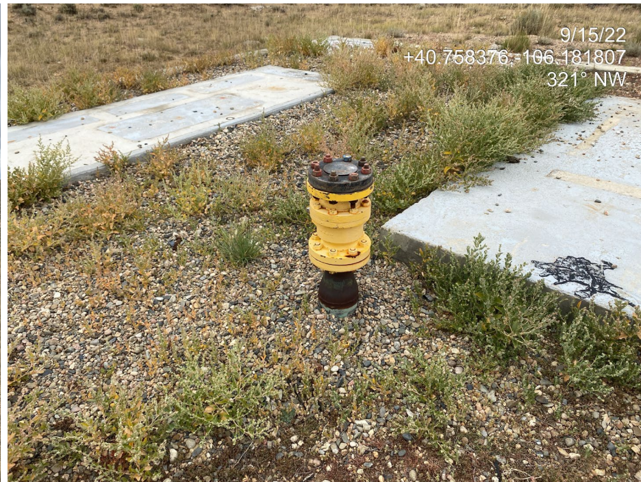
Photo 4. Photo shows the equipment remaining at the west of the Location.