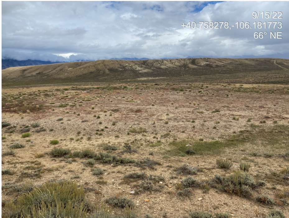
Photo 1. Photo taken from the center of the Location shows an overview of the former wellhead and tank battery area. Pad is flat, compacted and gravel remains. A cut slope remains to the west. Reclamation has not been performed.