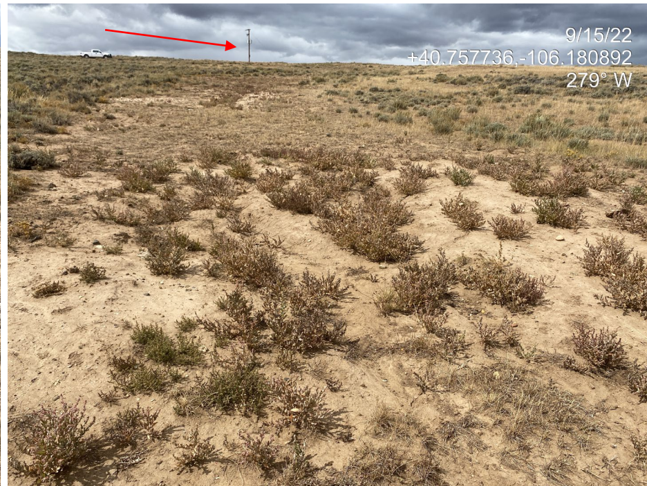
Photo 12. Refer to Photo 11 comment. Note also the power line in the background which must be removed.