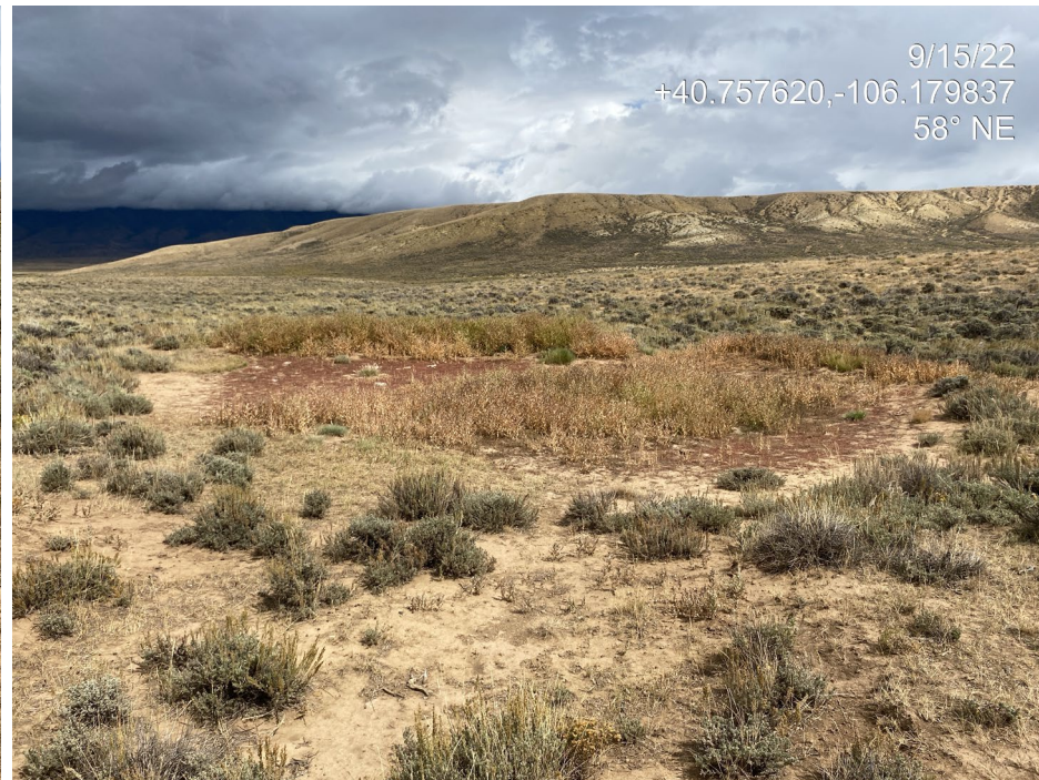
Photo 10. Photo shows a berm and pond feature at the terminus of the 2005 spill area. The purpose of this feature is unclear. Operator must reclaim this area or provide documentation from the surface owner that the feature is unrelated to the Location and/or spill.