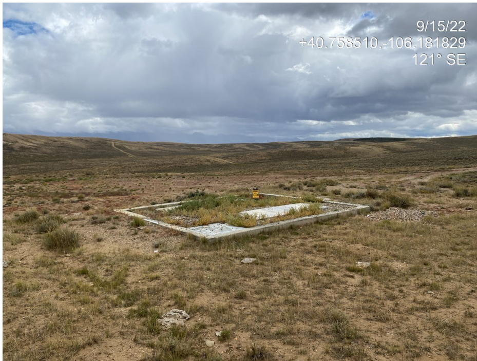
Photo 3. Photo taken from the west shows an overview of the equipment area remaining on Location. A gravel and concrete pad and riser equipment are present.