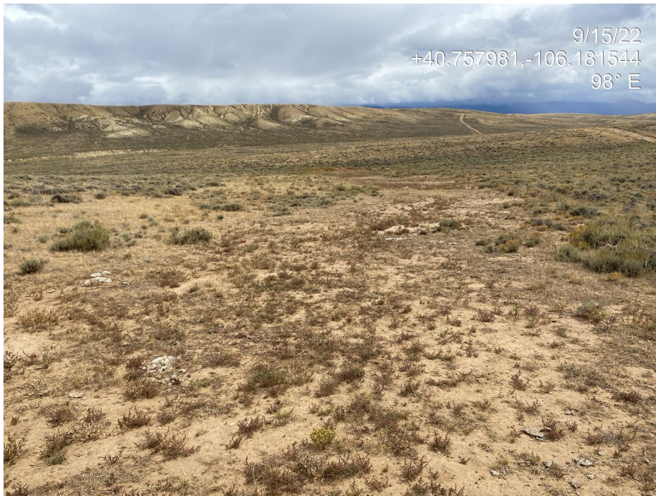
Photo 9. Photo taken from the southeast of the Location shows the site of a remediated 2005 spill. The area is vegetated, however desirable cover is not uniform. The tan vegetation is perennial grasses, the red vegetation is Russian thistle (annual, undesirable plant species/weed).