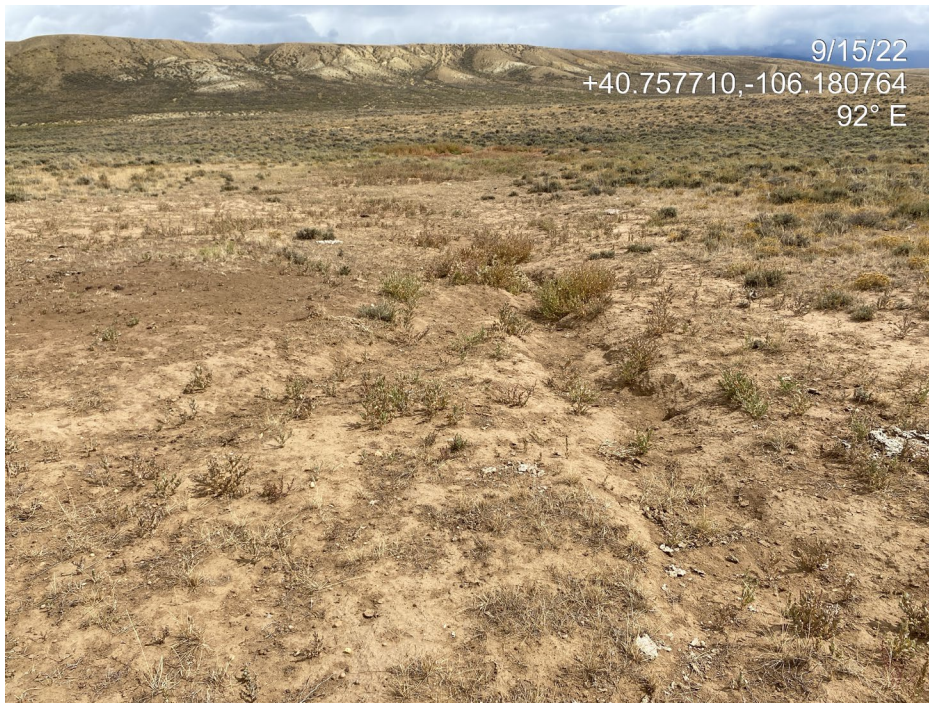
Photo 11. Photo shows the area of a remediated 2005 spill to the southeast of the Location. Revegetation has failed in some areas. Photo shows erosion occurring in areas with bare ground and tumbling saltweed (annual, undesirable plant species/weed).