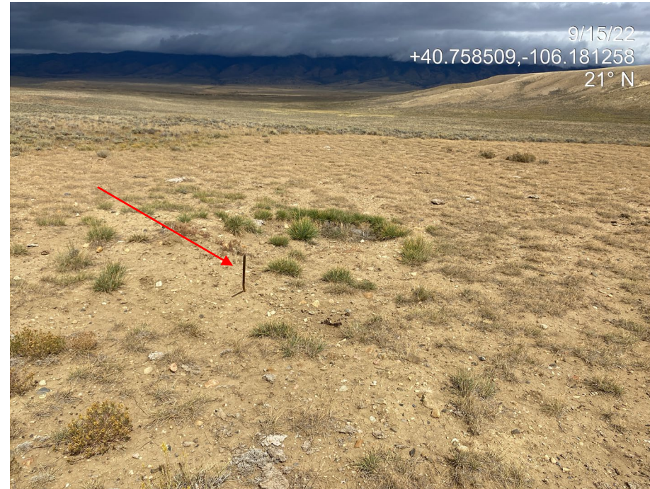
Photo 7. Photos taken from the north of the Location show equipment remaining.