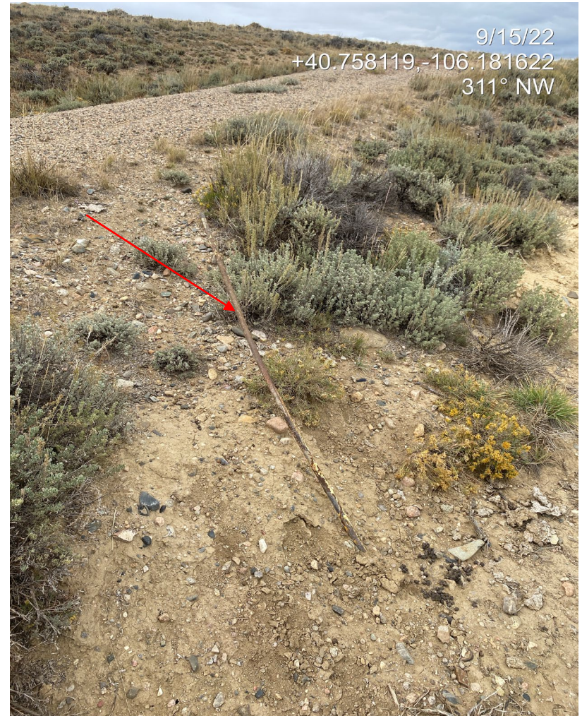
Photo 6. Photo taken from the south of the Location shows equipment remains.