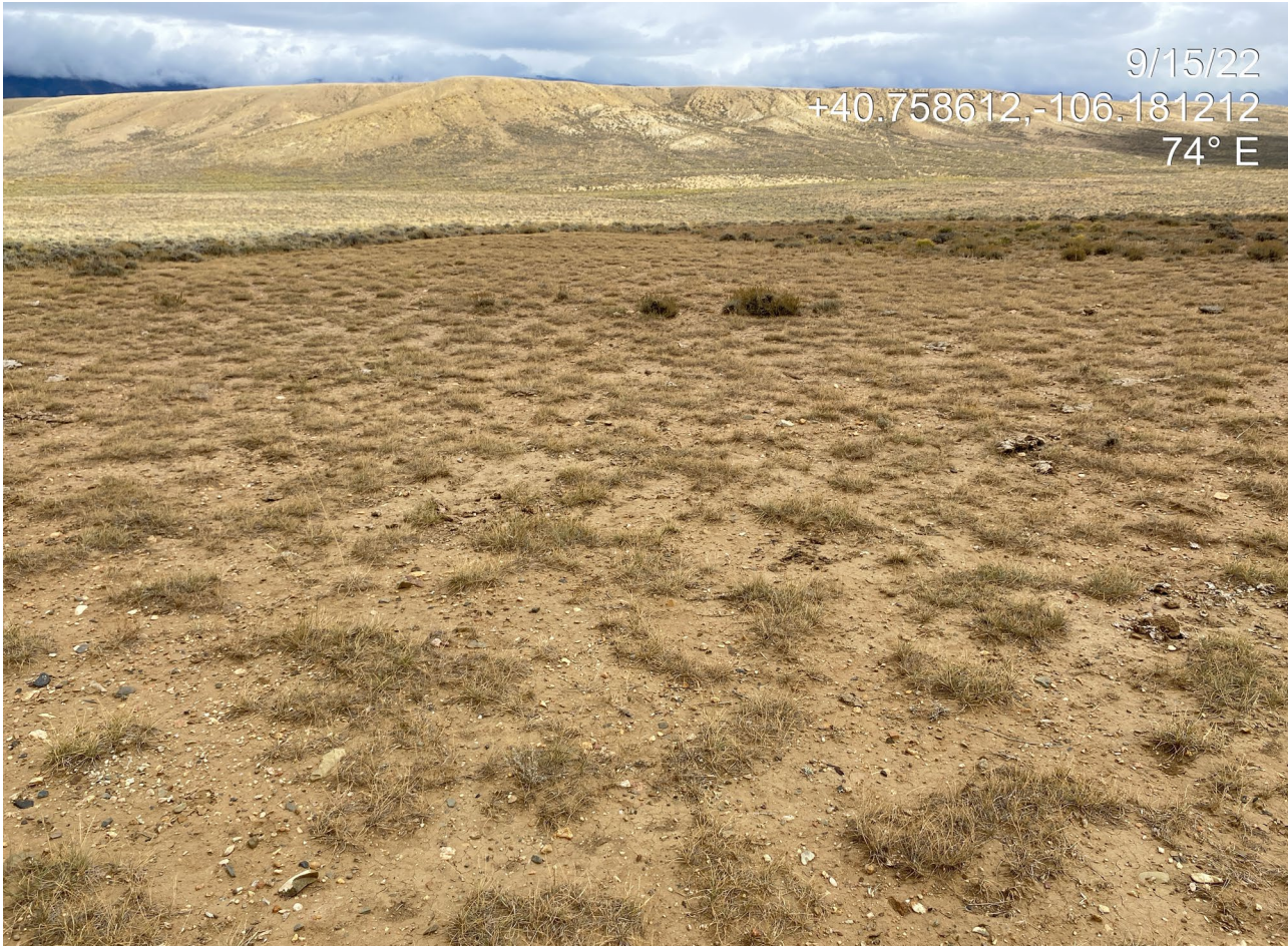
Photo 8. Photo taken from the north of the Location shows areas outside the former working pad area to the northeast appear to have been previously reclaimed and are vegetated with perennial grasses.