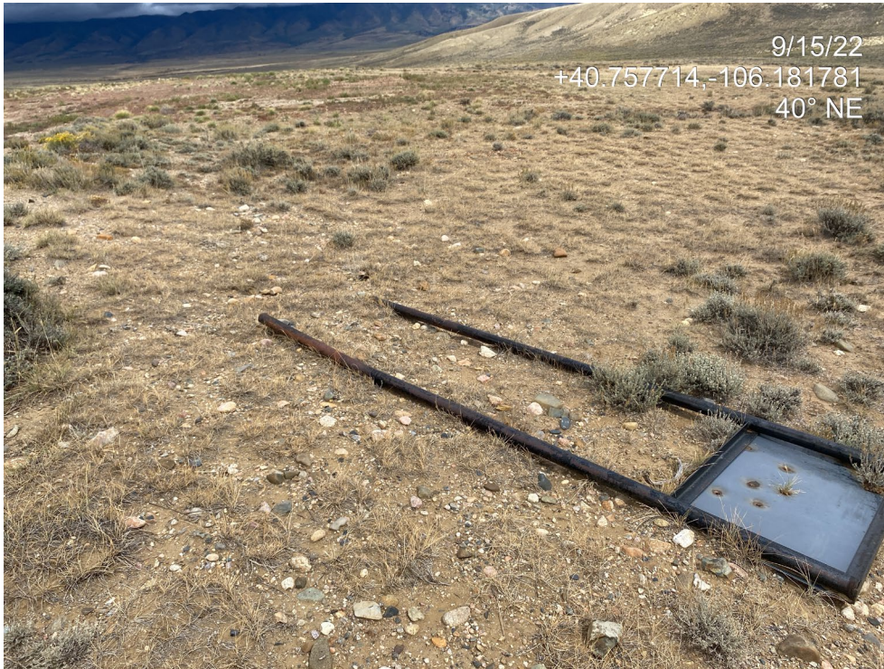
Photo 5. Photo taken from the south of the Location shows trash/debris.