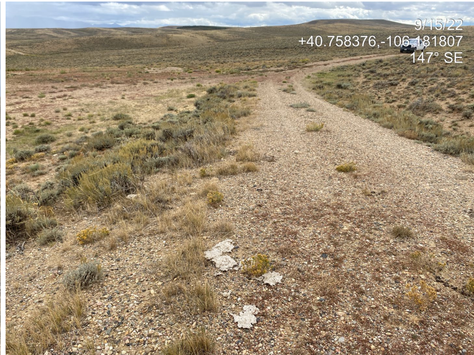
Photo 2. Photo taken from the west shows the unreclaimed access road.