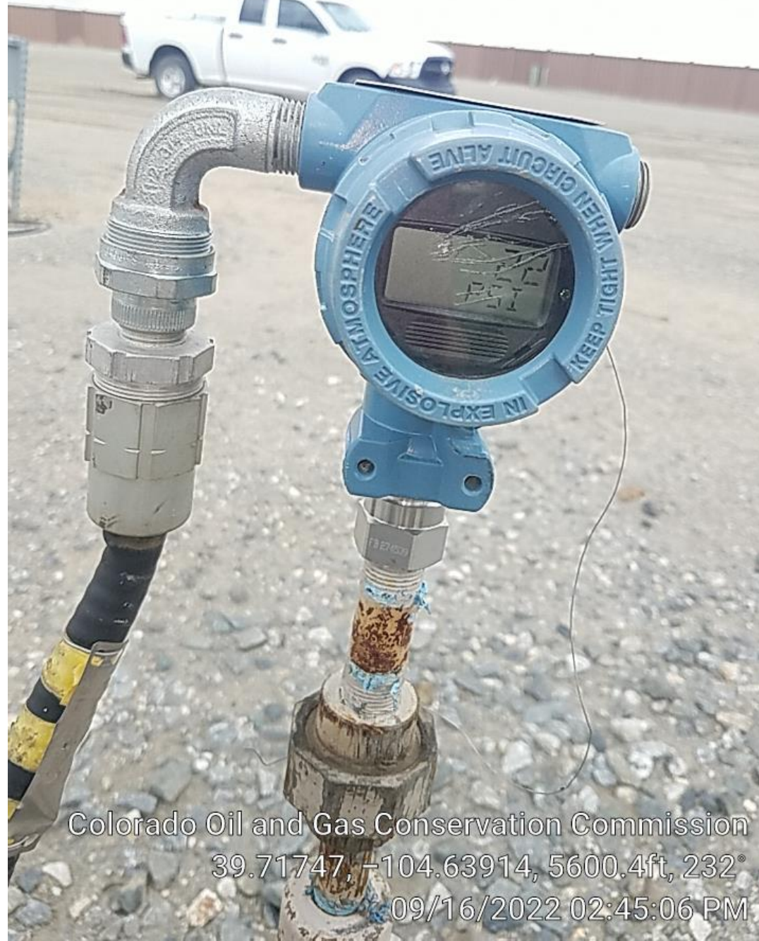
3BH Bradenhead 22 psi

Colorado Oil and Gas Conservation Commission 39.71747, -104.63914, 5600.4ft, 232° 09/16/2022 02:45:06 PM