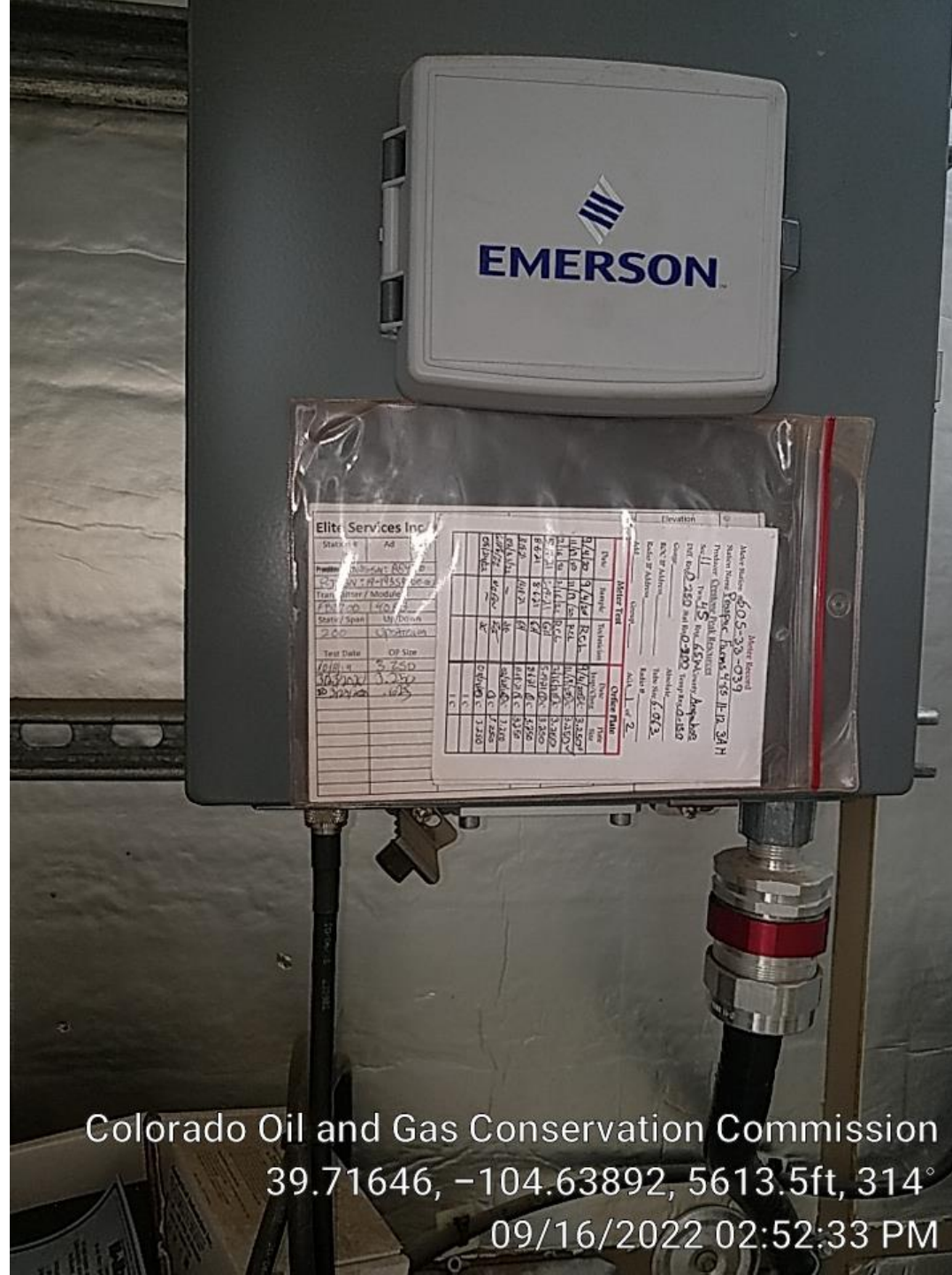
Gas meter calibration card

Colorado Oil and Gas Conservation Commission 39.71646, -104.63892, 5613.5ft, 314° 09/16/2022 02:52:33 PM