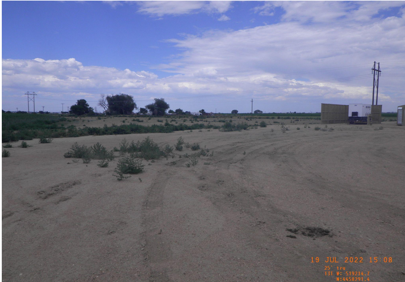
Photo 4. Overview photo of the tank battery taken at ground level from the western edge facing east. Note: tank battery has an open remediation.