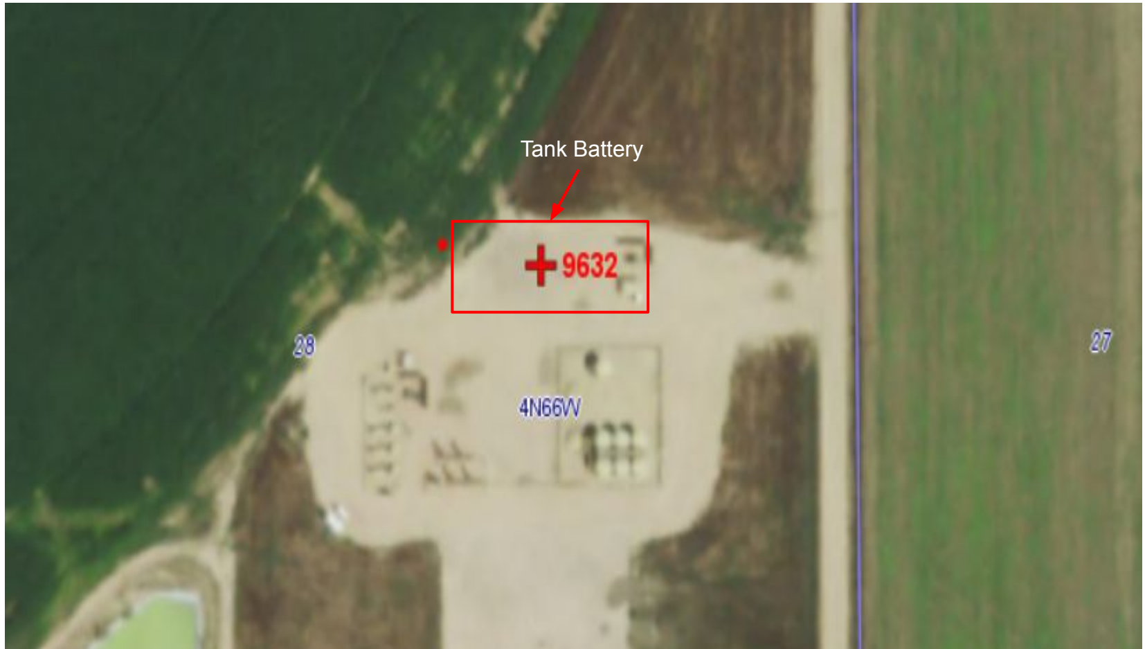
Photo 5. Open remediation at tank battery. Spill remediation under document #200439420. Monitoring wells were observed on site during the inspection. Tank Battery status will remain in-process until remediation has closed and location can be re-inspected.