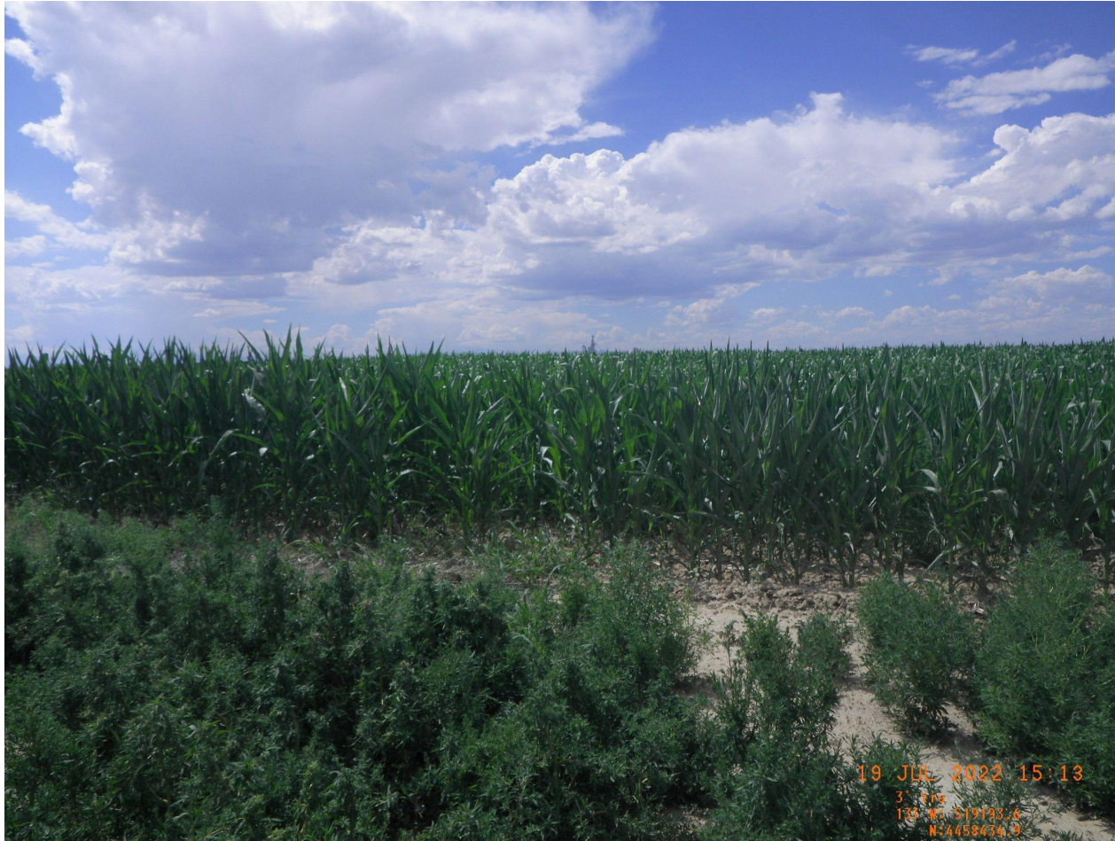
Photo 3. Ground photo taken from the eastern edge of the well facing west down the access road.