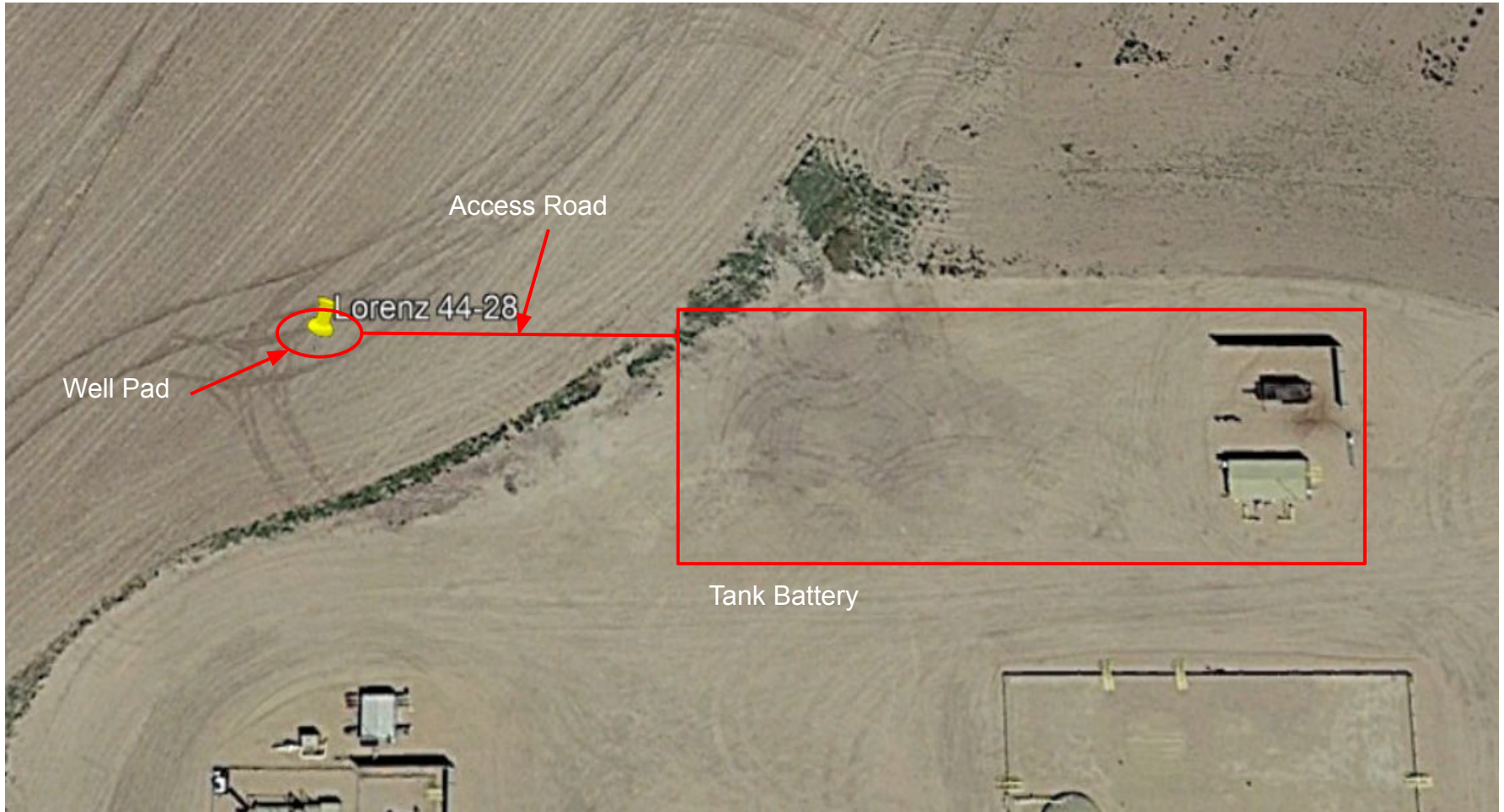
Photo 1. Overview photo of the well pad, access road and associated tank battery. Note: the tank battery now falls within the active PDC Hunt Federal production facility, location ID 442636.