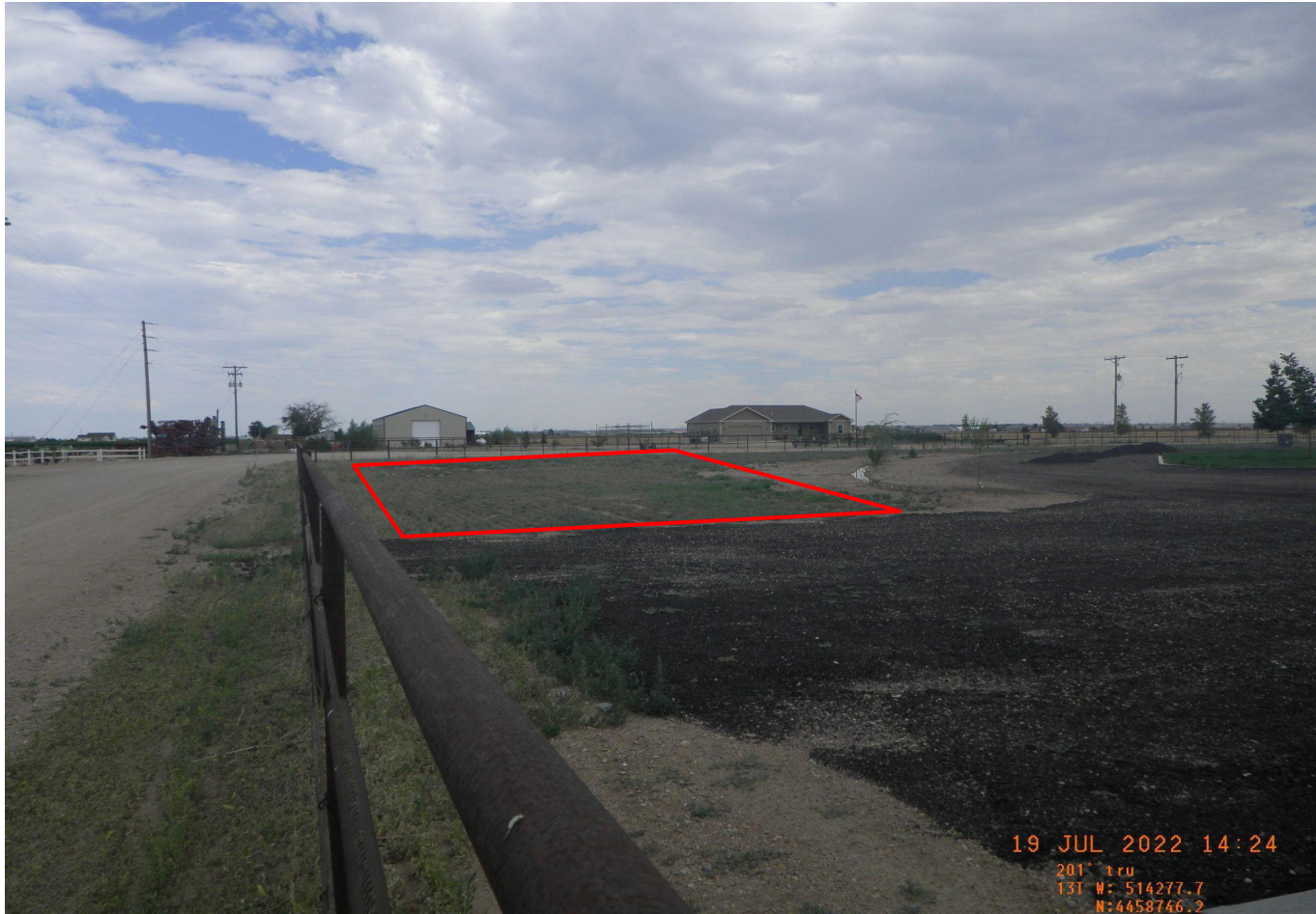
Photo 3. Overview photo of the tank battery taken at ground level from the eastern edge looking west.