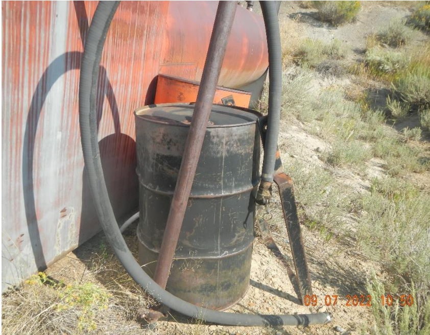
2 - 55 gallon drums with no labels and no secondary containment at separator.