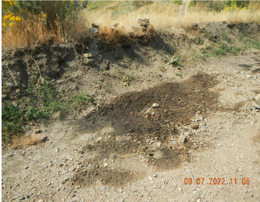
Oil stained ground inside of tank berm.