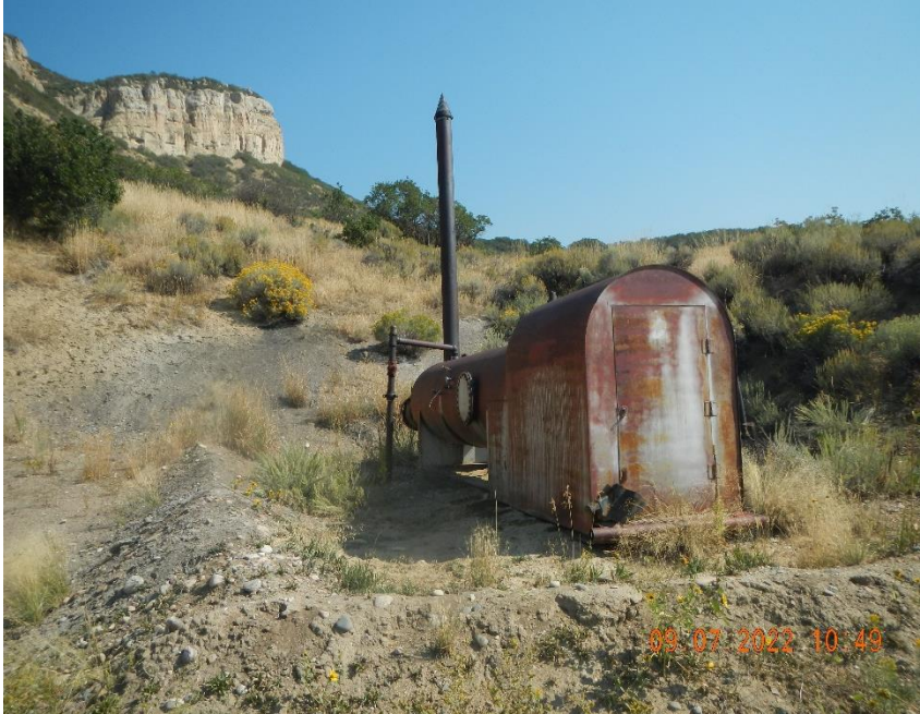
Heated separator. Weeds in berm.