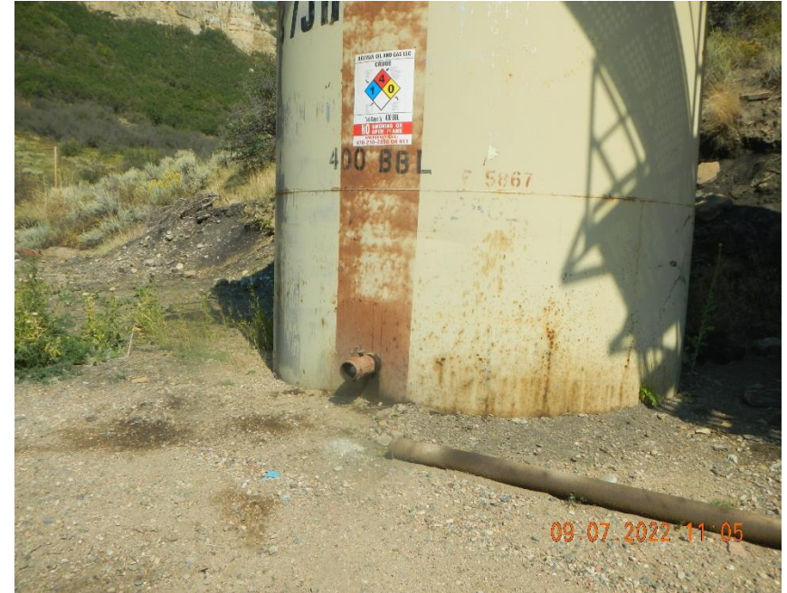
Oil stained ground inside of tank berm.