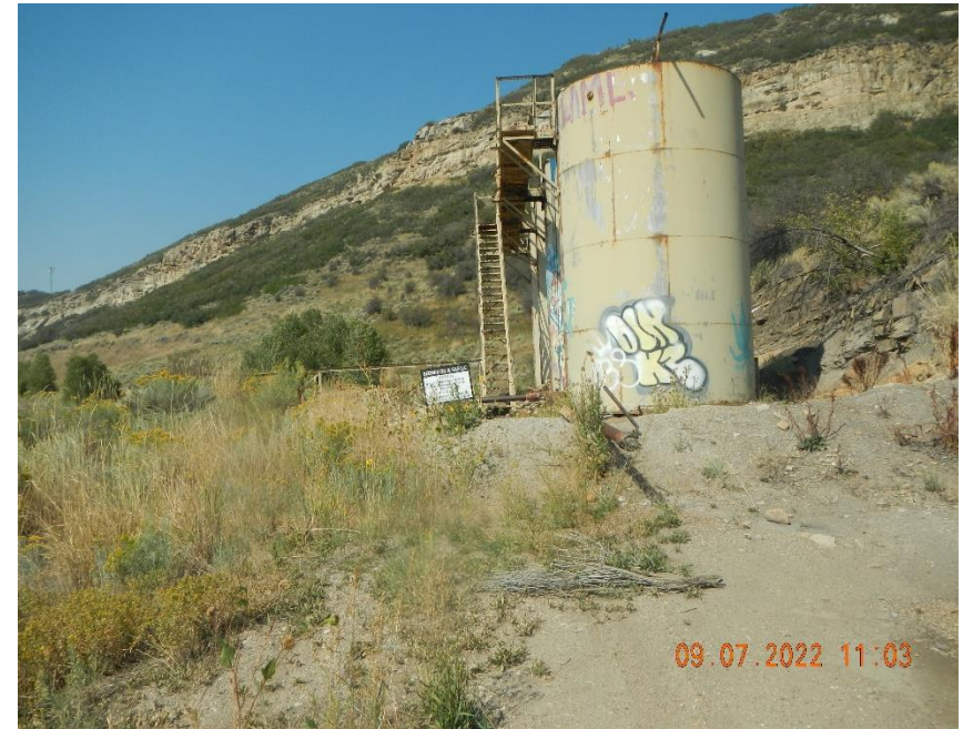
Tank battery Weeds