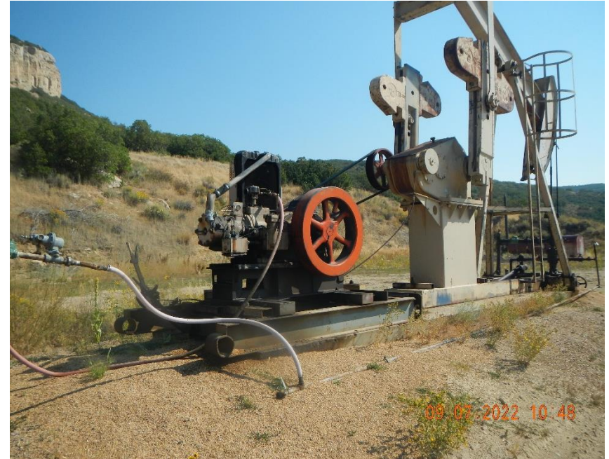
Oil stained ground at pumpjack engine.