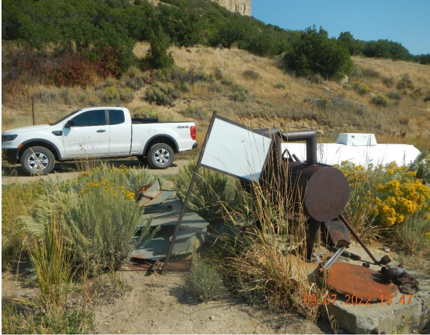
Junk at well head.