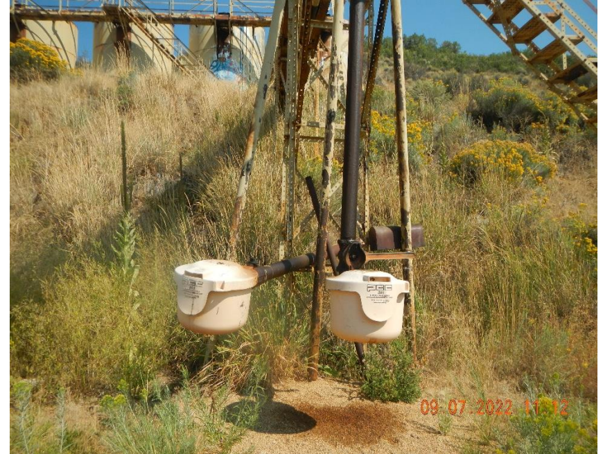
Oil stained ground at load lines..