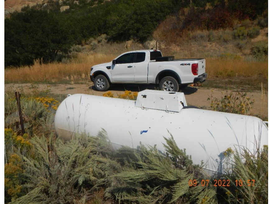
Propane tank with no labeling.