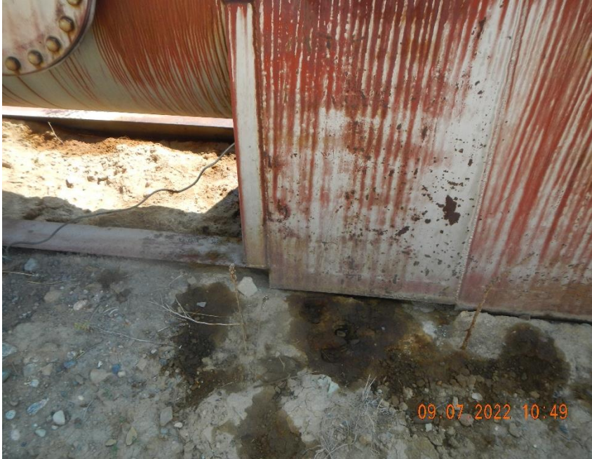
Stained ground at separator.