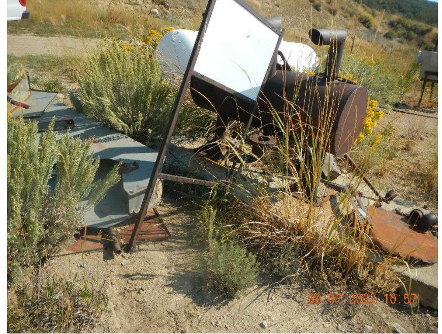
Junk at well head.