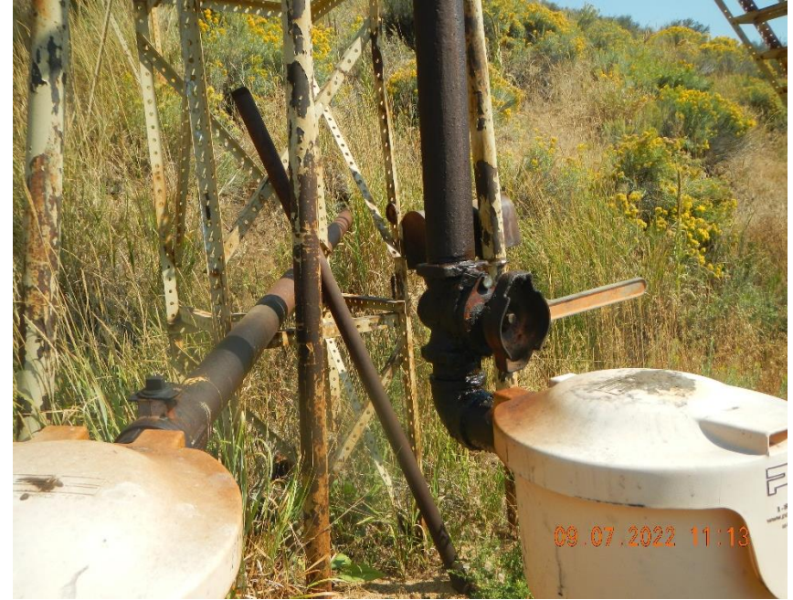
Oil stained load lines. Seeping fittings.