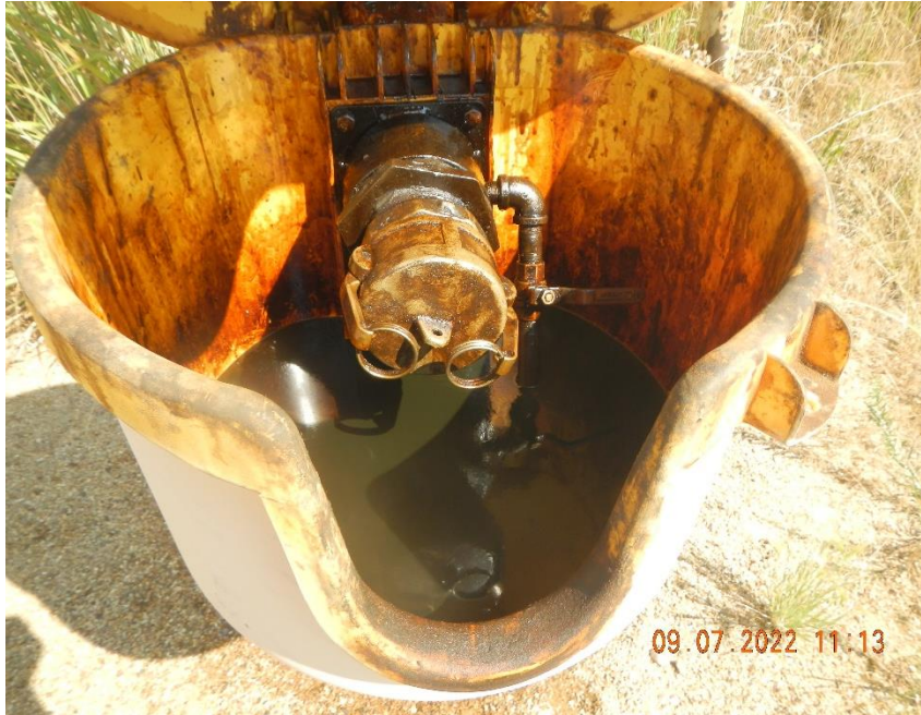
Containers with fluids and build up.