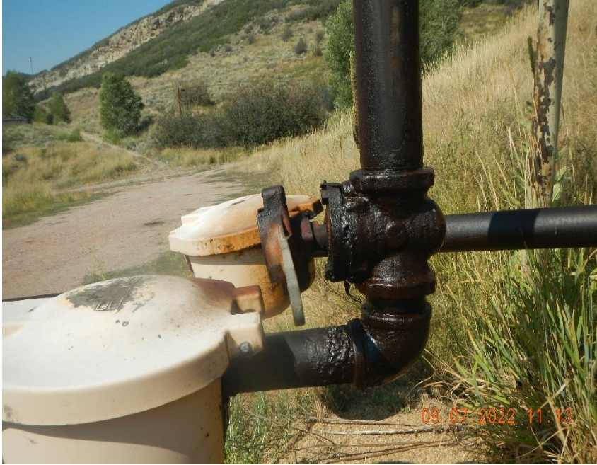
Oil stained load lines. Seeping fittings.