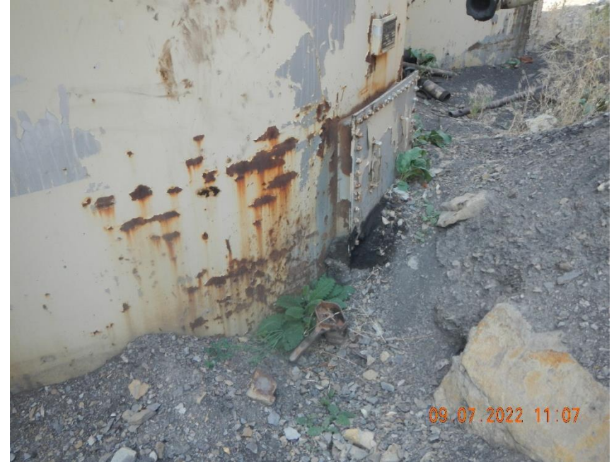
Oil stained ground inside of tank berm.