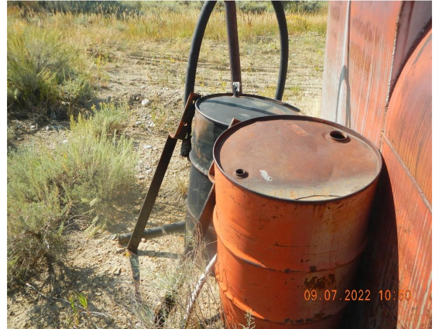
Open drum at separator.