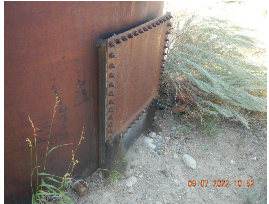
Stained ground at tank. Leaks from bolted on cover. Weeds in berm.