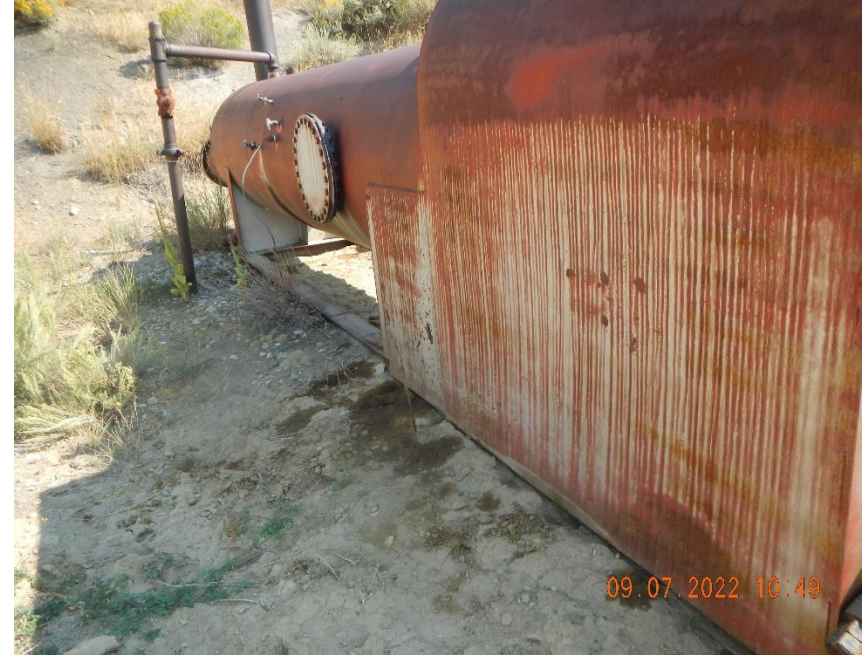
Stained ground at separator.