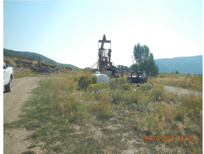
Weeds at well and pump jack.