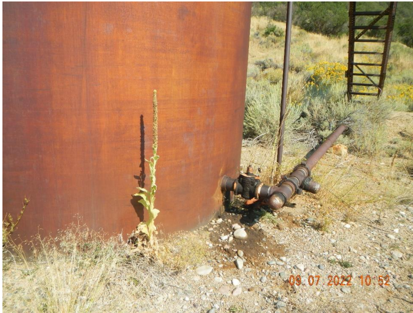
Stained ground at tank valve. Weeds in berm.