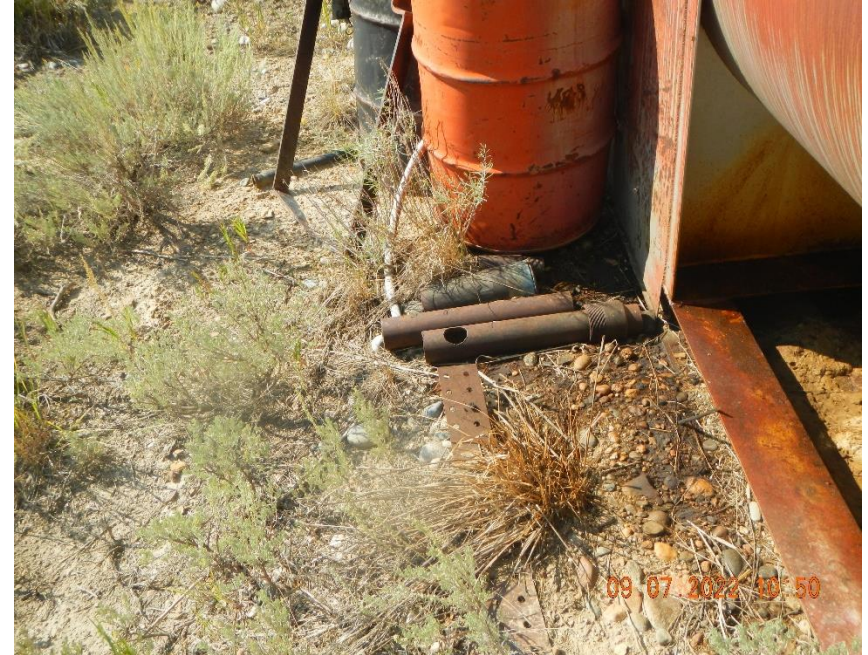
Stained ground at separator.