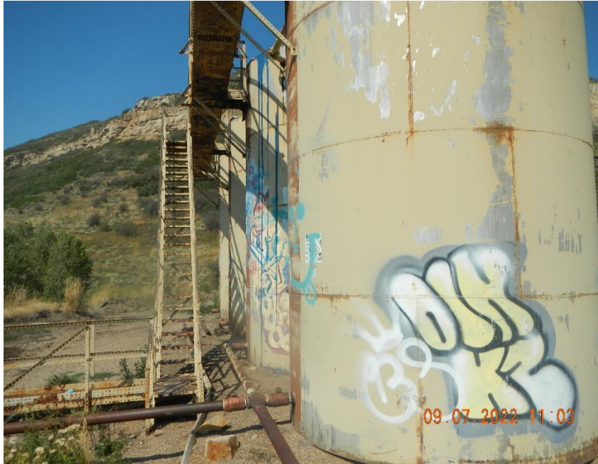
Tanks have painted on graffiti.