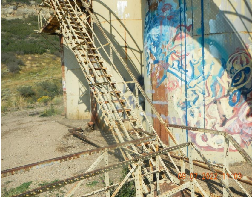
Tanks have painted on graffiti.