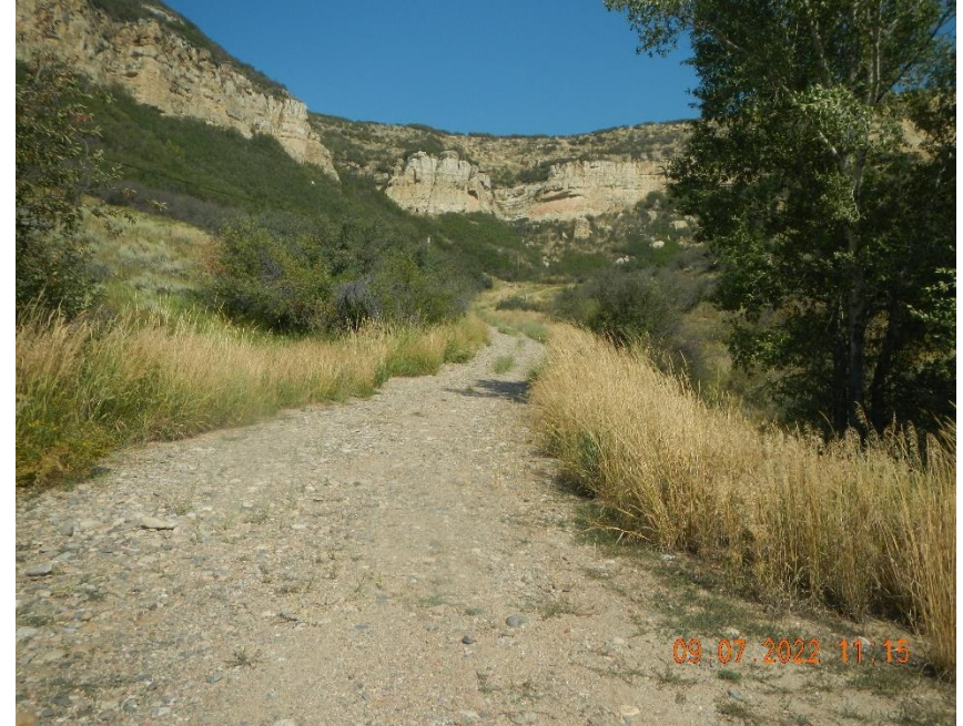
Weeds on access road.