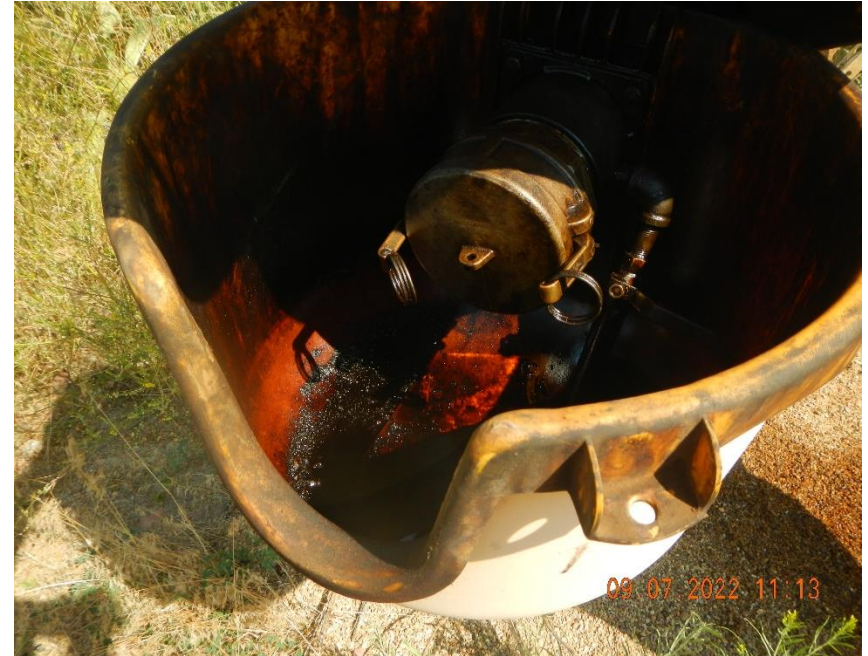
Containers with fluids and build up.