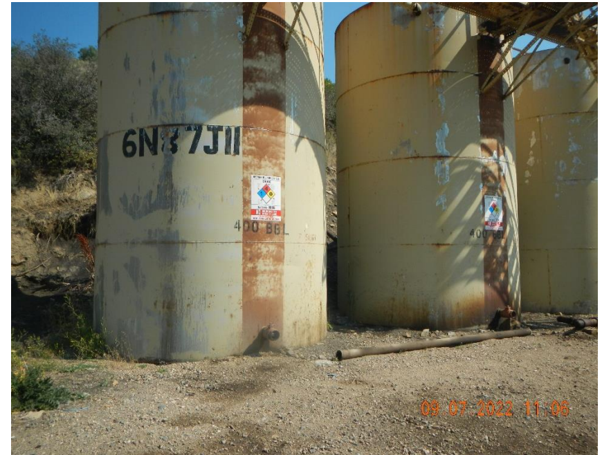
Oil stained ground inside of tank berm.