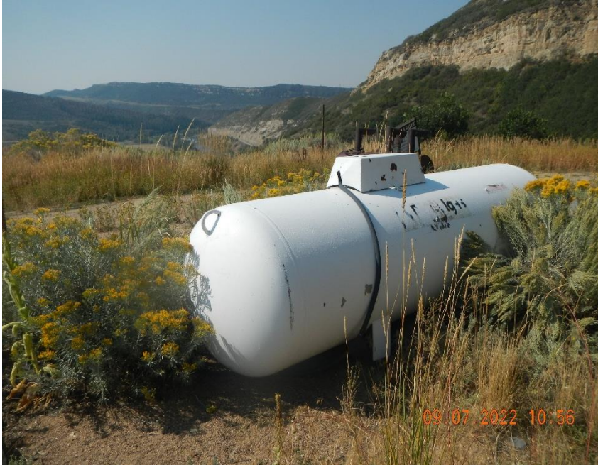
Propane tank with no labeling.