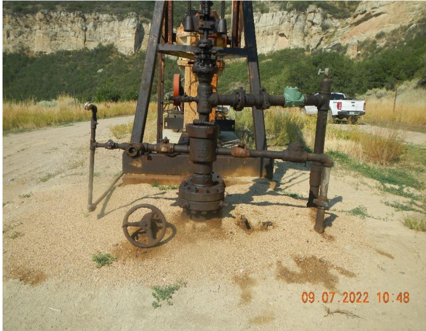
Oil stained ground at well.