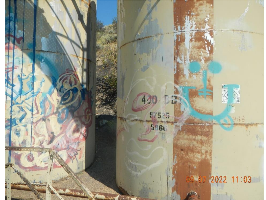
Tanks have painted on graffiti. Label is painted over.