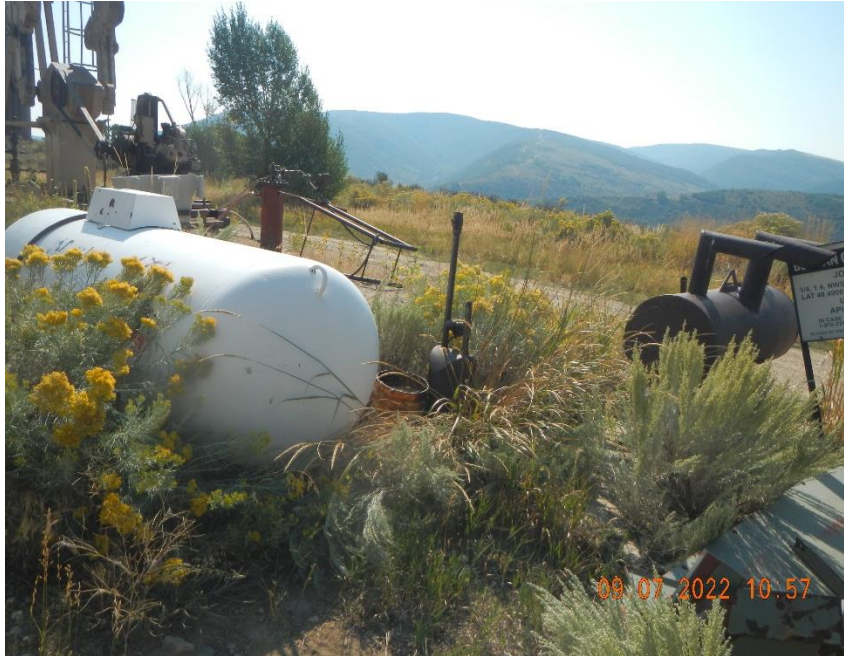
5 gallon bucket of oil with no lid or secondary containment.