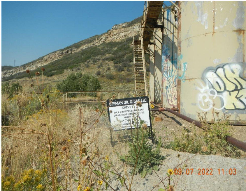
Tank battery Weeds Latitude: 40.487835 Longitude: -107.116073