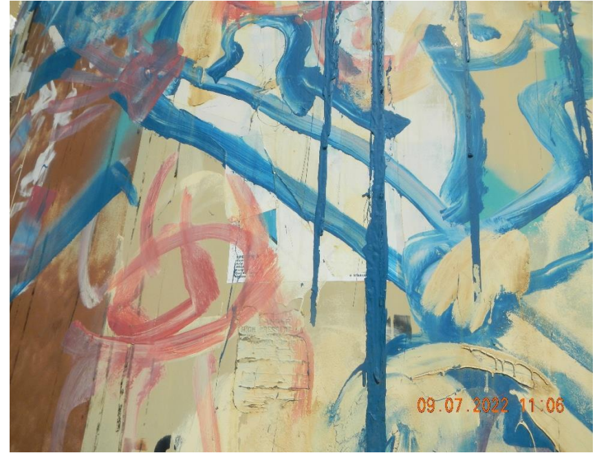
Tanks have painted on graffiti. Label is painted over.