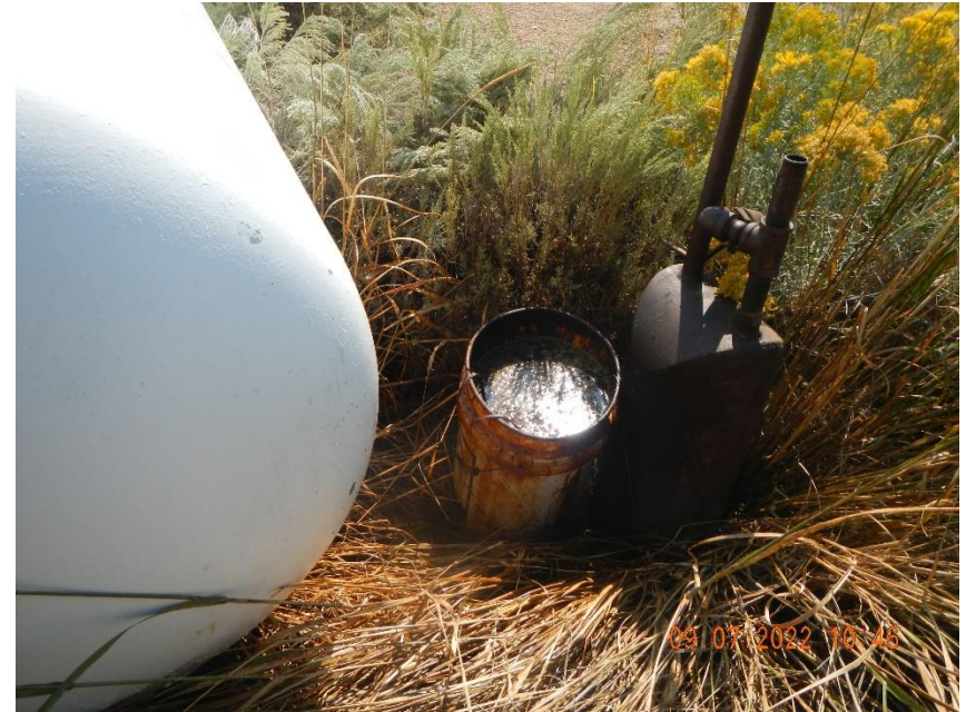
5 gallon bucket of oil with no lid or secondary containment.