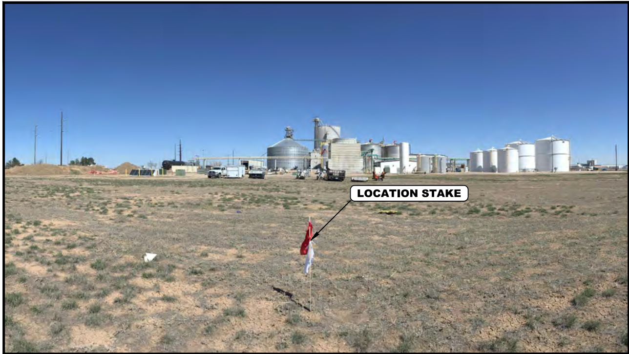
PHOTO: VIEW OF PROPOSED LOCATION