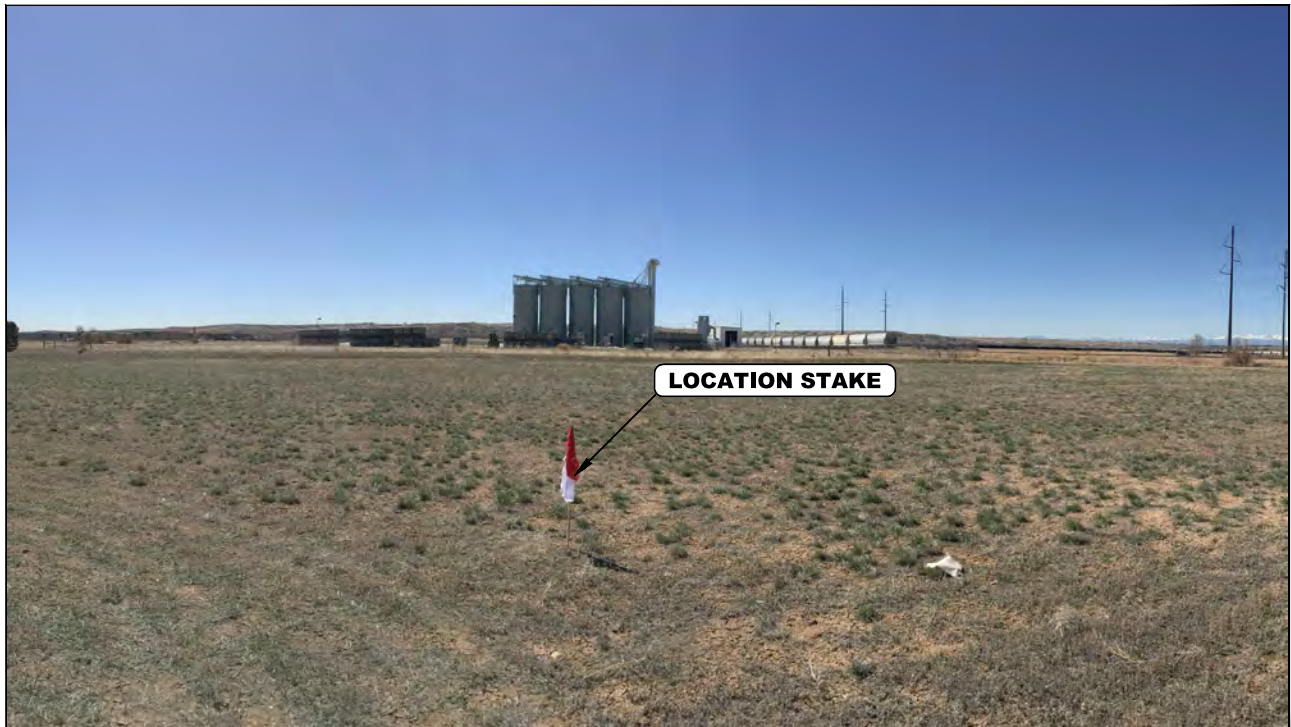
PHOTO: VIEW OF PROPOSED LOCATION