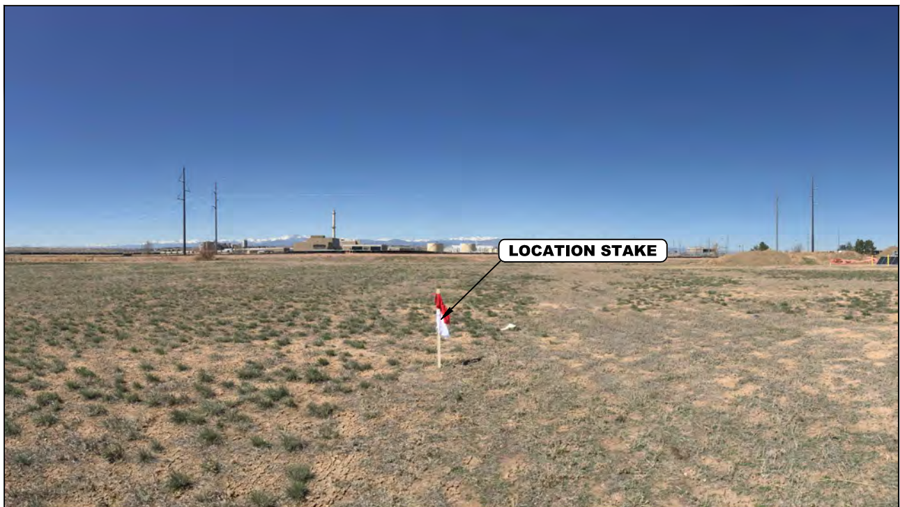
PHOTO: VIEW OF PROPOSED LOCATION