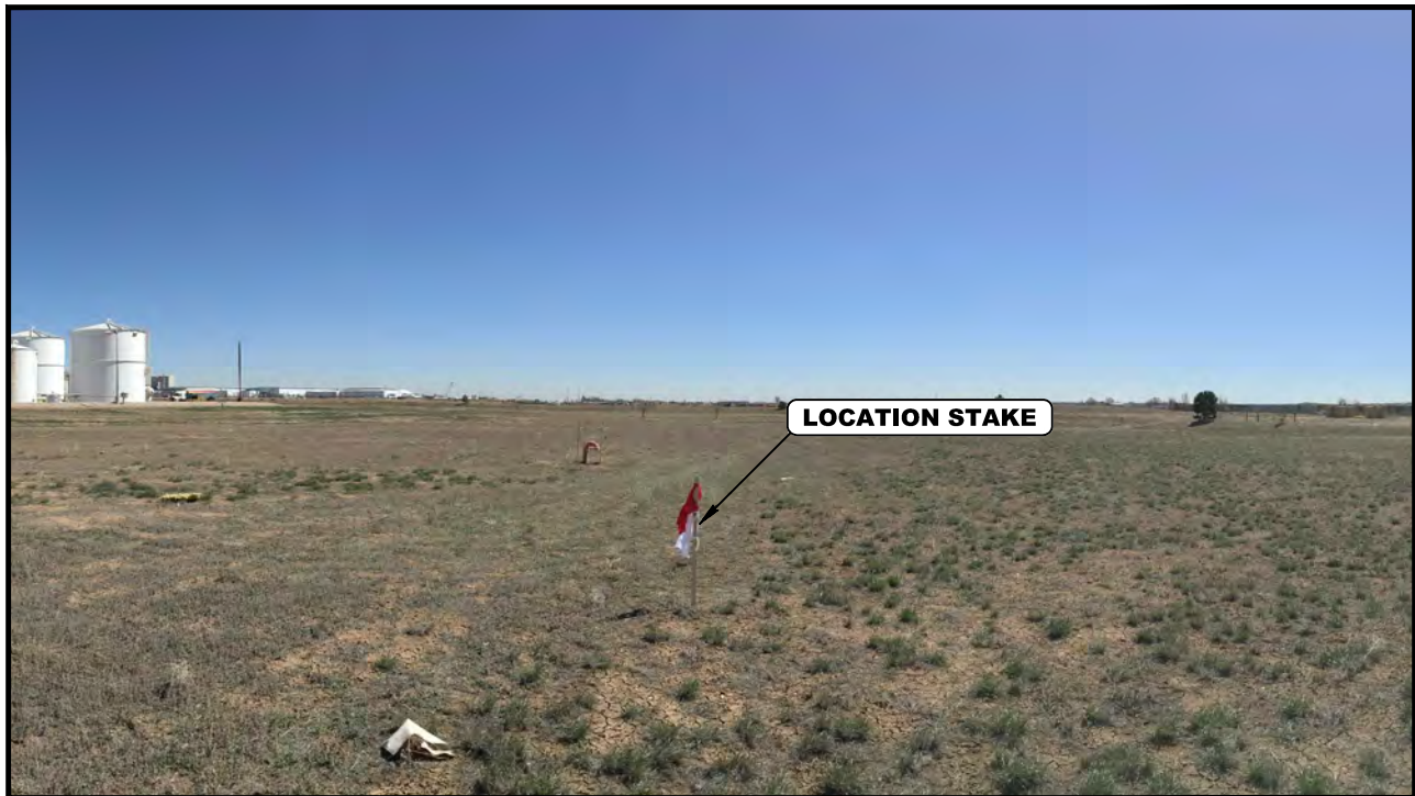
PHOTO: VIEW OF PROPOSED LOCATION