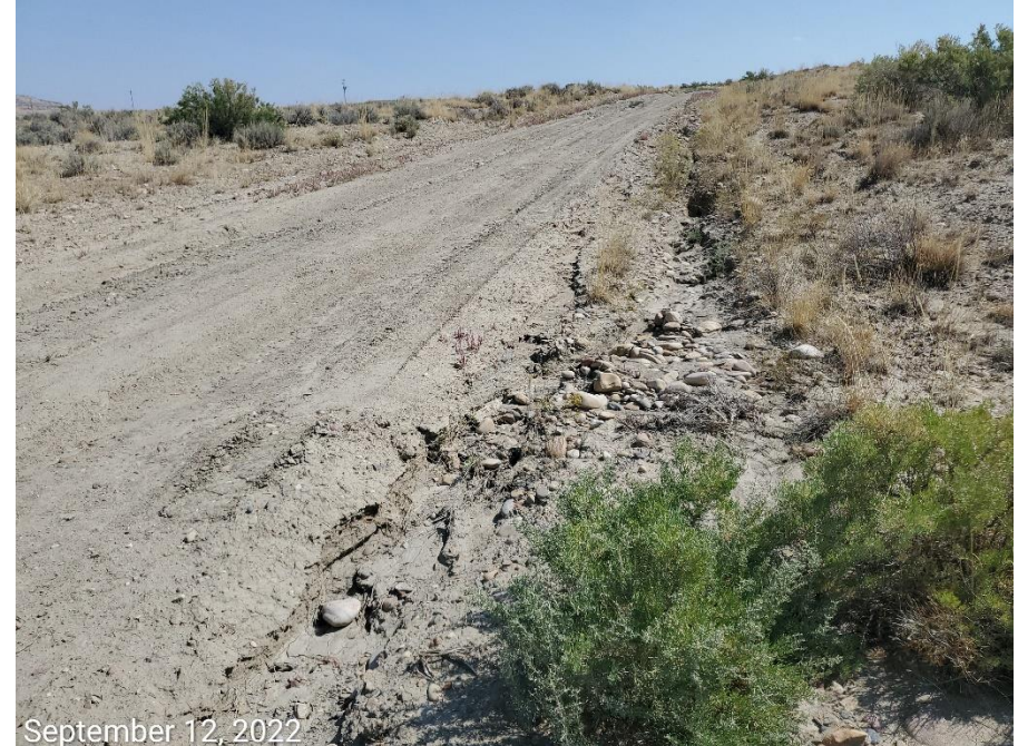
Photo 5: Photos 5-6 taken from access road. Photos show BMPs to minimize erosion, degradation and sediment transport are missing or insufficient along the access road; erosion degradation observed.