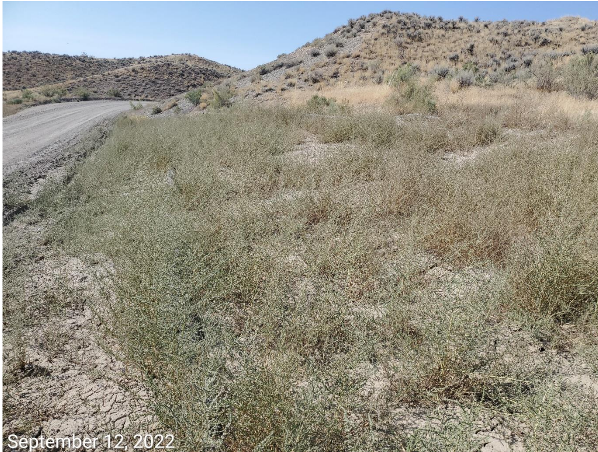
Photo 3: Photo taken from the west end of the Location (west side of the road), facing south. Photo example showing vegetation on Location is predominantly undesirable and noxious plant species, such as Russian thistle and Halogeton.