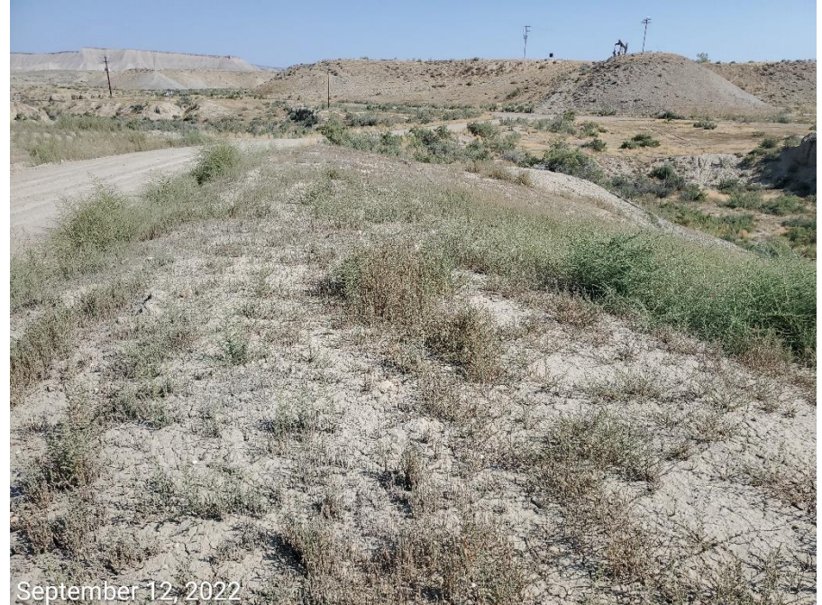
Photo 1: Photo taken from the west end of the Location (east side of the road). Photos provide an overview of the Location from north, northeast, southeast to south. Photos examples showing vegetation on Location is predominantly undesirable and noxious plant species, such as Russian thistle and Halogeton.