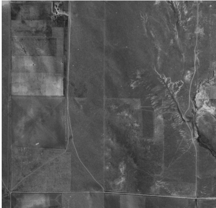
Photo 1. USGS imagery from 1953 illustrates pre-disturbance conditions.