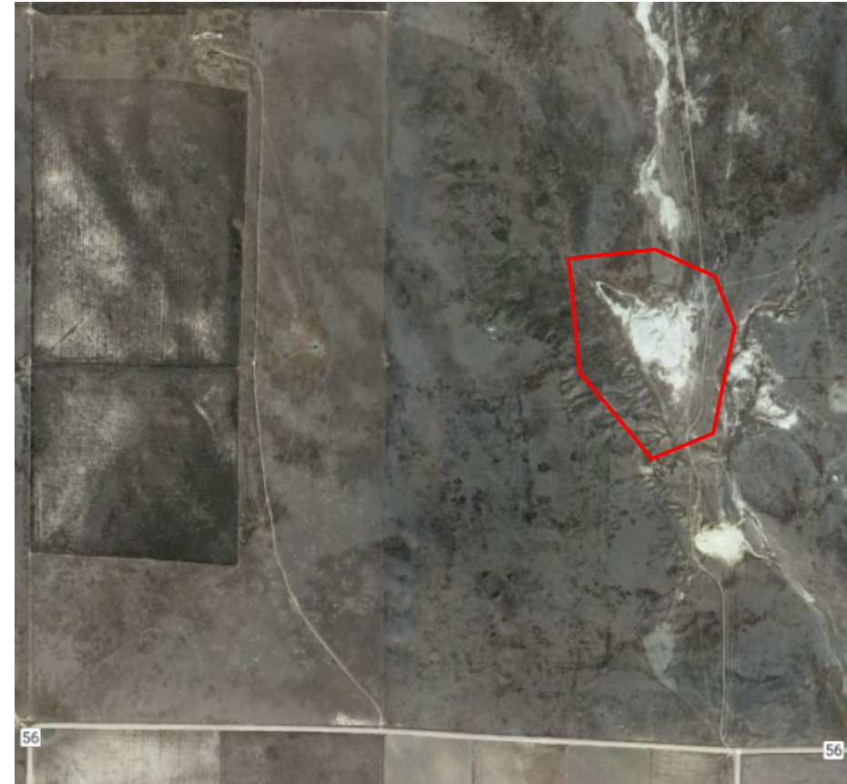
Photo 2. Google Earth aerial imagery from 10/15/2015.