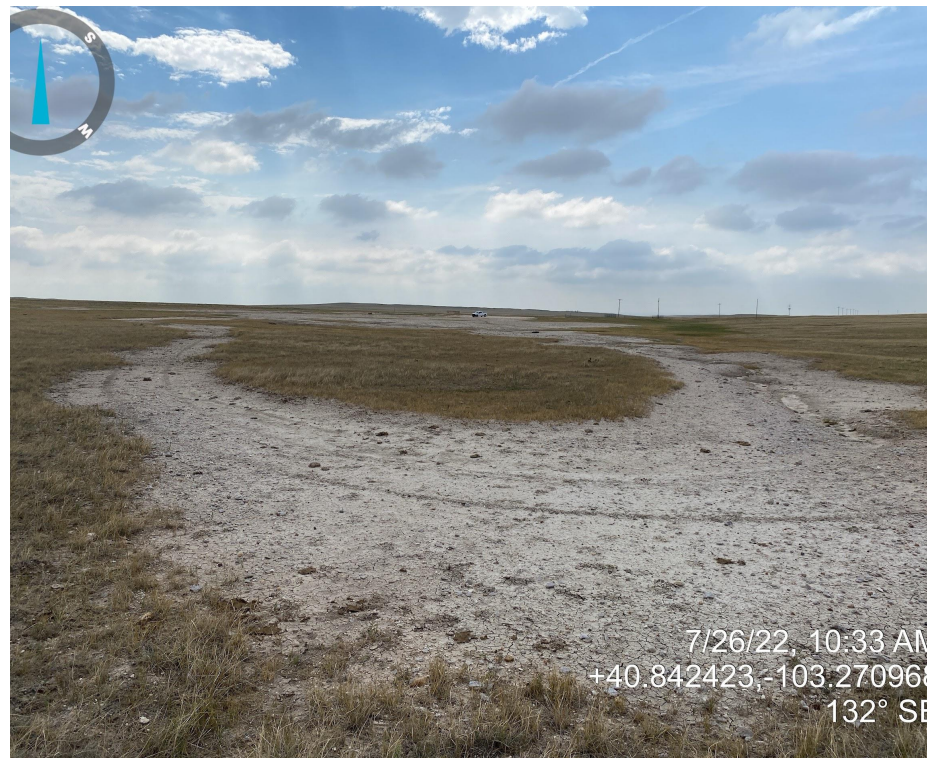
Photo 7. Photo taken from the northern spill area, facing Southeast. See comments under Photo 4.