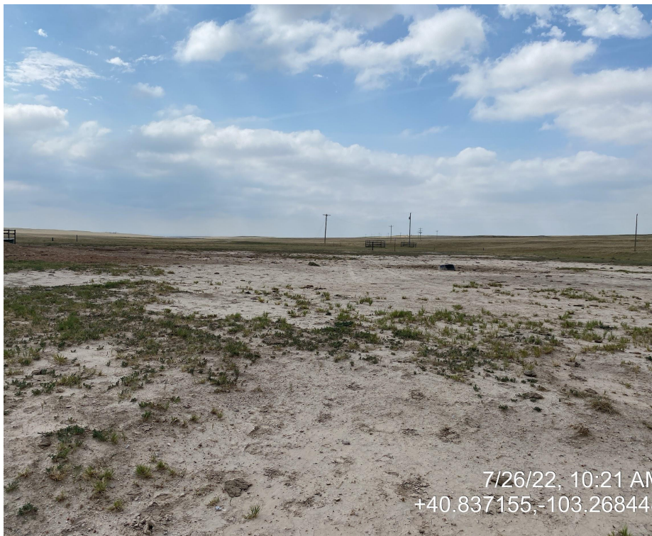
Photo 4. Photo taken from the southern spill area, facing Southeast. Photo illustrates an area that appears to be impacted by a produced water spill related this well.