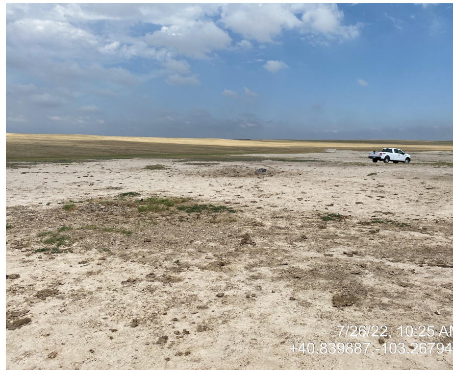
Photo 5. Photo taken from the southern spill area, facing Northwest. See comments under Photo 4.