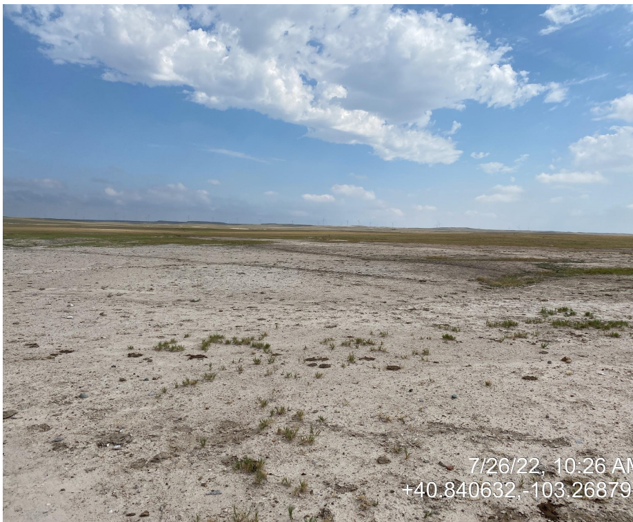
Photo 6. Photo taken from the central spill area, facing Northwest. See comments under Photo 4.