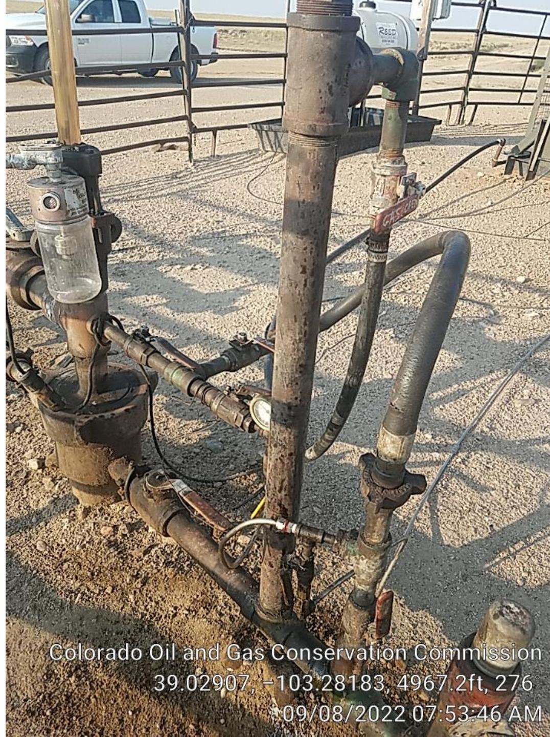
Pipe Connection Leaking

Colorado Oil and Gas Conservation Commission 39.02907, -103.28183, 4967.2ft, 276° 09/08/2022 07:53:46 AM