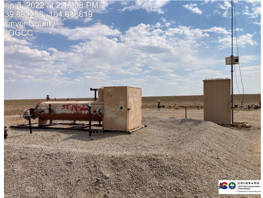
Pic 2 Gas Meter Run / Gas Meter Run

Sep 8, 2022 at 2:13:08 PM 39.882238,-104.636619 Denver County COGCC