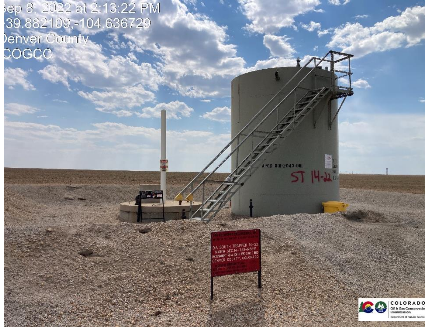
Pic 3 tanks