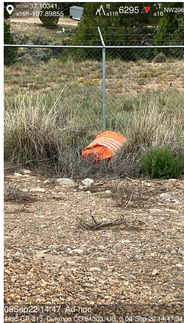
IMG 08 Unused equipment