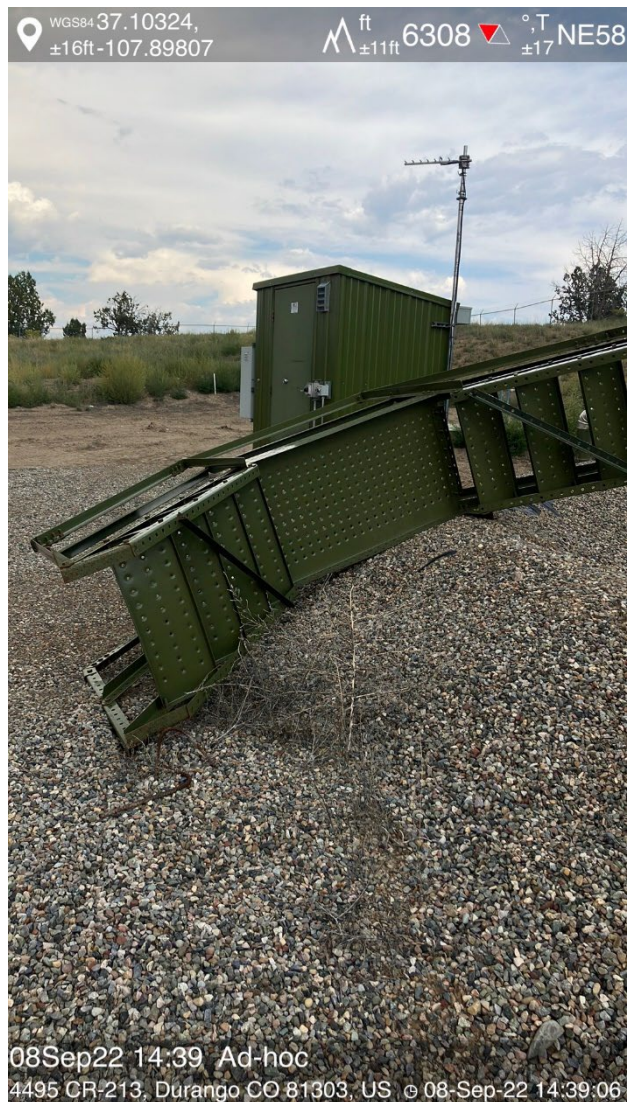
IMG 05 Stairs