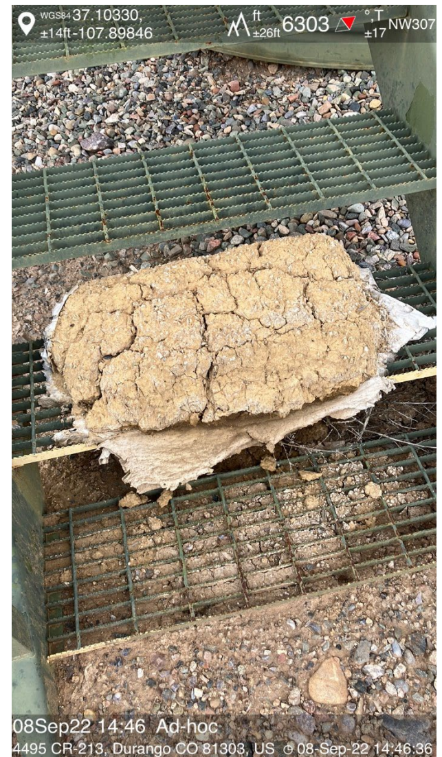
IMG 06 Unused supplies/debris