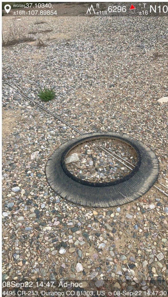
IMG 07 Unused equipment