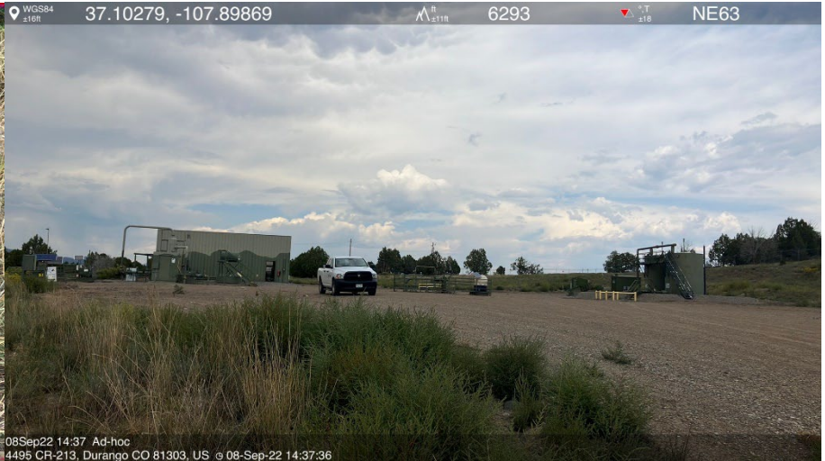
IMG 02 Location overview