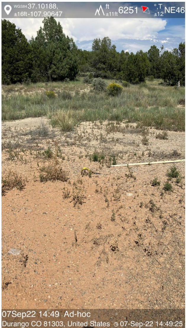
IMG 07 Rig anchor