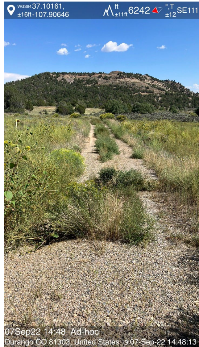
IMG 04 Weeds