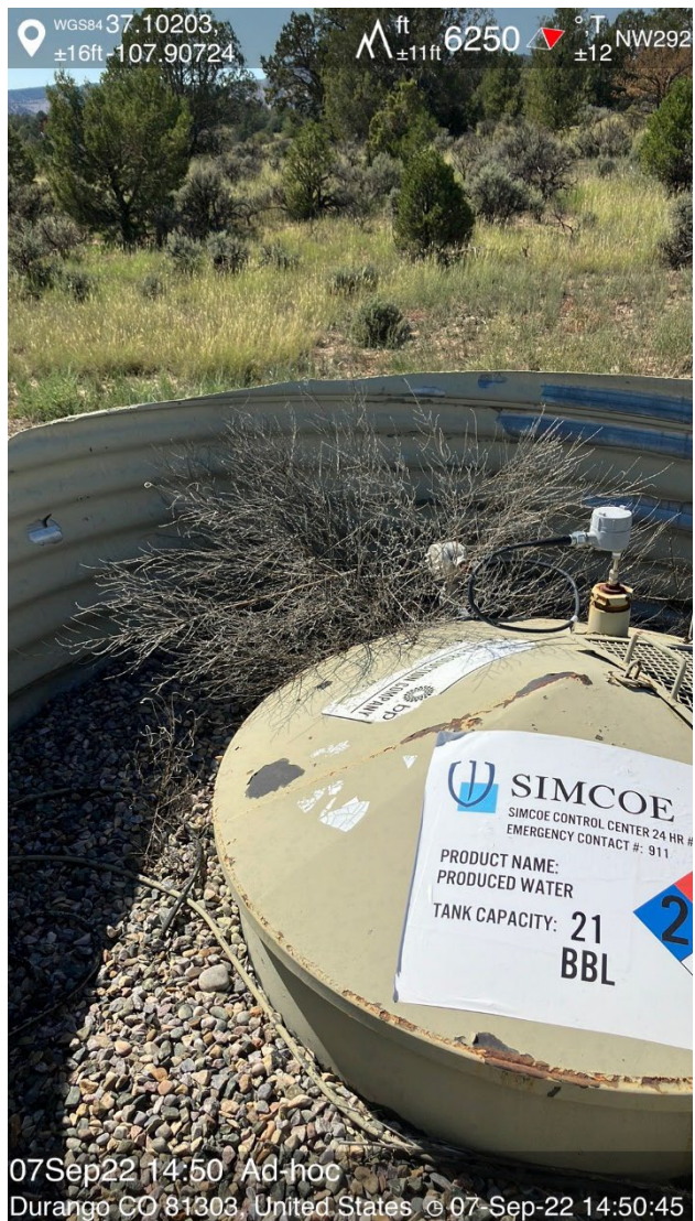
IMG 05 Weeds