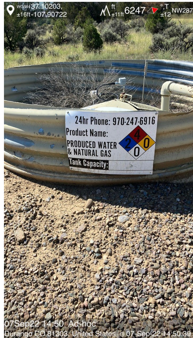
IMG 08 Produced water