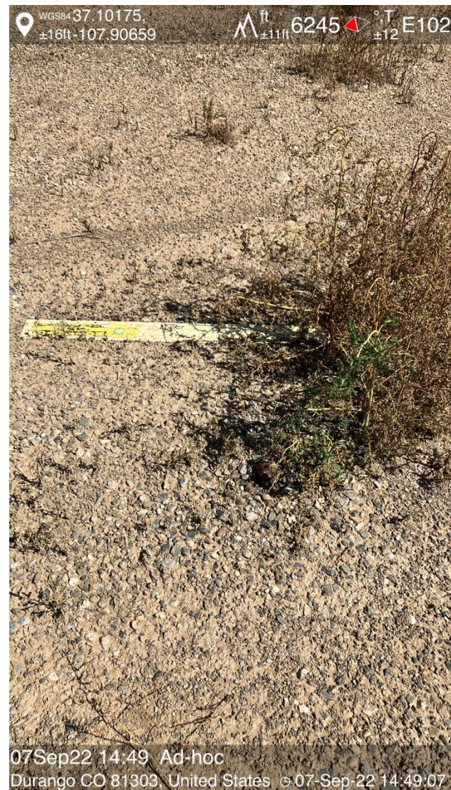
IMG 06 Rig anchor