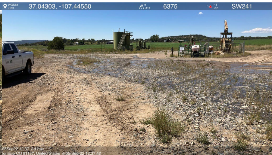
IMG 06 Water flowing over location