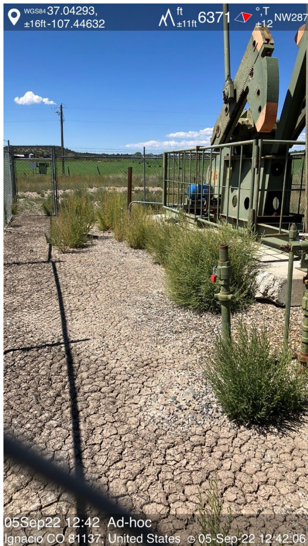
IMG 09 Weeds at wellhead