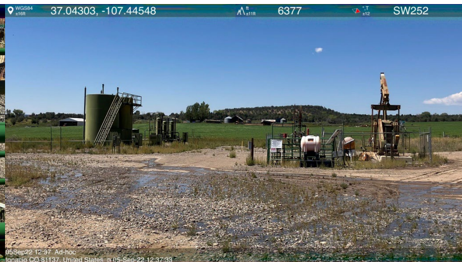
IMG 04 Location overview