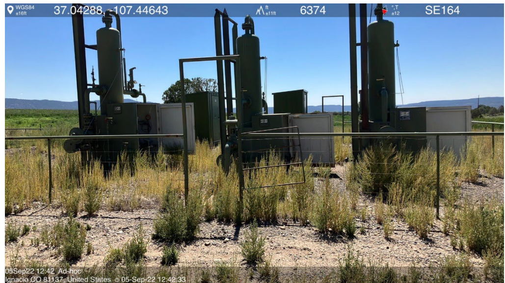
IMG 10 Weeds at separators