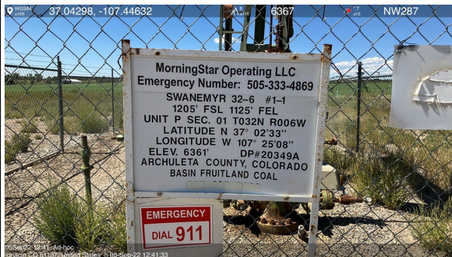
IMG 01 Well sign