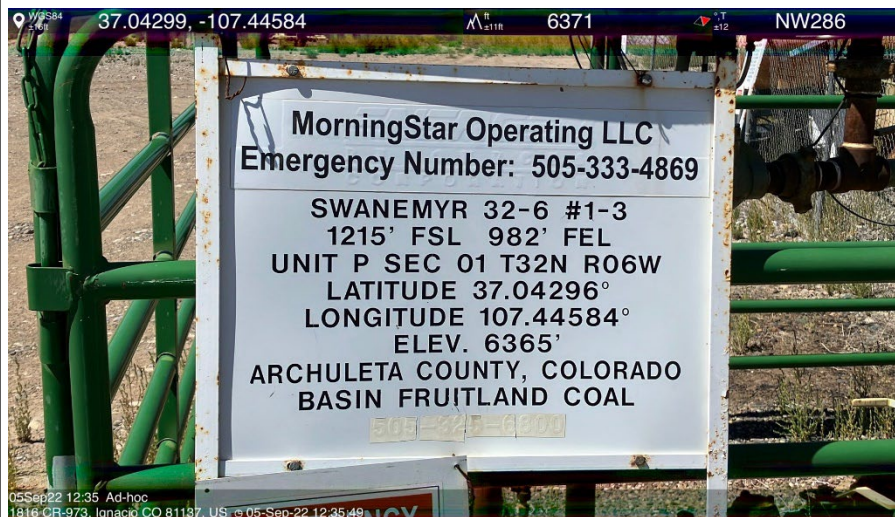
IMG 03 Well sign