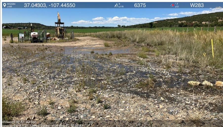
IMG 05 Water flowing over location