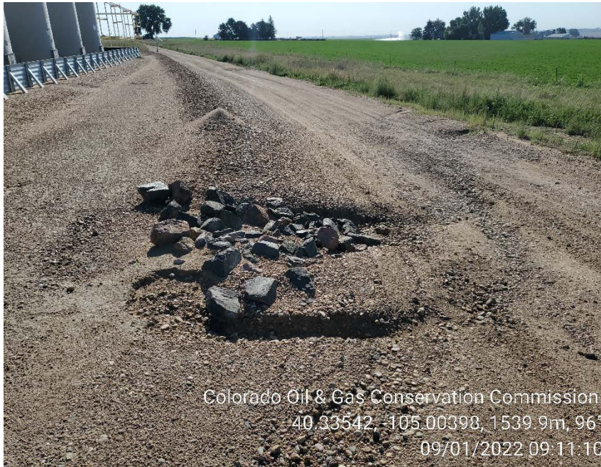
Location storm water BMP's