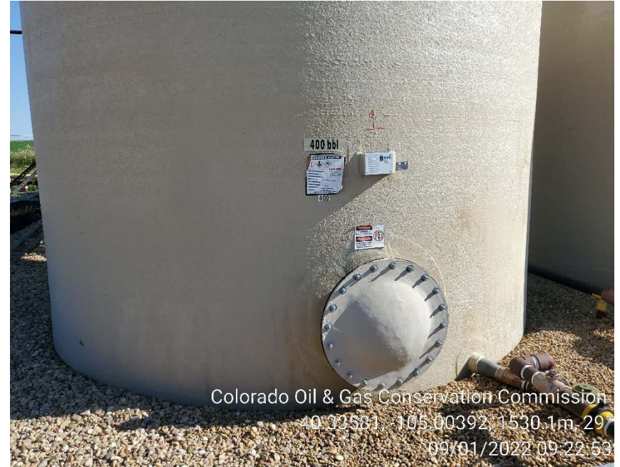
Produced water tank placards from berm wall