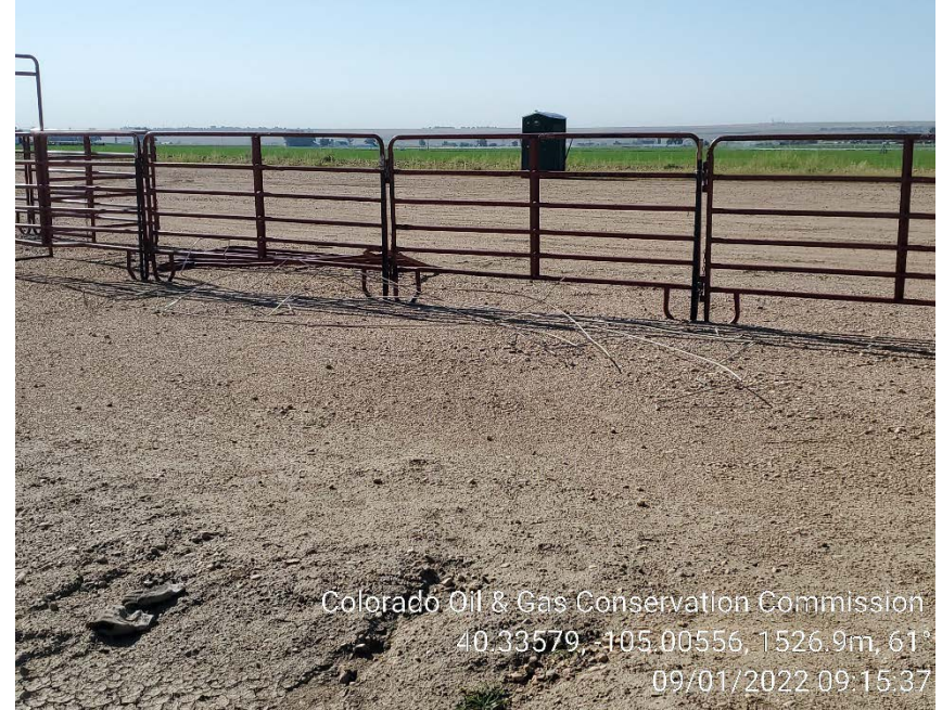
Unused stainless tubing