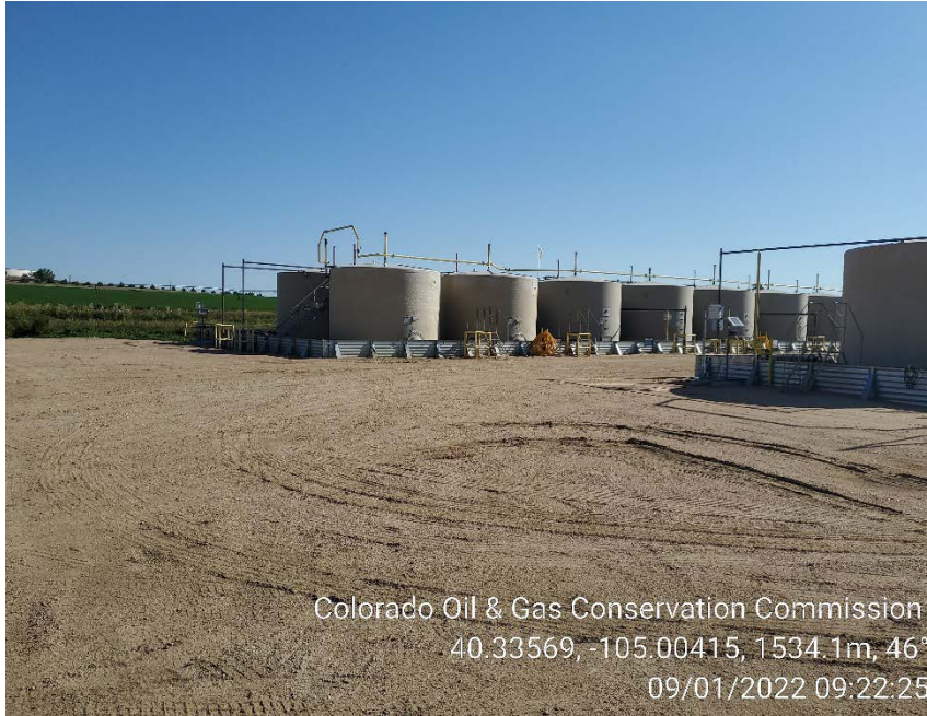
Produced water tank placards at 100' +/-