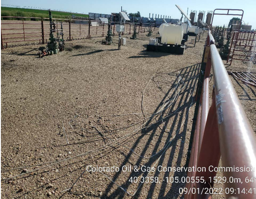
Unused stainless tubing