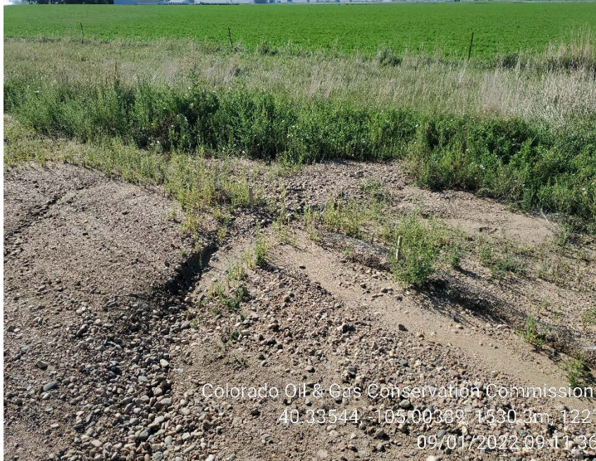
Lease road storm water BMP's