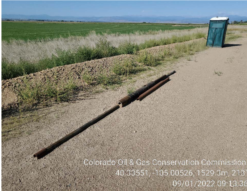
Unused downhole equipment