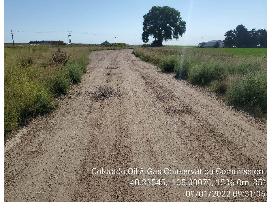
Lease road damage