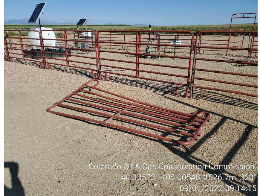
Unused fence panel