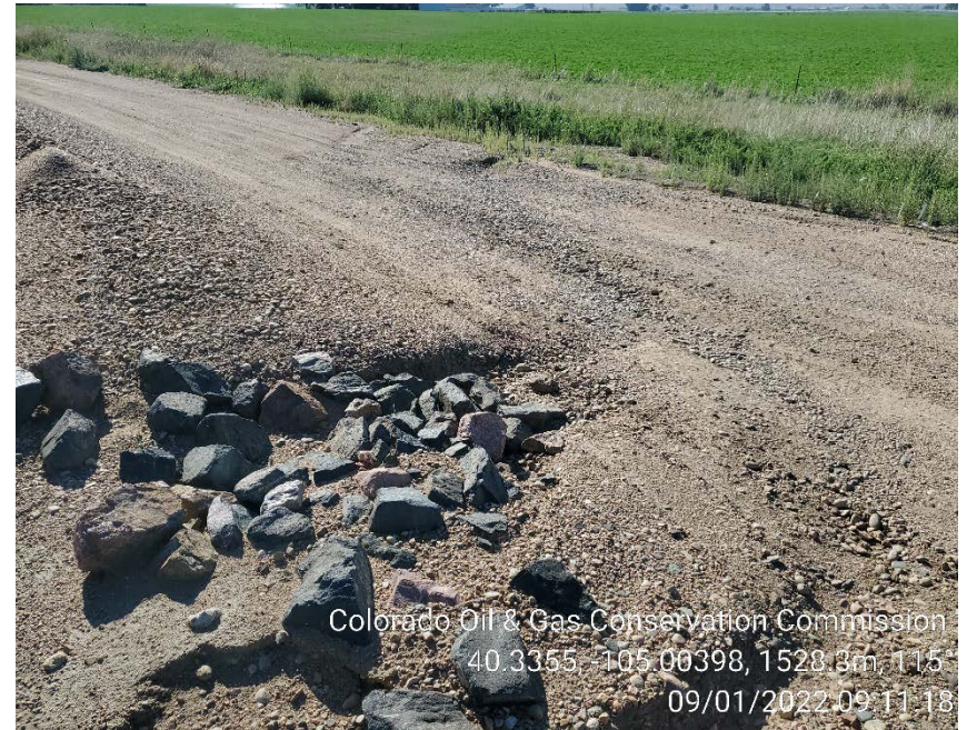
Location and lease road storm water BMP's