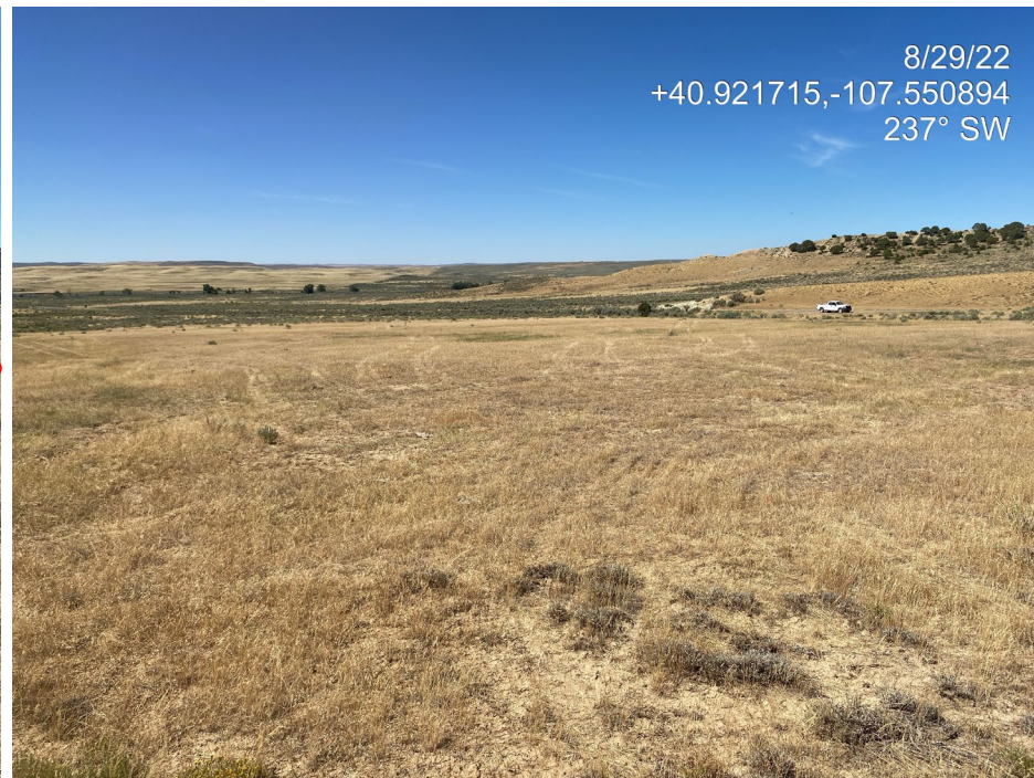
Photo 2. Photo taken from the northeast shows an overview of the Location. Note vehicle tracks throughout.