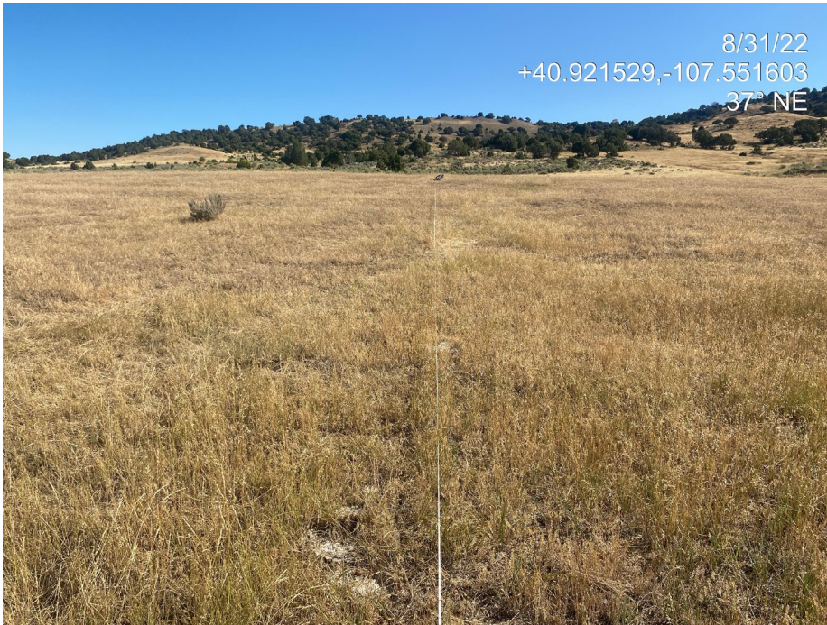
Photo 7. Photo taken from the center of the Location shows the end of the disturbed area vegetation monitoring transect.