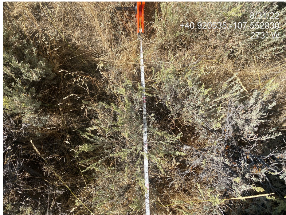
Photo 12. Photo taken to the south of the Location shows the ground surface at the end of the reference area vegetation monitoring transect.