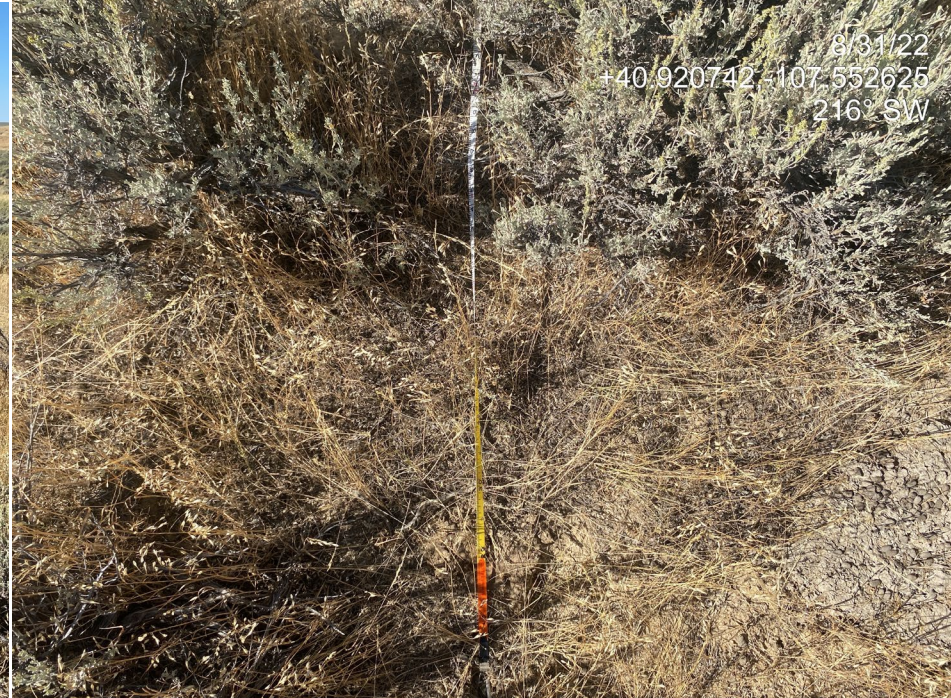
Photo 10. Photo taken to the south of the Location shows the ground surface at the start of the reference area vegetation monitoring transect.