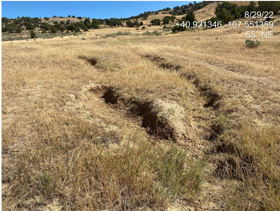
Photo 3. Photo taken from the center of the Location shows gully erosion. Photo also shows patches of desirable western wheatgrass in foreground compared to cover of cheatgrass (Noxious Weed) and alyssum (annual undesirable plant species/weed) in other areas.