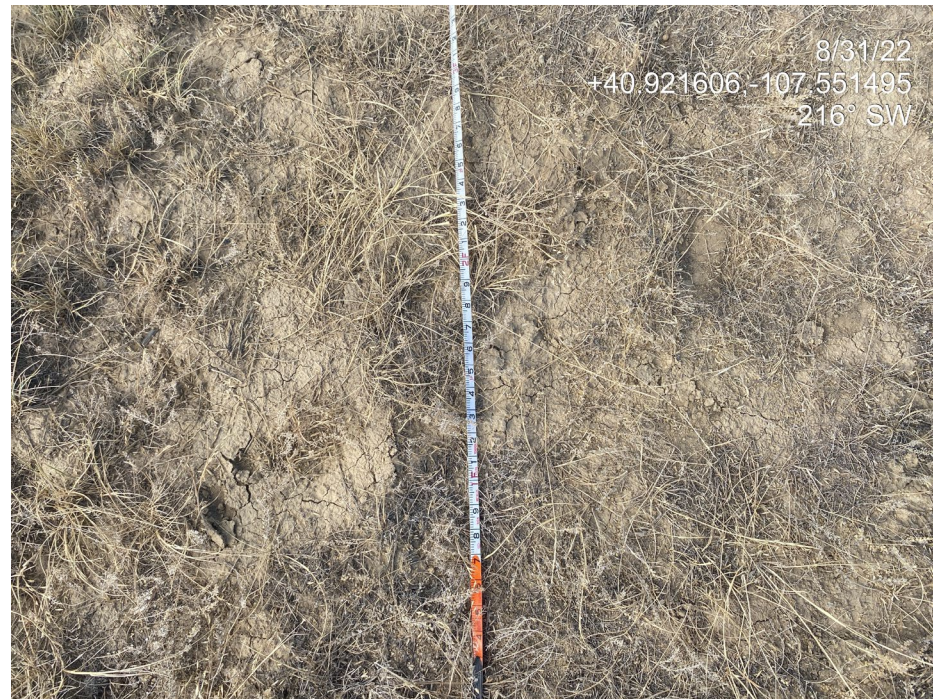
Photo 6. Photo taken from the north of the Location shows the ground surface at the start of the disturbed area vegetation monitoring transect.