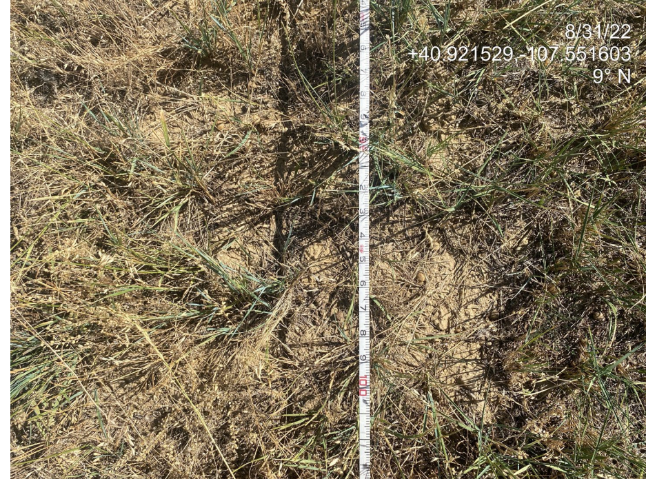
Photo 8. Photo taken from the center of the Location shows the ground surface at the end of the disturbed area vegetation monitoring transect.