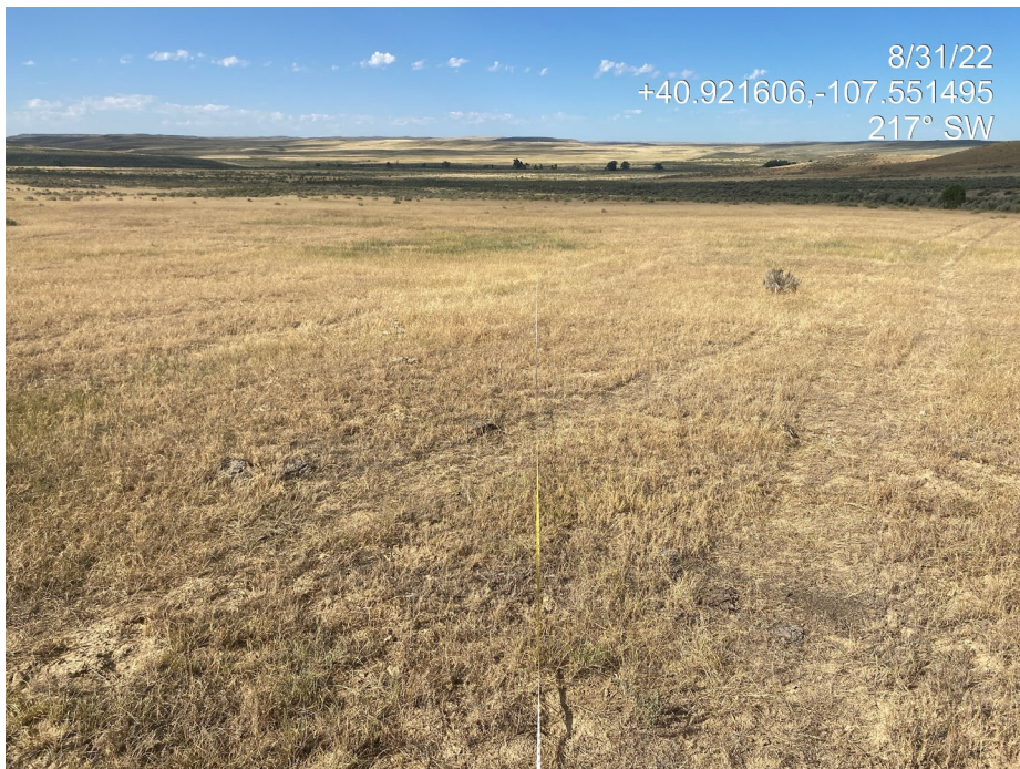
Photo 5. Photo taken from the north of the Location shows the start of the disturbed area vegetation monitoring transect.