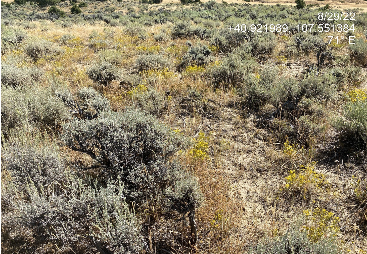
Photo 13. Photo shows reference area vegetation to the north of the Location.