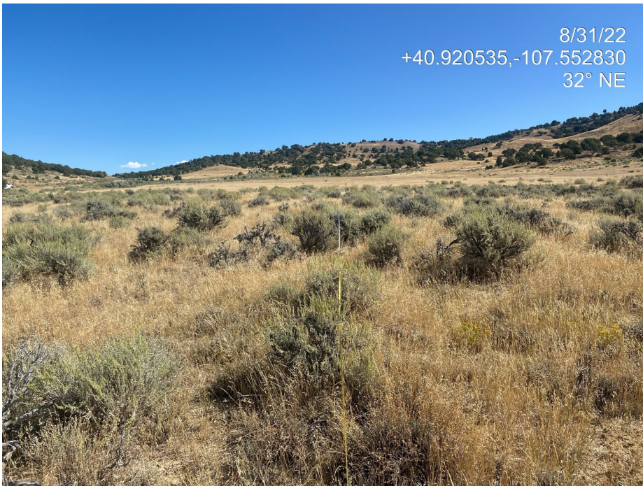
Photo 11. Photo taken to the south of the Location shows the end of the reference area vegetation monitoring transect.