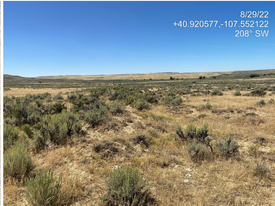
Photo 4. Photo taken from the south of the Location shows a natural drainage off-site which also runs through the Location. The sides of this drainage are well stabilized by perennial vegetation and gully erosion is not present, as it is on Location. See Photo 3.