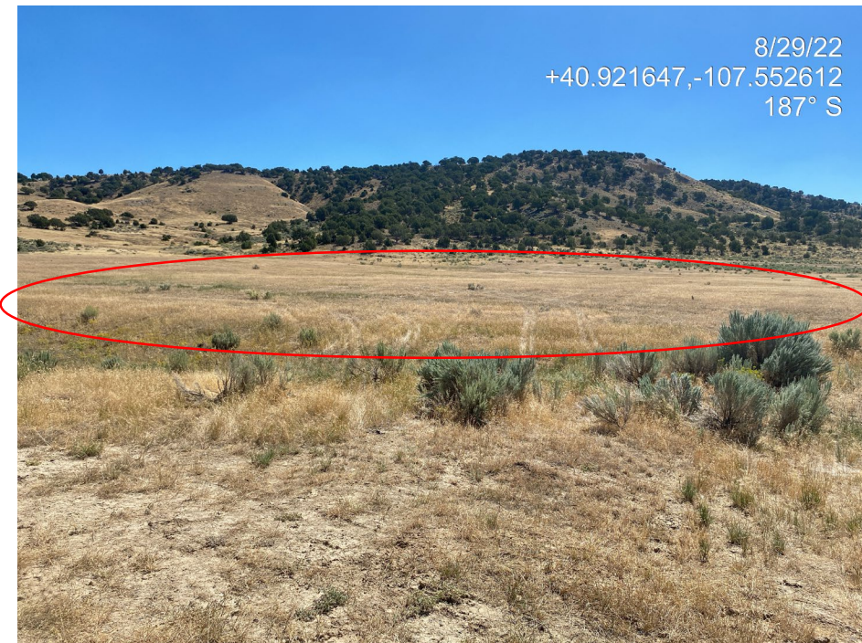
Photo 1. Photo taken from the northwest of the Location shows the access road in the foreground of the photo has been reclaimed. Photo also shows an overview of the Location (red circle). Note also, tire tracks showing vehicles accessing Location.