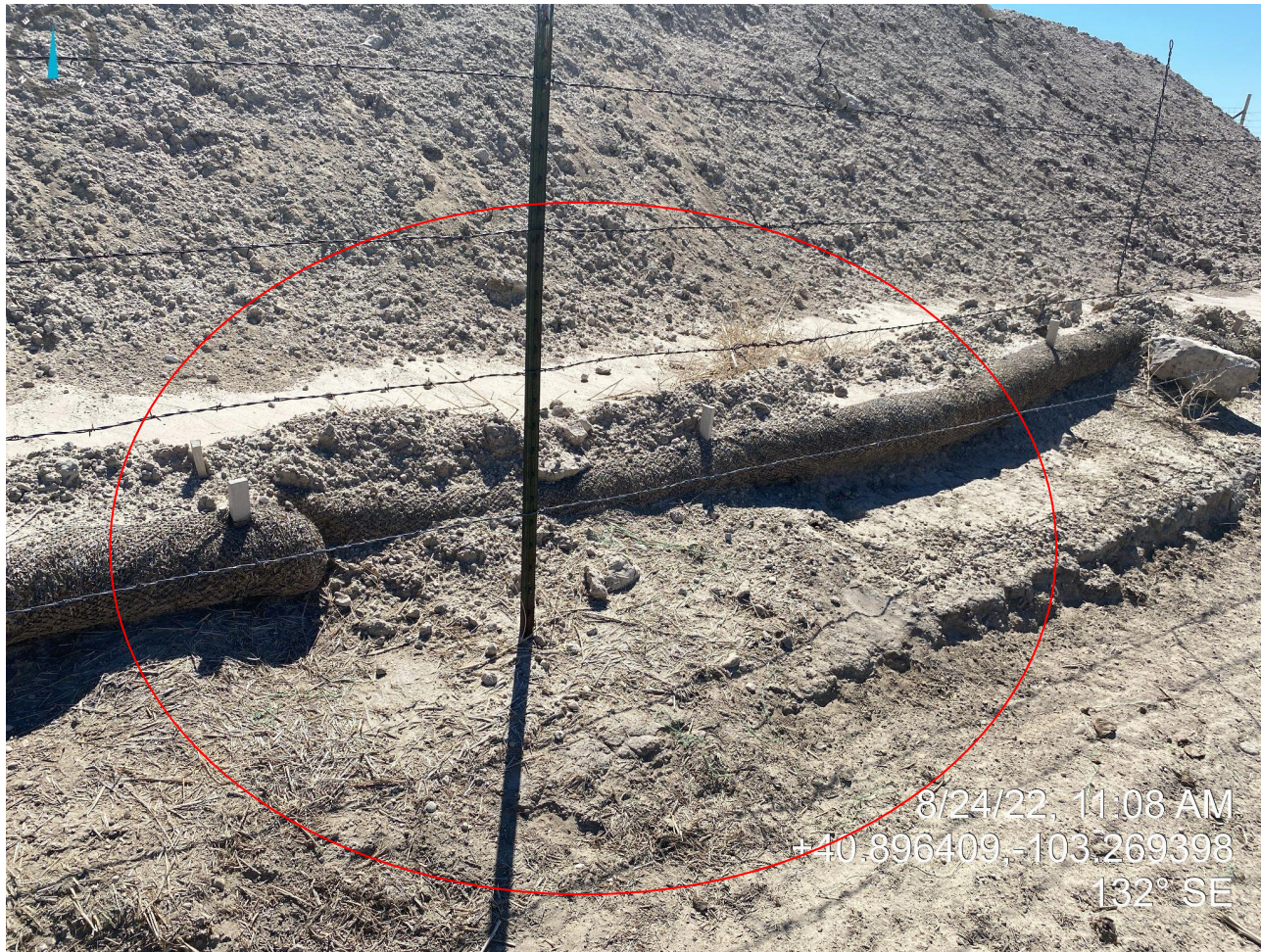
Photo 30. Pit photo taken from western edge, facing southeast. Photo illustrates straw wattles buried and insufficient in keeping sediment laden stormwater from exiting location, outlined in red.