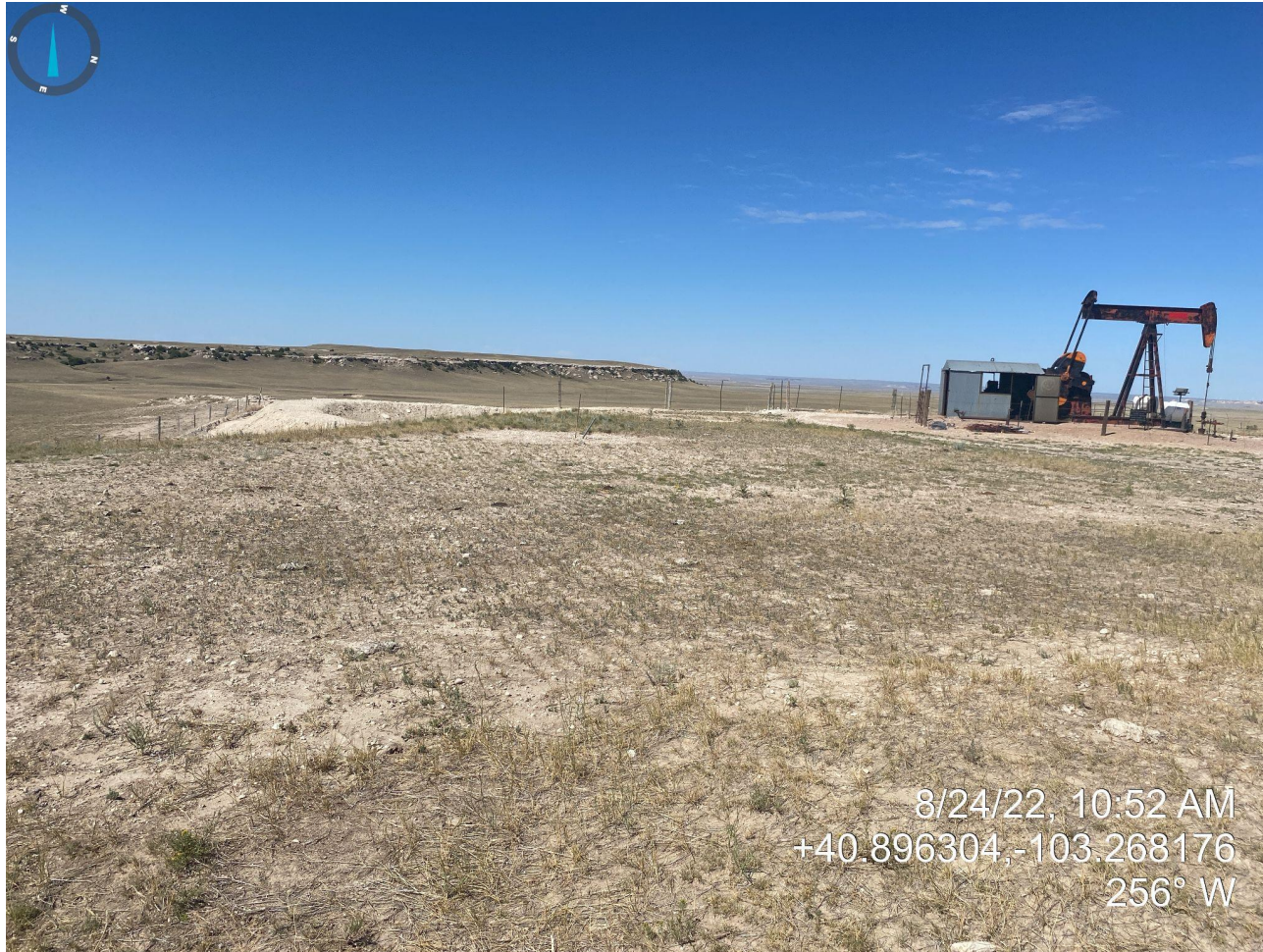
Photo 5. Location photo taken from eastern portion, facing west. Photo illustrates revegetation attempts within affected area.