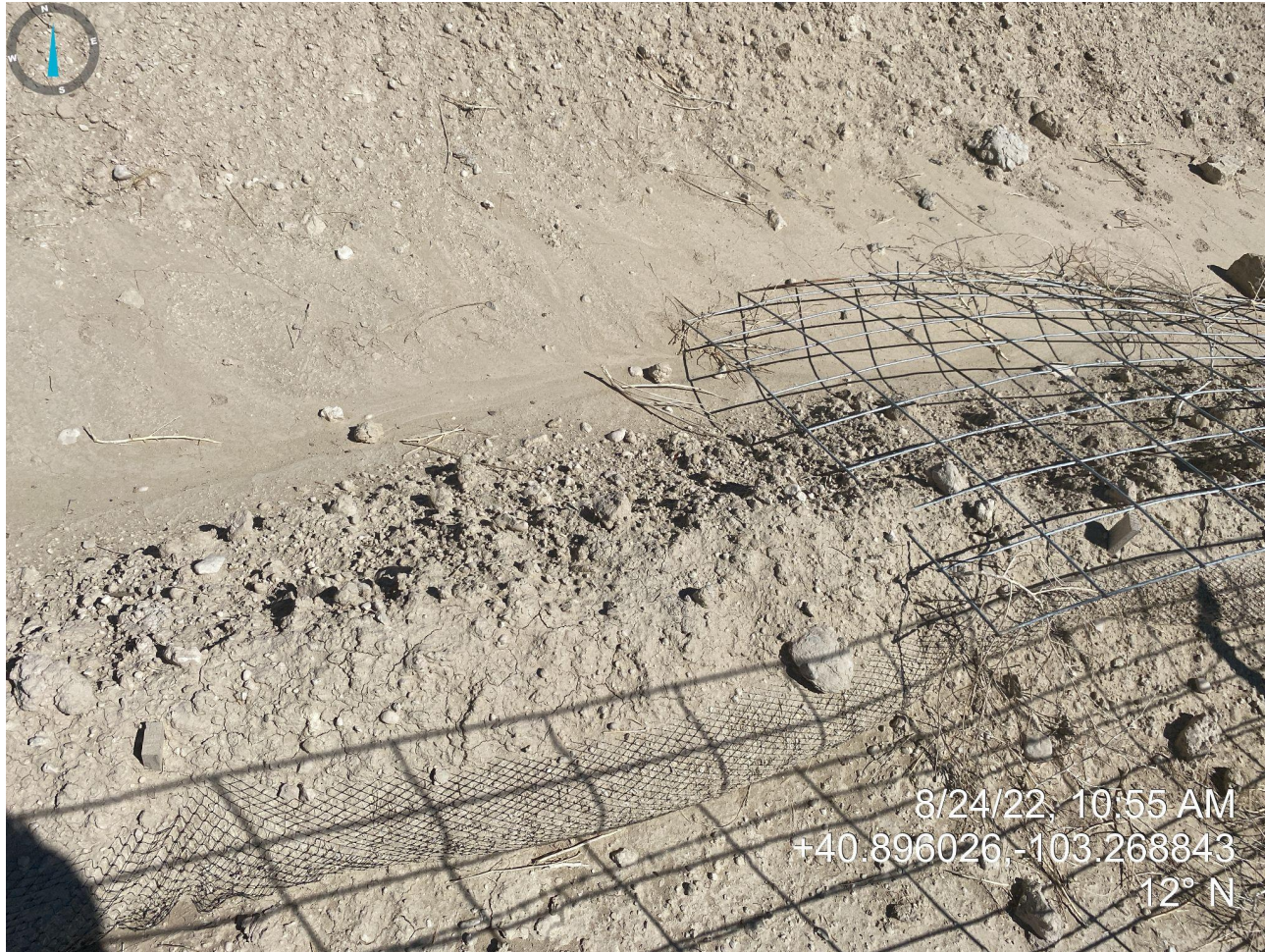
Photo 14. Photo taken from southern portion of pit; close up of buried straw wattles.