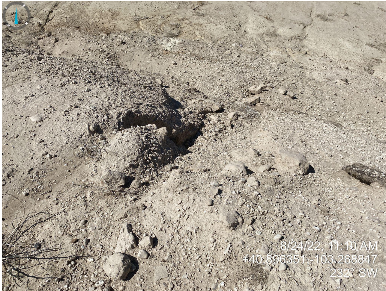
Photo 35. Pit photo taken from northeastern portion, near pump jack, close up. Photo illustrates minor gully erosion on eastern side of pit.