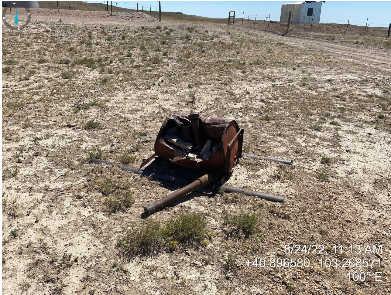
Photo 37. Location photo taken near center portion, facing east. Photo illustrates unused equipment and/or debris left on location.