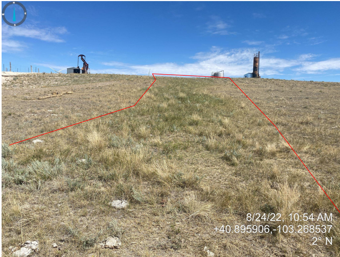
Photo 10. Photo taken adjacent to salt kill area and southeast of location, facing north. Photo illustrates reference area not impact by salt kill, outlined in red.