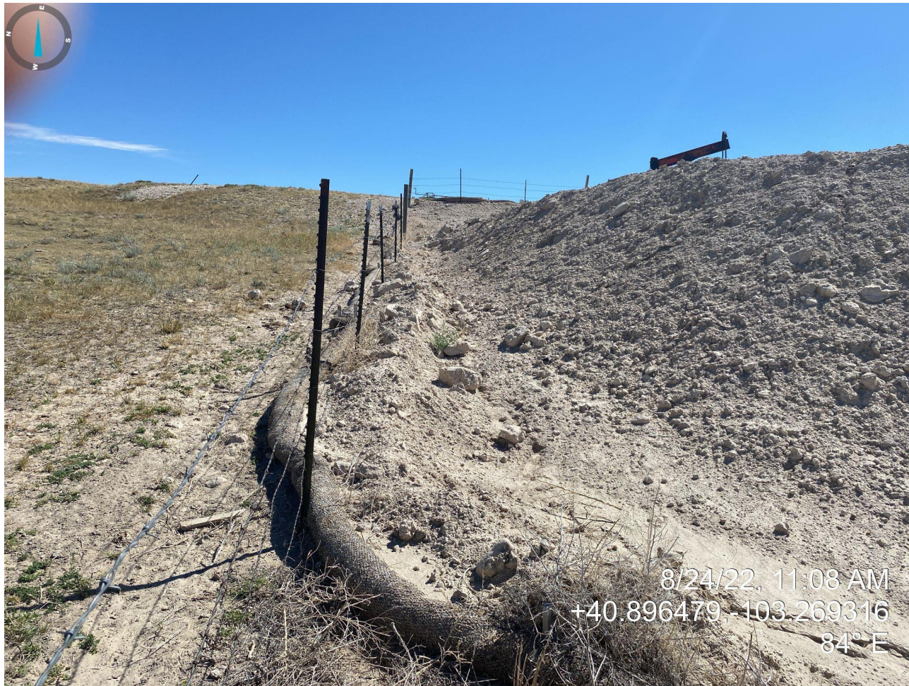
Photo 31. Pit photo taken from northwestern corner, facing east. See comments in photo 12.