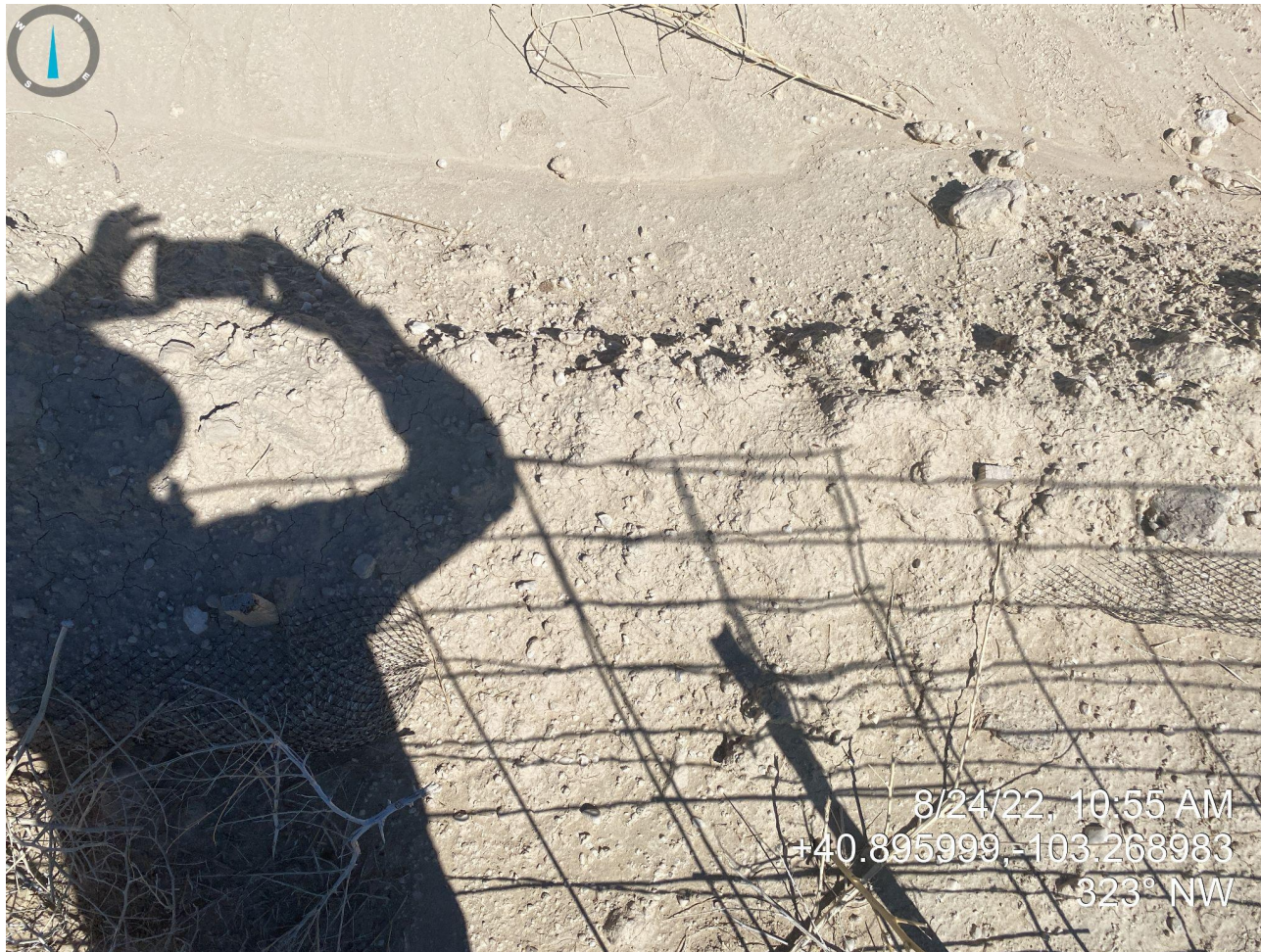
Photo 15. Photo taken from southern portion of pit; close up of inadequate stormwater BMPs. Sediment laden stormwater has buried the straw wattles and is exiting the location.