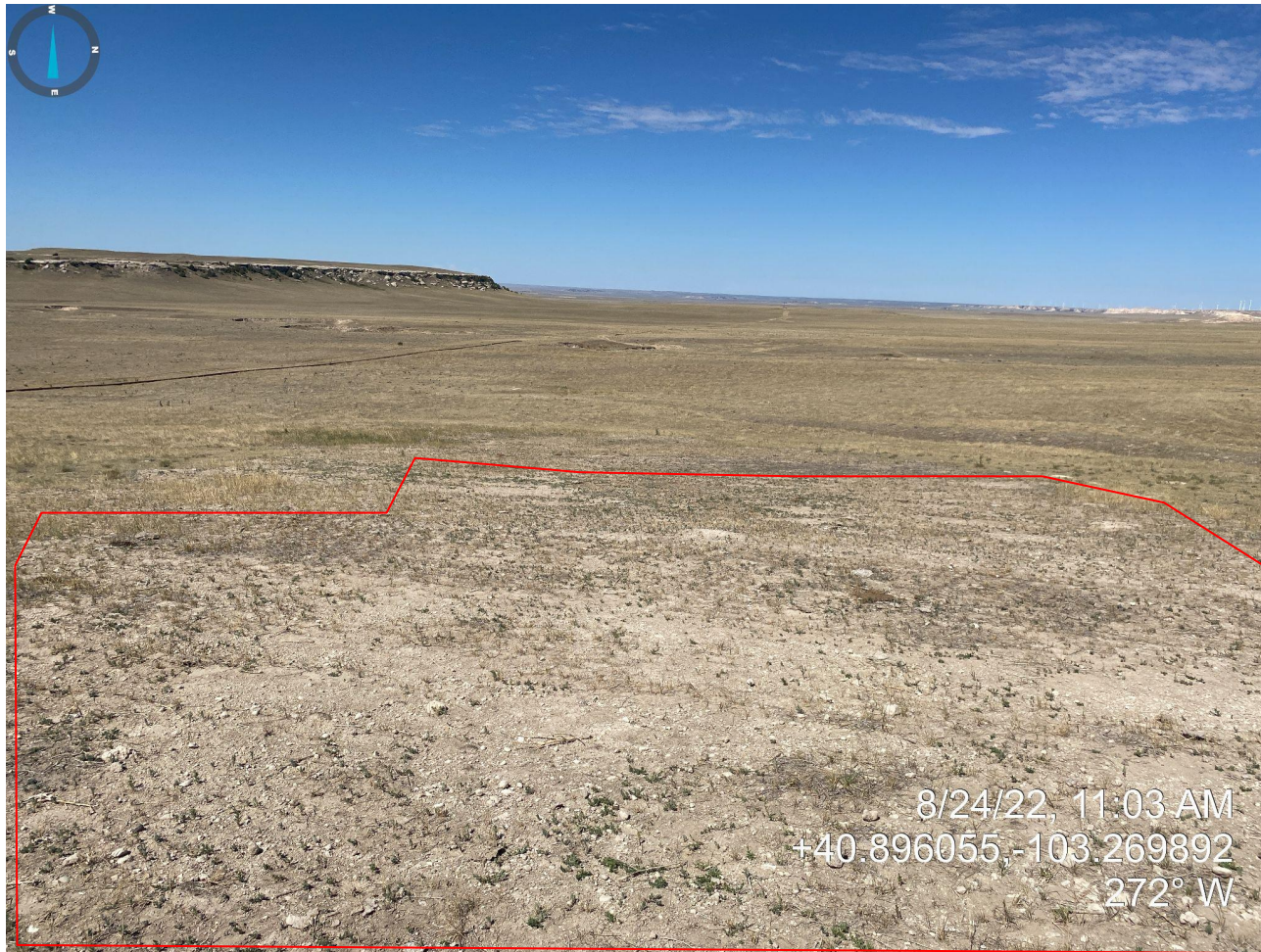
Photo 27. Salt kill area photo taken from western edge of location, facing west. see comments in photo 26.