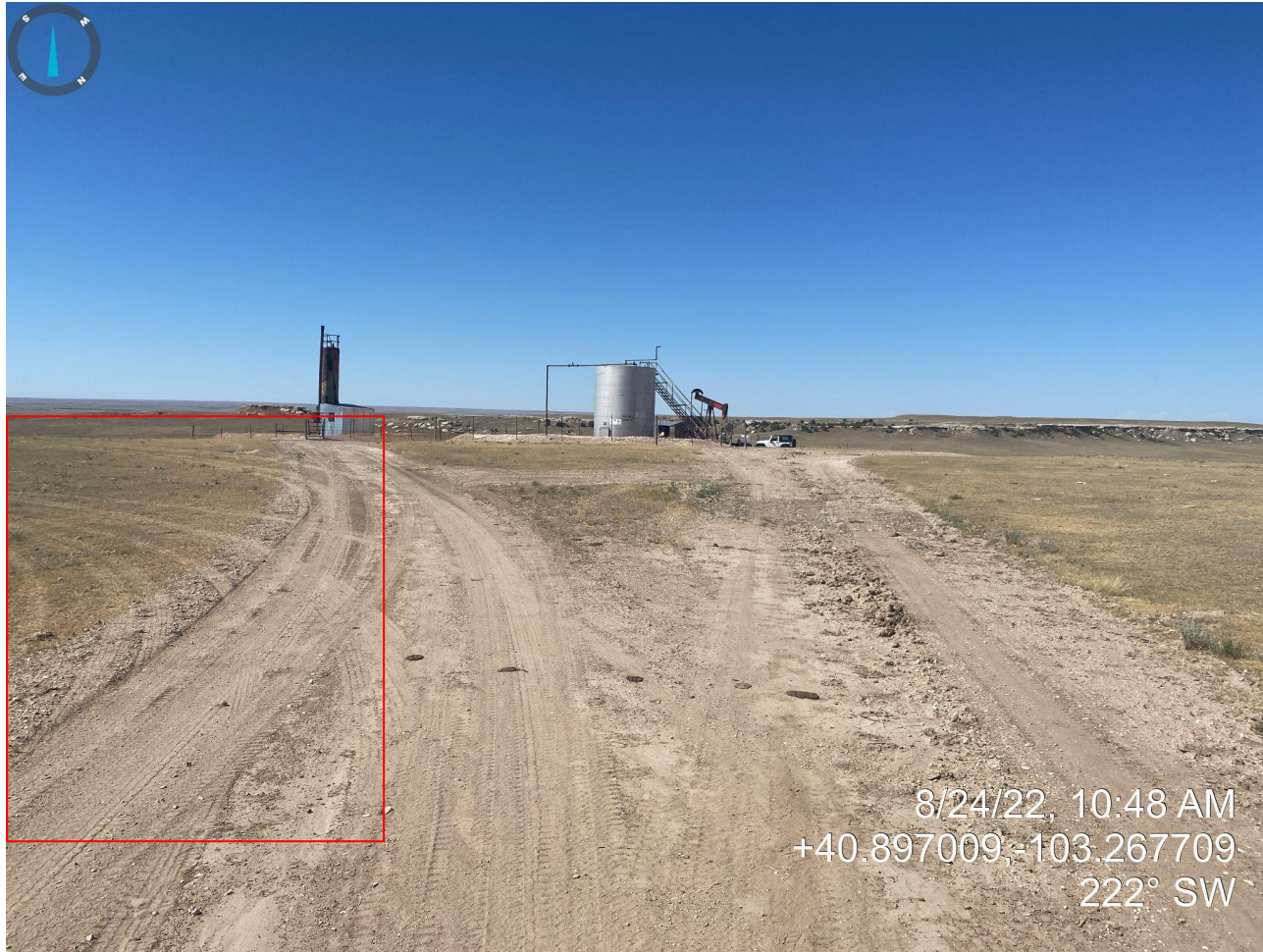
Photo 1. Location photo taken near access road gate/entrance, facing southwest. Photo illustrates vehicle tracking off location.