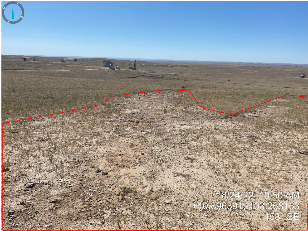
Photo 2. Location photo taken from southeast portion, facing southeast. Red outline illustrates salt kill impact and absence of vegetation cover or temporary stormwater BMPs within affected area.