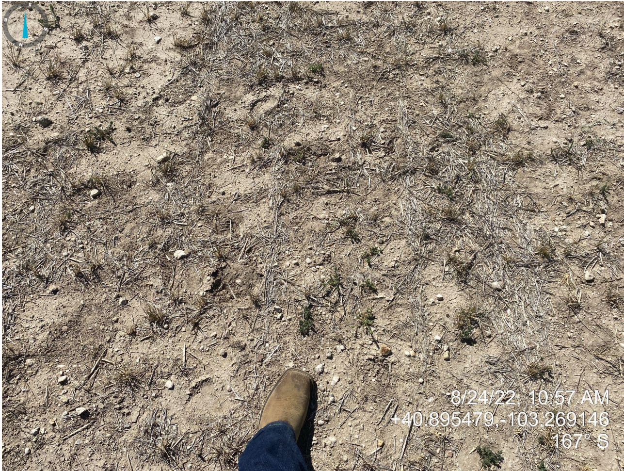
Photo 20. Close up photo within the center portion of the salt kill area. Photo illustrates some desirable vegetation present (buffalo grass, wheatgrass).