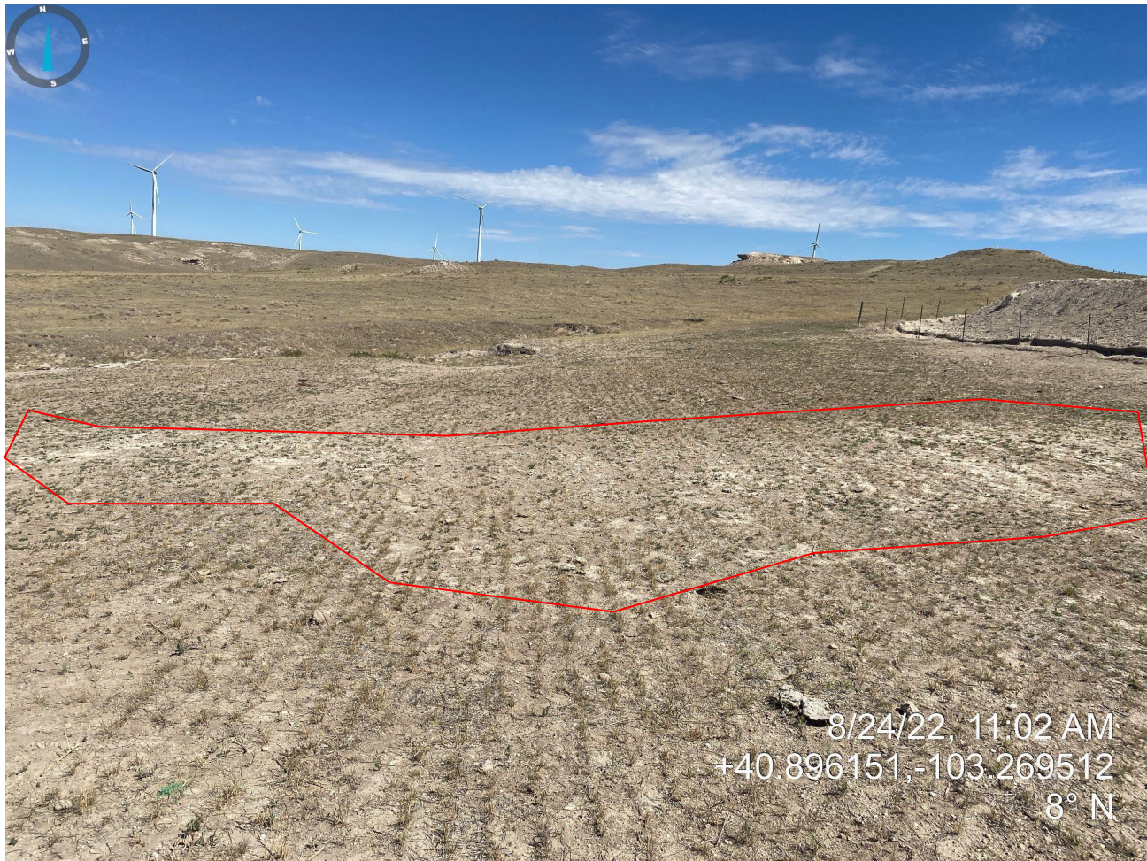
Photo 26. Salt Kill area photo taken west of location, facing north. Photo illustrates this portion of the salt kill area has failed to provide uniform vegetation cover resulting in bare soil. Area outlined in red illustrates recent sediment transport offsite, or soil exceeding Table 915-1 standards, or both.