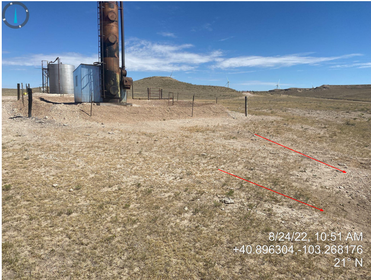
Photo 4. Location photo taking from southeast portion, facing north. Photo illustrates starting point of runoff source, from photo 3, outlined in red.