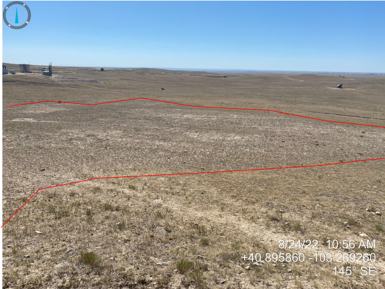
Photo 19. Photo taken of salt kill area from the southwest corner of the pit, facing southeast. Salk kill area outlined in red.