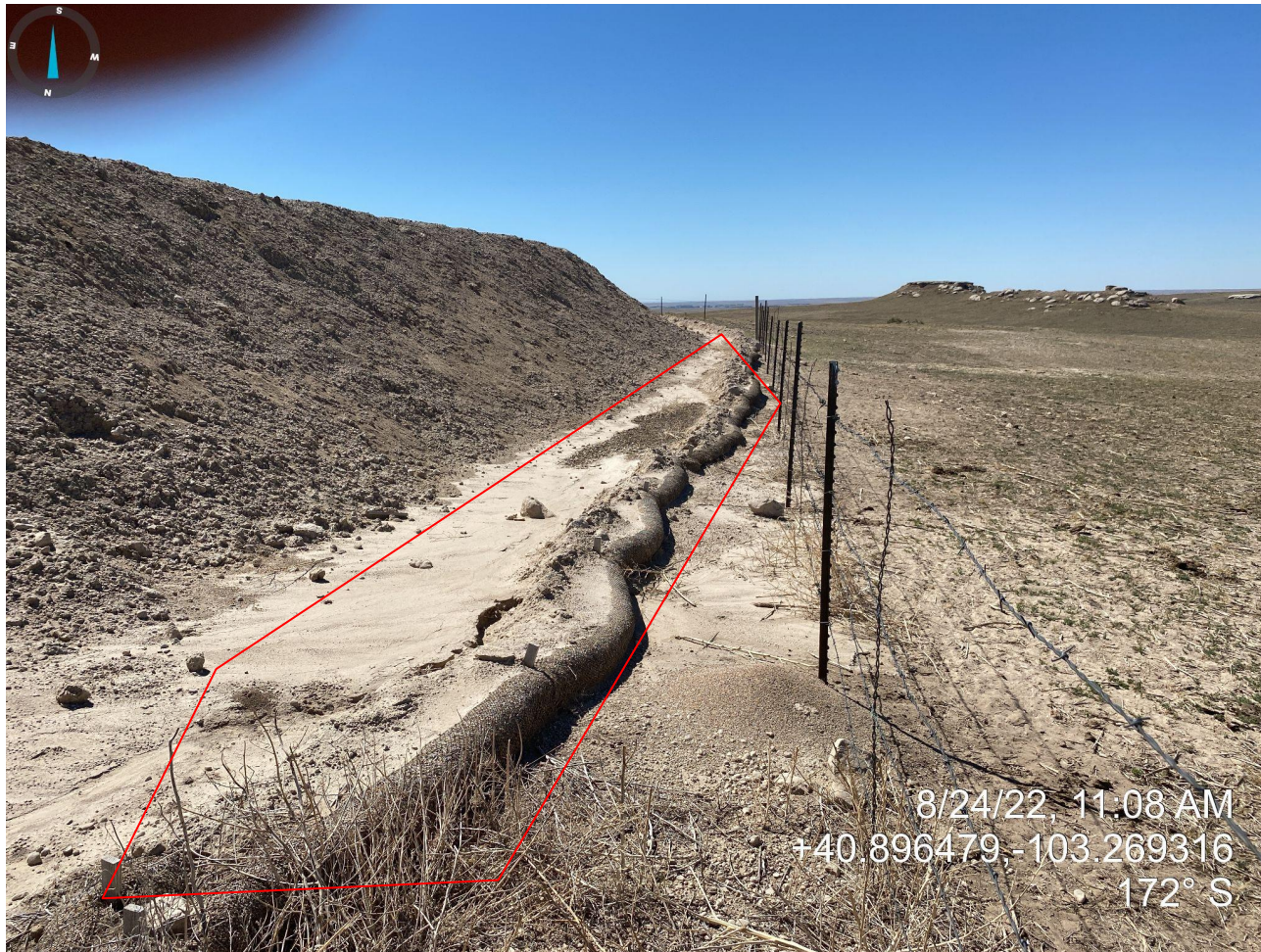
Photo 32. Pit photo taken from northwestern corner, facing south. See comments in photo 12.