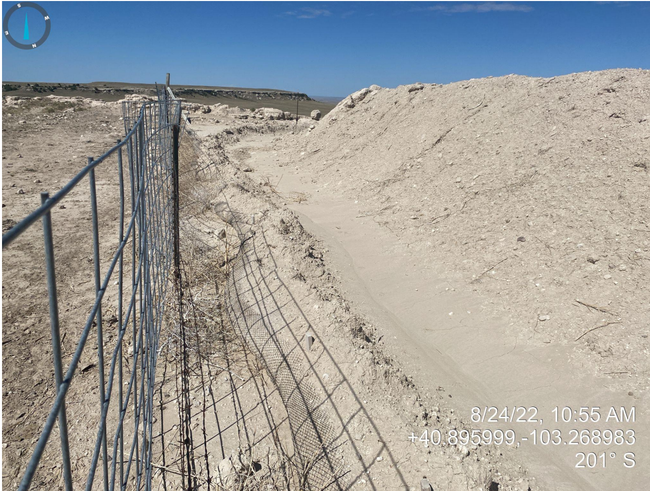
Photo 16. Photo taken from southern center portion of pit, facing west. Photo illustrates stormwater BMPs/straw wattles are buried with sediment and need maintenance/replacement to function properly and keep sediment from exiting location .