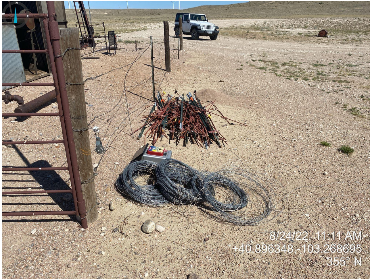
Photo 36. Photo taken near pump jack on southern portion of location, facing north. Photo illustrates fencing material left on site.