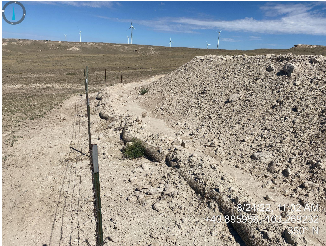
Photo 23. Photo taken from westernmost corner of pit, facing north. See comments in photo 12.