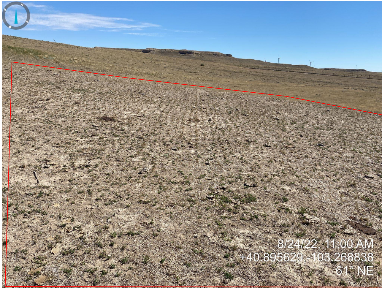
Photo 22. Photo taken from center portion of salt kill, facing northeast. Photo illustrates this portion of the salt kill area has failed to provide uniform vegetation cover resulting in bare soil and annual weedy vegetation, predominantly Kochia.