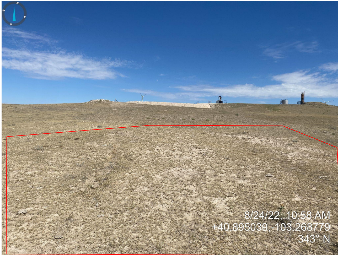
Photo 21. Photo taken from southernmost extent of salt kill, near exposed pipeline, facing north. Photo illustrates some desirable vegetation establishment (predominantly buffalo grass) in foreground, outlined in red.