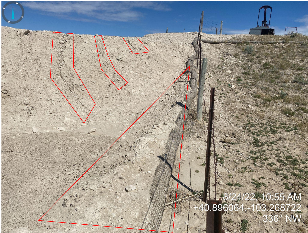
Photo 12. Photo taken east of pit and south of location, facing northwest. Photo illustrates straw wattles buried with sediment and are in need of maintenance/replacement to properly capture sediment laden stormwater from exiting location; pit walls show evidence of rill erosion. Both outlined in red.