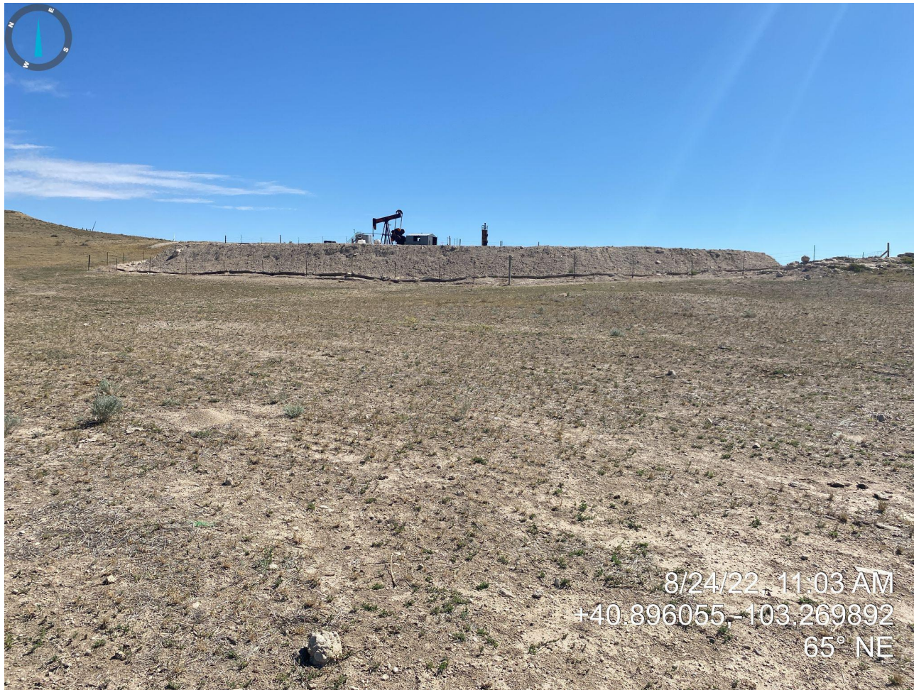
Photo 28. Photo taken from western edge of salt kill area, facing northeast towards location. See comments in photo 26.