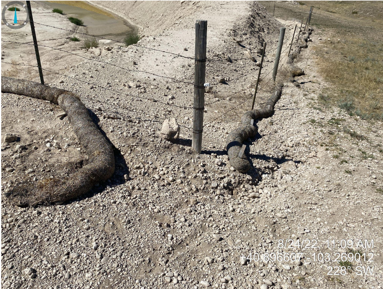
Photo 33. Pit photo taken from northern portion, facing southwest. See comments in photo 12.