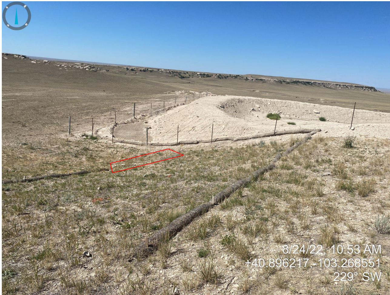
Photo 6. Location photo taken from southeastern portion, facing southwest. Photo illustrates slope is in process of revegetating and temporarily stabilized. Red outline illustrates missing straw wattle.