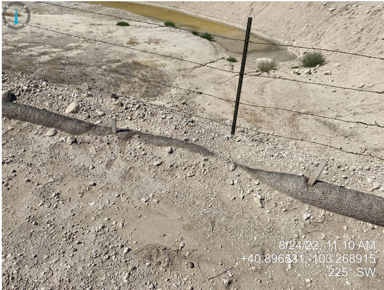
Photo 34. Pit photo taken from northeastern portion, facing southwest. See comments in photo 12.