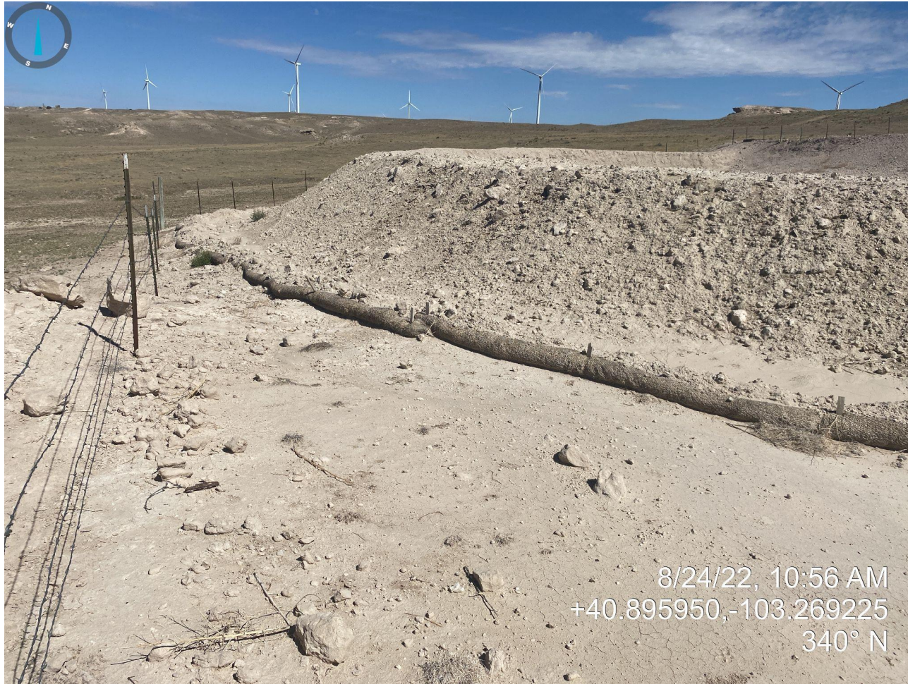
Photo 17. Photo taken from southwestern portion of pit, facing north. See comments in photo 16.