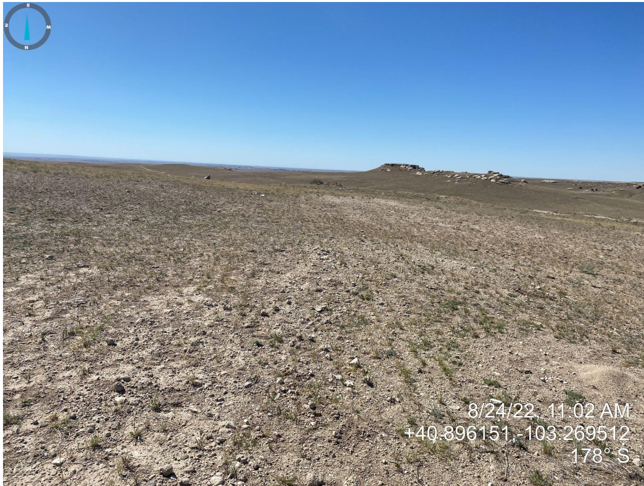
Photo 25. Salt Kill area photo taken west of location, facing south. Photo illustrates this portion of the salt kill area has failed to provide uniform vegetation cover resulting in bare soil.