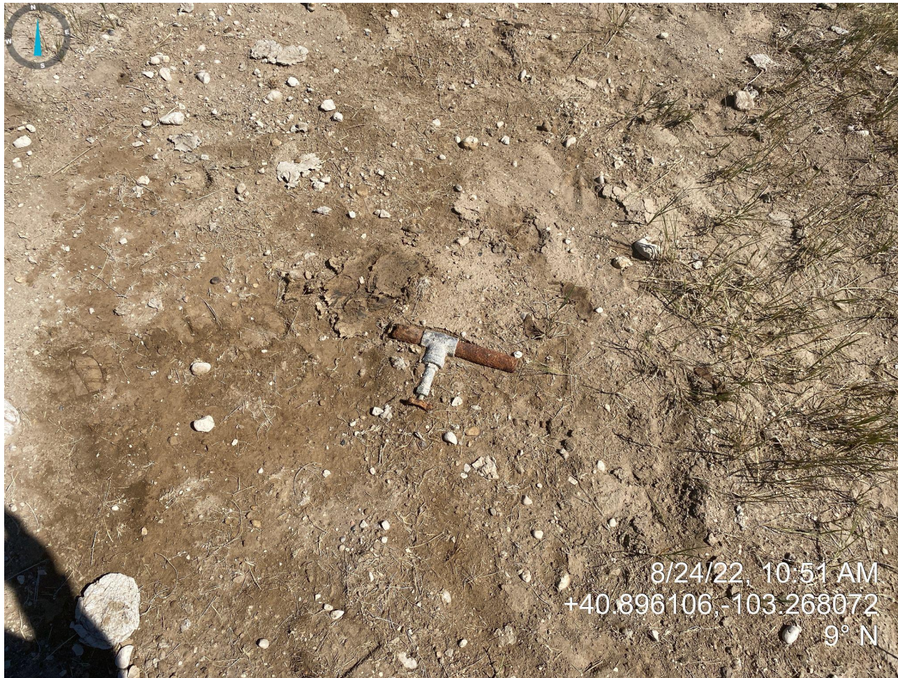
Photo 38. Photo illustrates debris left on location, near the eastern portion by the heater/separator.