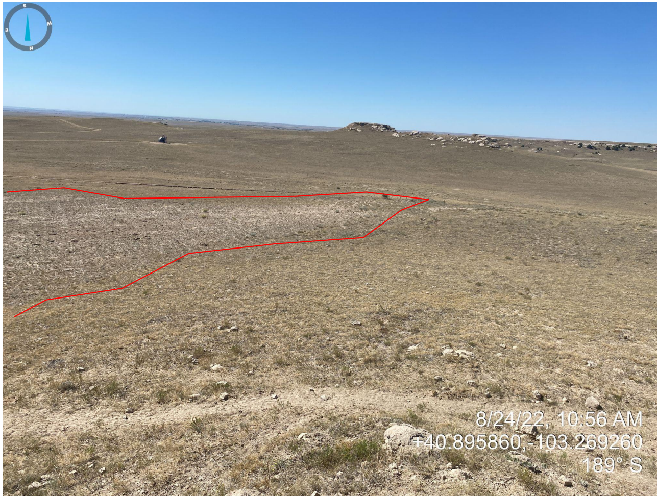
Photo 18. Photo taken of salt kill area from the southwest corner of the pit, facing south. Salt kill area outlined in red.