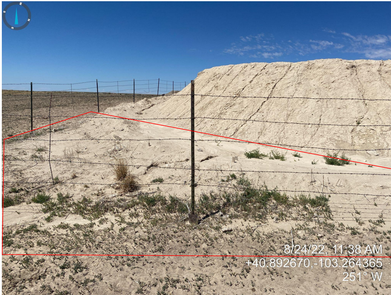
Photo 25. Pit photo taken from southeast corner of pit, facing west. Photo illustrates insufficient stormwater BMPs allowing sediment laden stormwater to exit off location (outlined in red).