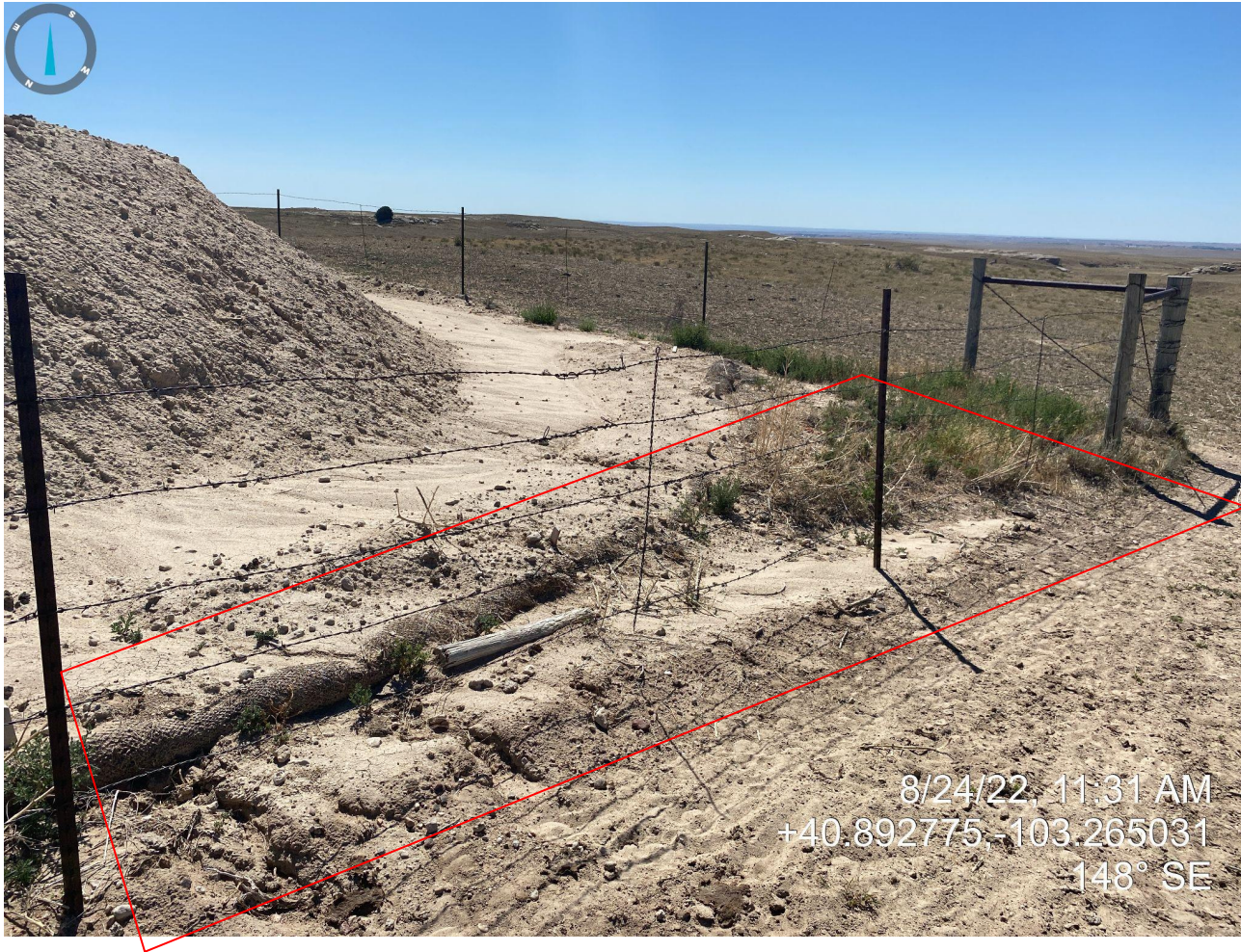
Photo 6. Pit photo taken from southwestern corner, facing southeast. Photo illustrates inadequate stormwater BMPs, straw wattles, that have not been properly maintained causing sediment laden stormwater to leave off location (outlined in red).