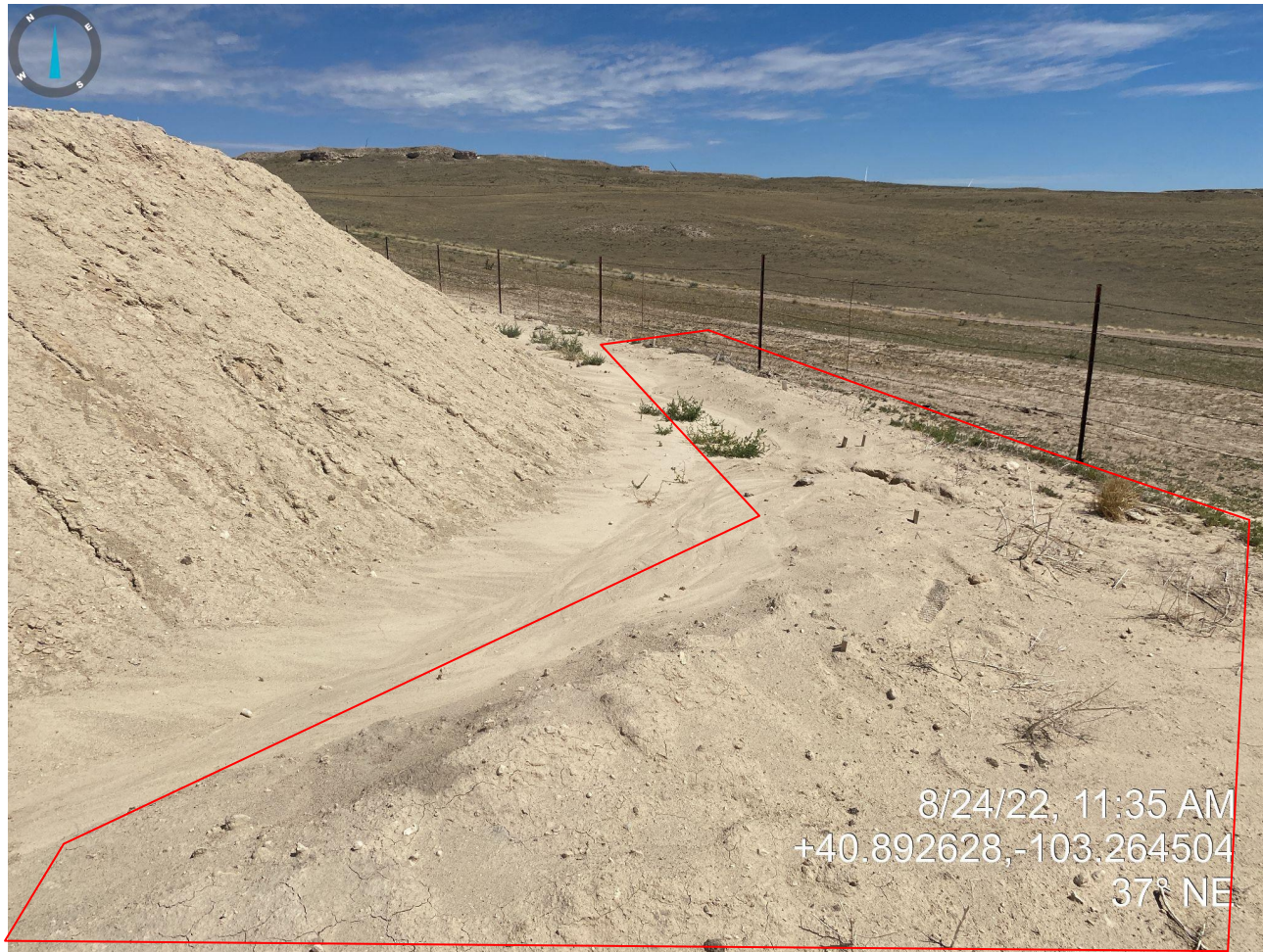
Photo 20. Pit photo taken from southeast corner, facing northeast. Photo illustrates insufficient stormwater BMPs allowing sediment laden stormwater to exit off location (outlined in red).