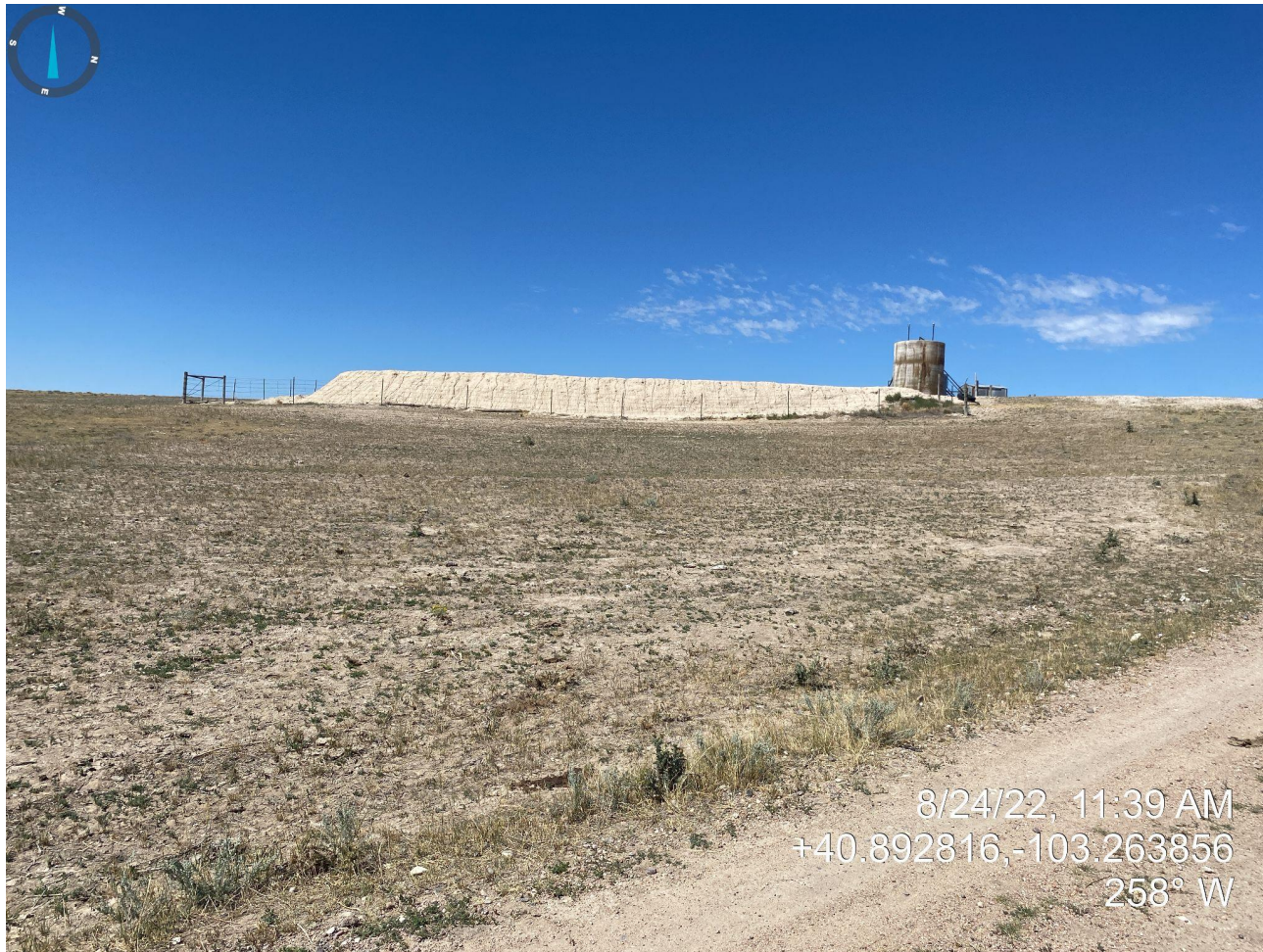
Photo 29. Salt kill area photo taken from access road, facing west. See comments in photo 27.