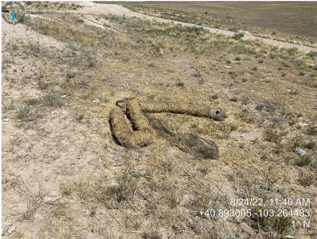
Photo 32. Photo taken northeast of pit corner, facing north. It appears the straw wattles were not installed according to good engineering practices and has moved off location. The wattle is considered debris and needs to be disposed of accordingly.