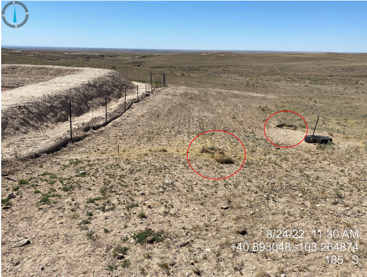
Photo 2. Plt photo taken from northwestern corner, facing south. Photo illustrates non-uniform vegetation cover resulting in bare soil and straw wattle (outlined in red) not properly installed and displaced within affected area; this is now considered debris and needs to be disposed of accordingly.