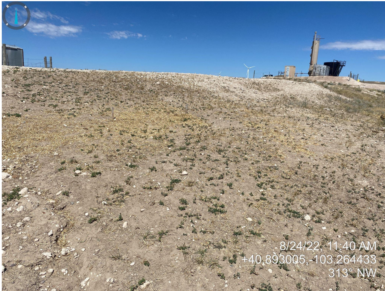
Photo 31. Location photo taken from northeast corner of pit, facing northwest. Photo illustrates slopes have not been stabilized and do not have temporary stormwater BMPs in place. Additionally, it was observed that the slopes do not have uniform vegetation cover resulting in bare soil.