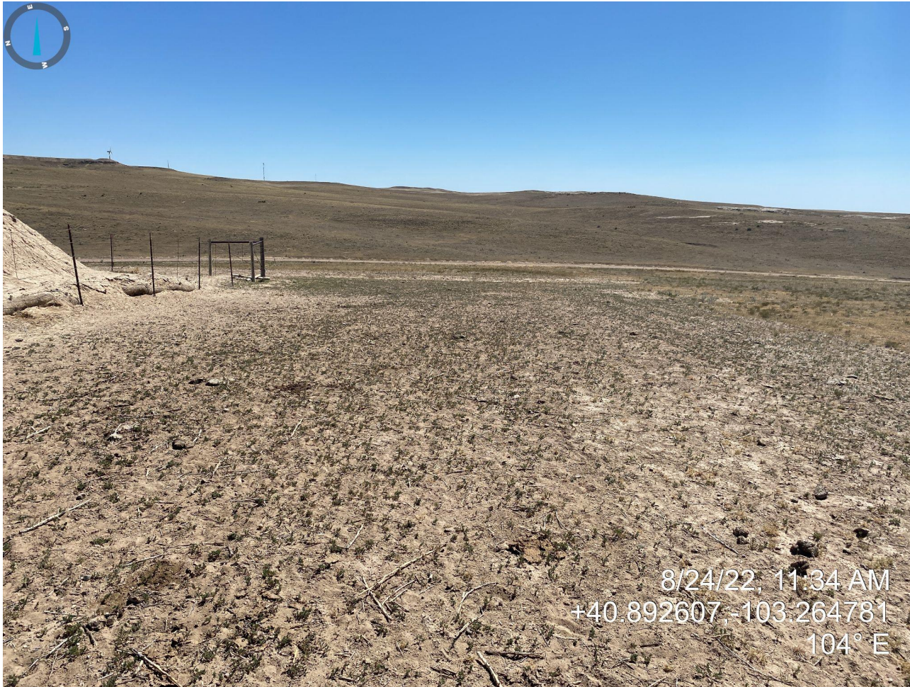
Photo 17. Salt kill area photo taken from southern edge of pit, facing east. Photo illustrates non-uniform vegetation cover resulting in bare soil; additionally, this portion of the reclaimed area is predominantly Kochia.