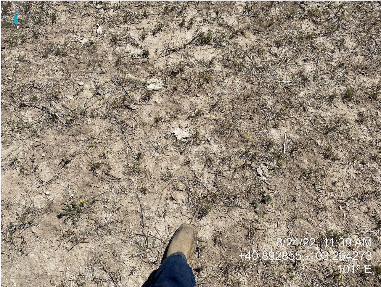
Photo 28. Close up of salt kill area. See comments in photo 27.