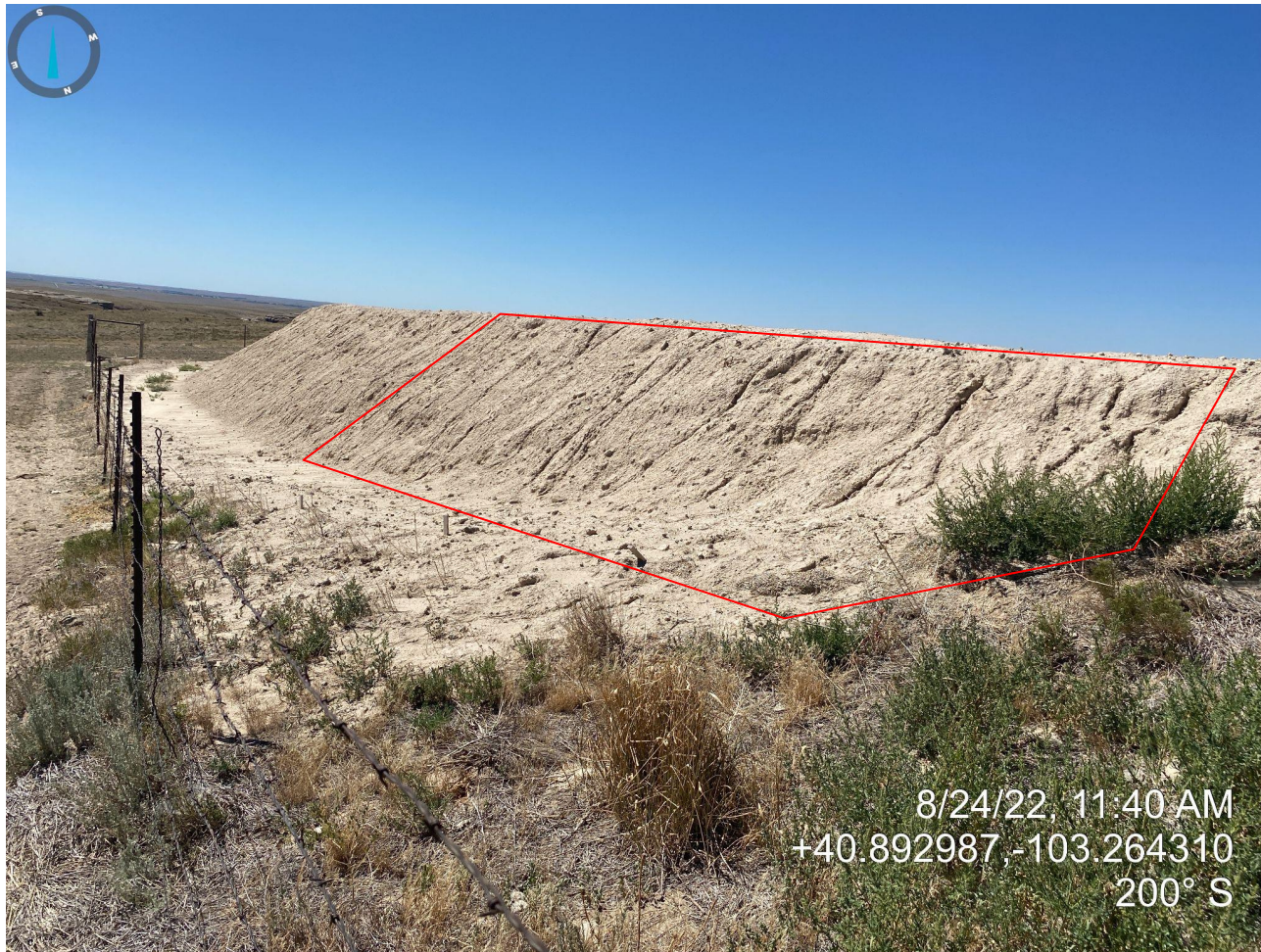
Photo 30. Pit photo taken from northeast corner, facing south. Photo illustrates absence of stormwater BMPs around portions of the pit, resulting in sediment laden stormwater exiting off location. Additionally, it was observed that the pit walls are experiencing rill erosion (outlined in red).