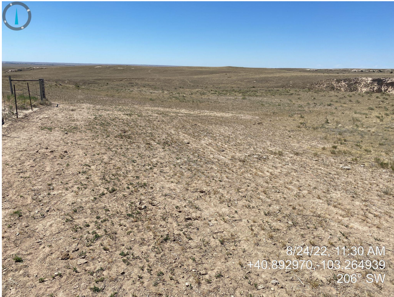
Photo 5. Salt Kill area photo taken from western edge of pit, facing southwest. Photo illustrates non-uniform vegetation cover resulting in bare soil and presence of annual weedy vegetation (e.g. predominantly Kochia).