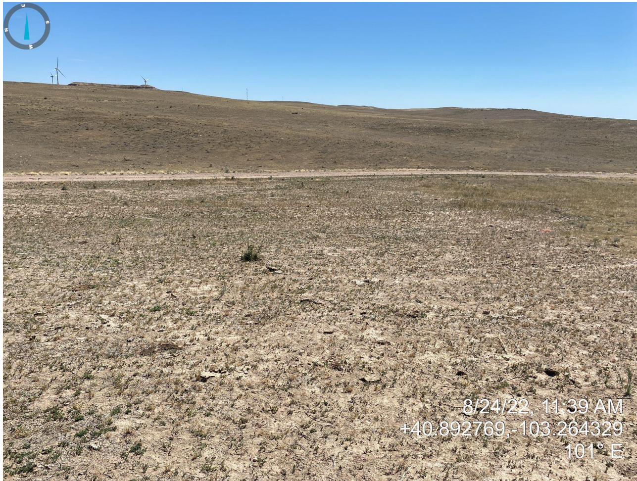
Photo 27. Salt kill area photo taken from center/eastern edge of pit, facing east. Photo illustrates reclaimed area has non-uniform vegetation cover resulting in bare soil and annual weedy vegetation, predominantly kochia.