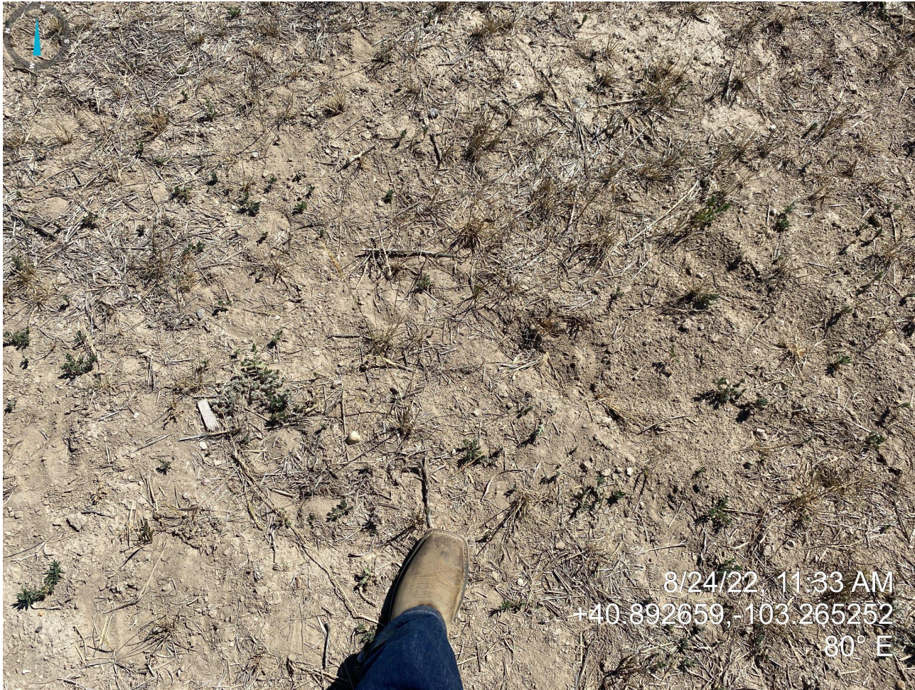
Photo 12. Close up photo of salt kill area germination. Non-uniform vegetation cover resulting in bare soil and undesirable vegetation present (e.g. kochia).