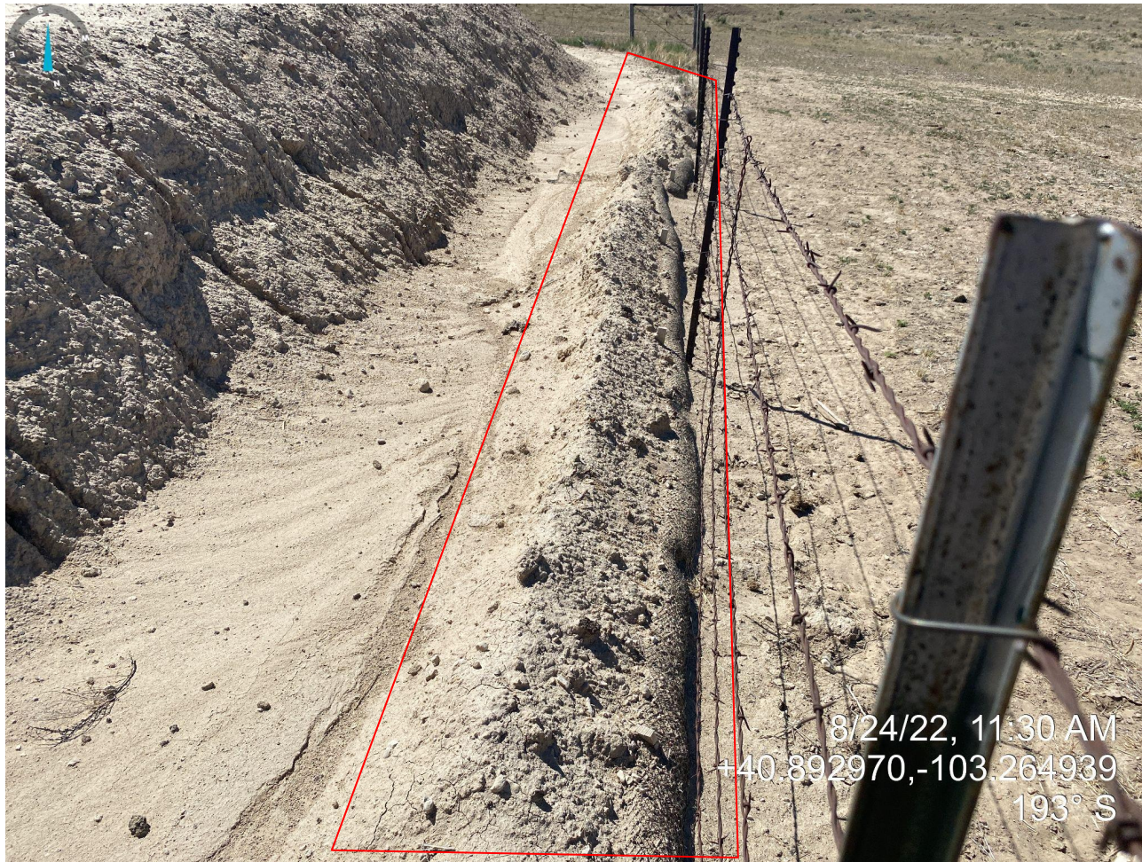
Photo 3. Pit photo taken from western portion, facing south. Photo illustrates straw wattles buried with sediment and are in need of maintenance/replacement to properly capture sediment laden stormwater from exiting location (outlined in red).