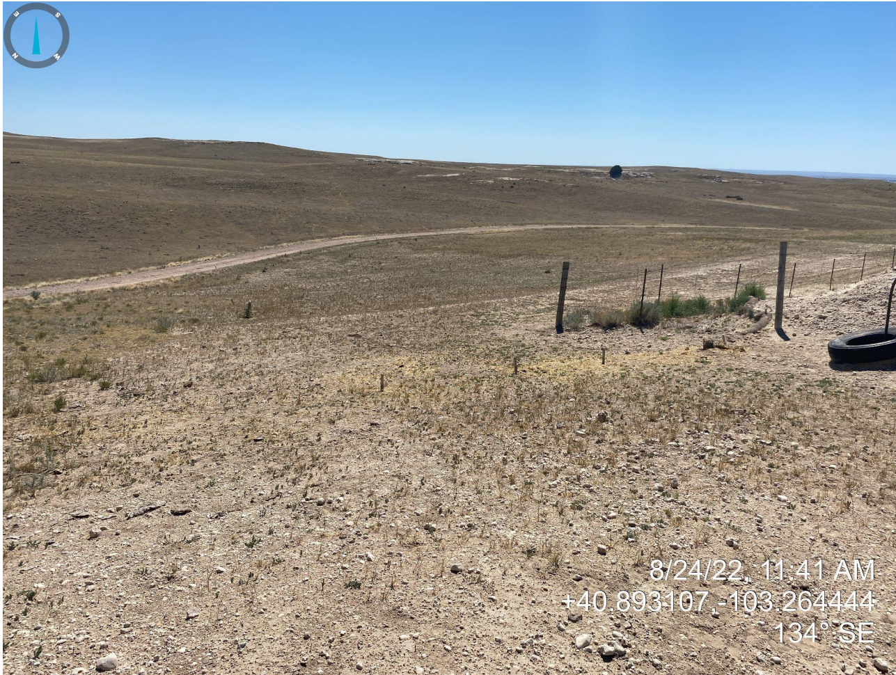
Photo 33. Photo taken from northeast corner of pit, facing southeast. See comments in photo 31.