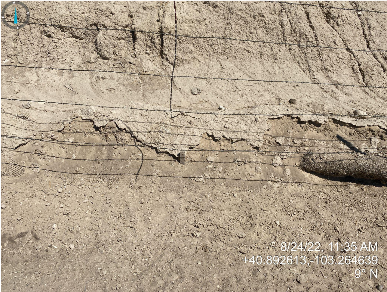
Photo 19. Close up photo illustrates missing straw wattle.