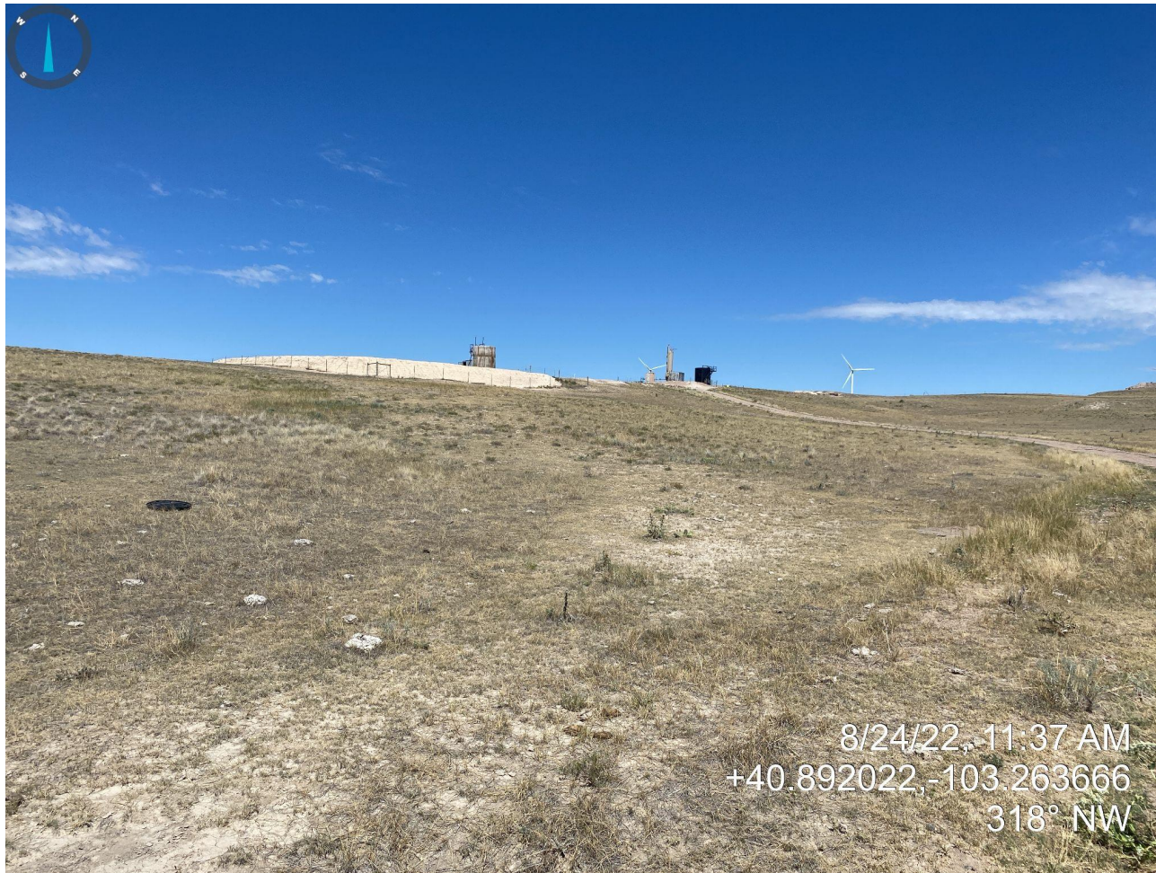
Photo 23. Salt kill area photo taken from access southeast of location, facing northwest. Photo illustrates portions of the reclaimed area have some desirable vegetation and are temporarily stabilized.