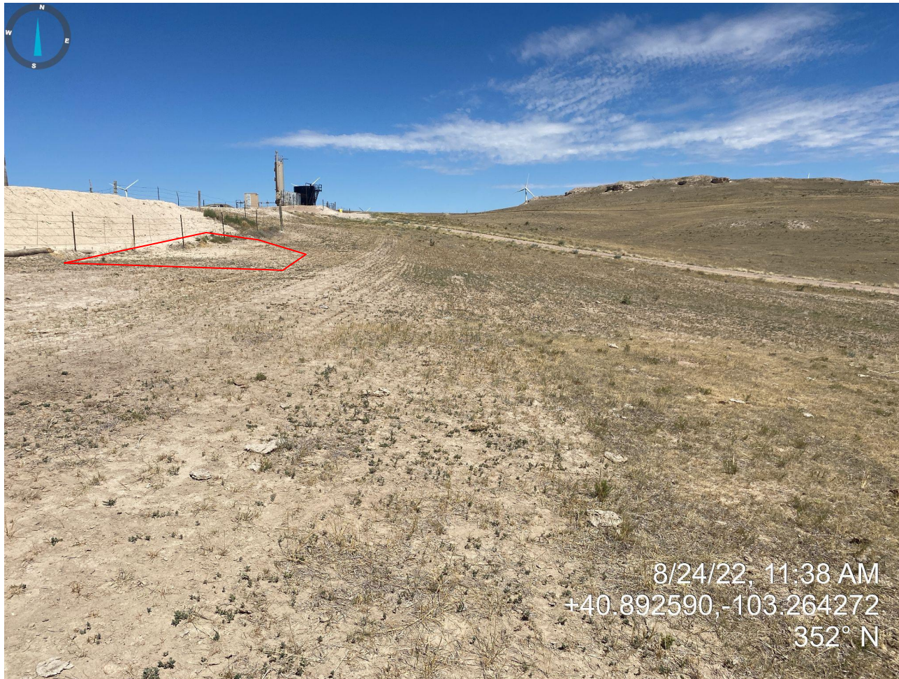
Photo 24. Salt kill area photo taken from southeastern corner of pit, facing north. Photo illustrates offsite sediment transportation (outlined in red), and non-uniform vegetation cover resulting in bare soil. Vegetation is predominantly kochia.