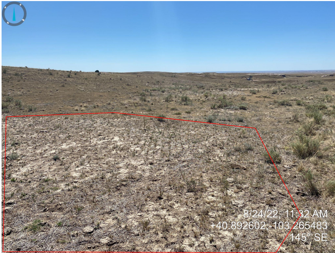
Photo 9. Salt Kill area photo taken from southwestern portion, facing southeast. Photo illustrates desirable revegetation observed within salt kill area.