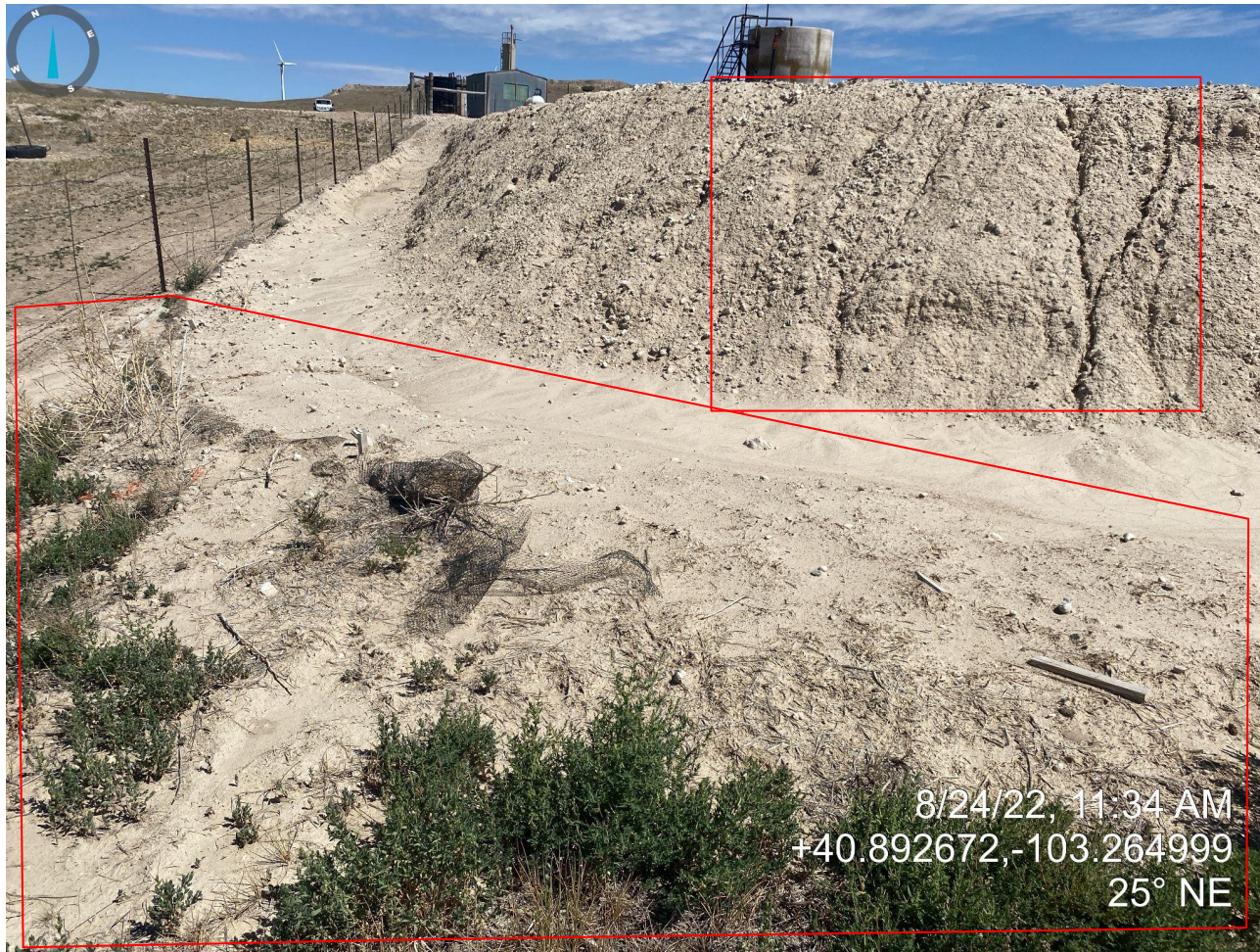
Photo 14. Pit photo taken from southwestern portion, facing northeast. Photo illustrates inadequate stormwater BMPs allowing sediment laden stormwater to exit off location and rill erosion on pit walls (outlined in red).