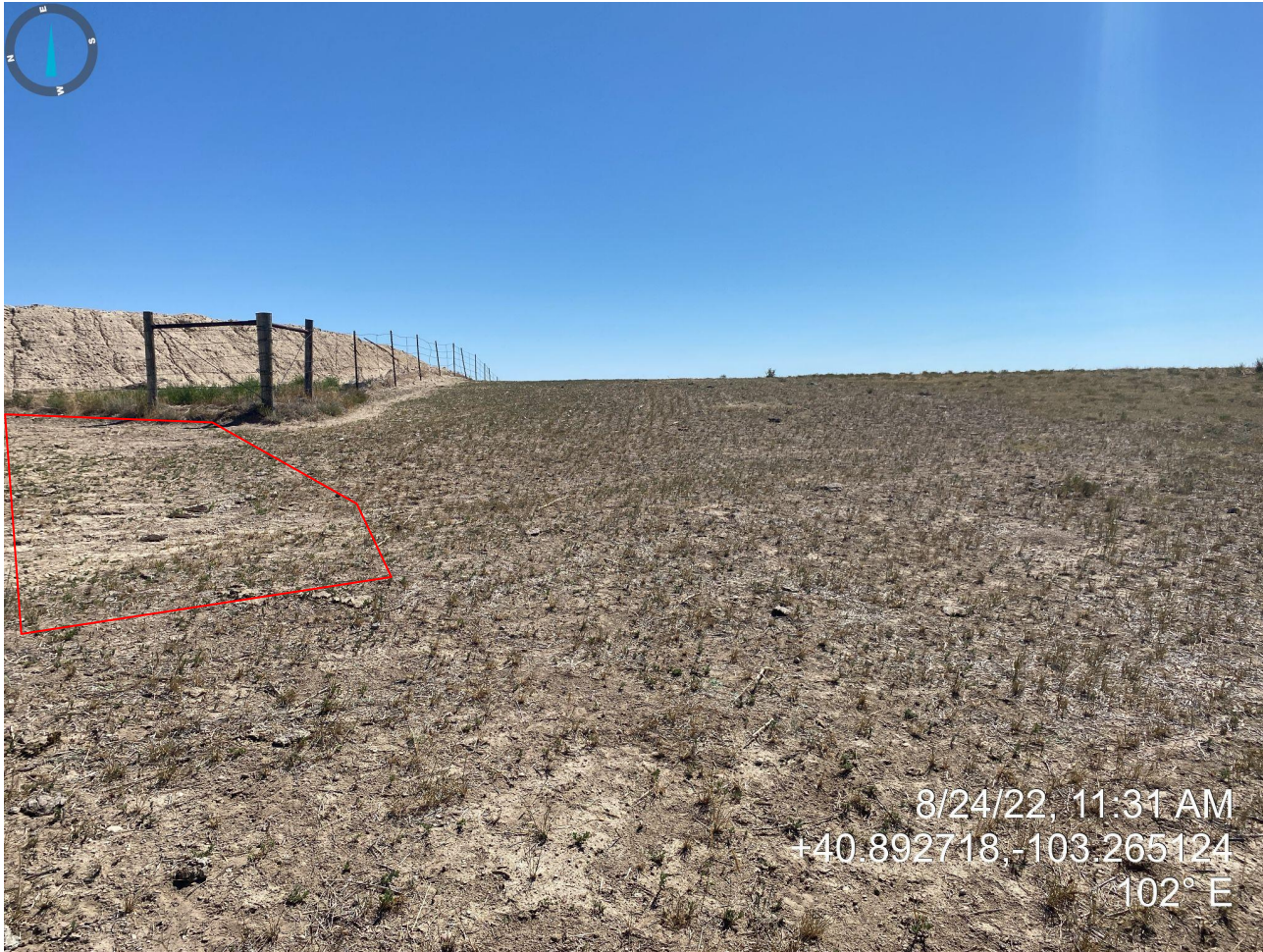
Photo 8. Salt Kill area photo taken from southwestern corner of pit, facing east. Photo illustrates some desirable germination present (e.g. buffalo grass, wheatgrass) and evidence of sediment laden stormwater exiting location (outlined in red).