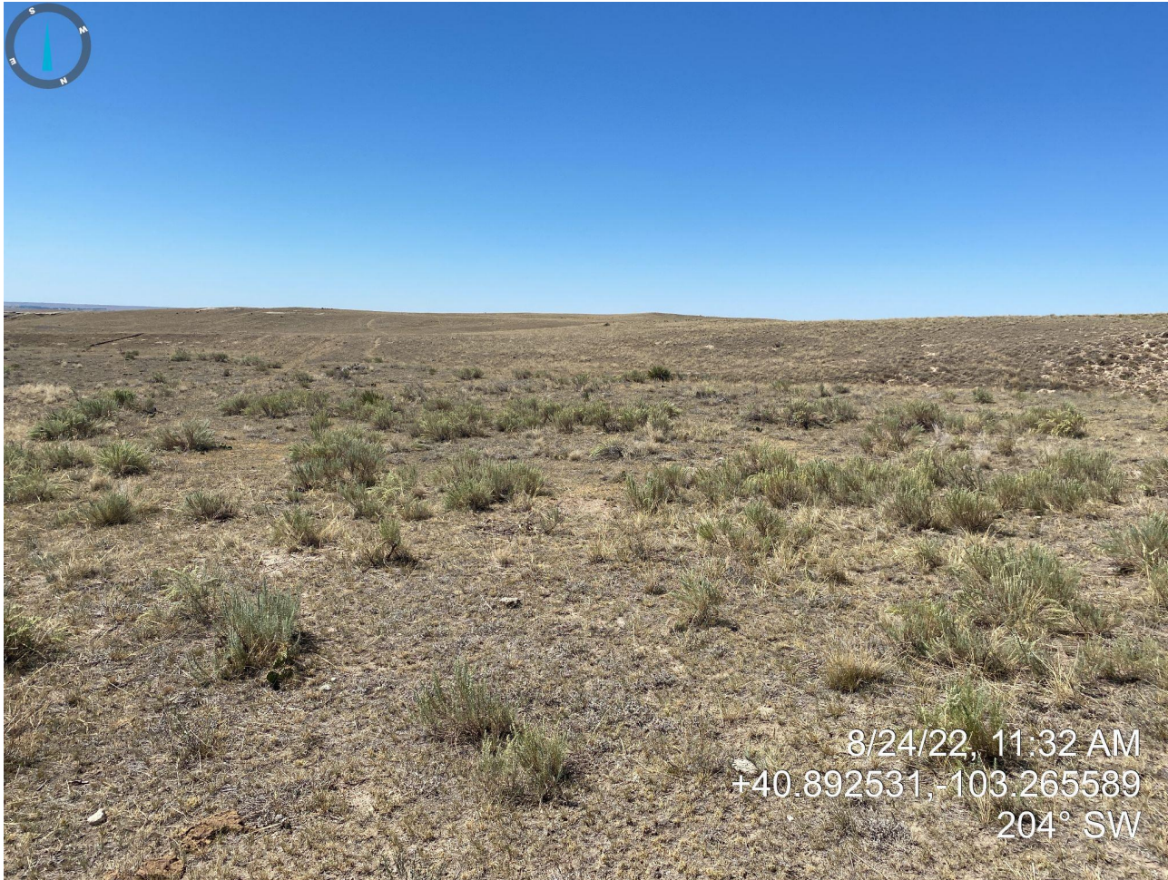
Photo 13. Reference area photo taken west of salt kill extent, facing southwest.