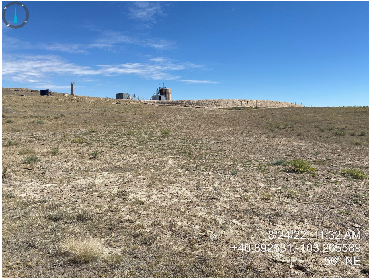
Photo 10. Salt Kill area photo taken from southwestern portion, facing northeast. Photo illustrates non-uniform vegetation cover resulting in bare soil.