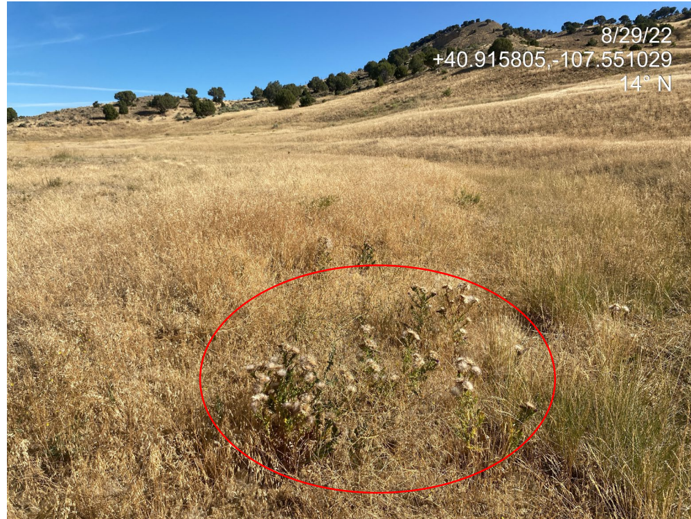
Photo 6. Photo taken from the southern edge of the working pad area. Photo shows the Location has not been recontoured; the flat pad and cut slopes are evident. Photo also shows bull thistle, a List B Noxious Weed (red circle) and a monoculture of cheatgrass, on the working pad and cut slopes.