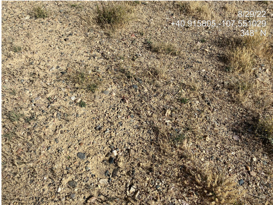
Photo 3. Photo taken from the south of the Location shows the pad has not been reclaimed. The pad surface is flat, compacted and graveled.