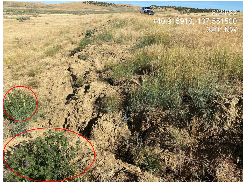
Photo 8. Photo taken from the southwest of the working pad shows gully erosion. Photo also shows multiple bull thistle plants (red circles).