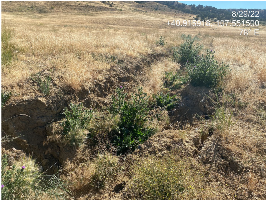
Photo 7. Photo taken from the southwest of the working pad shows gully erosion with an active headcut and unstable sides. Photo also shows multiple bull thistle plants (dark green vegetation) and a monoculture of cheatgrass (tan vegetation).