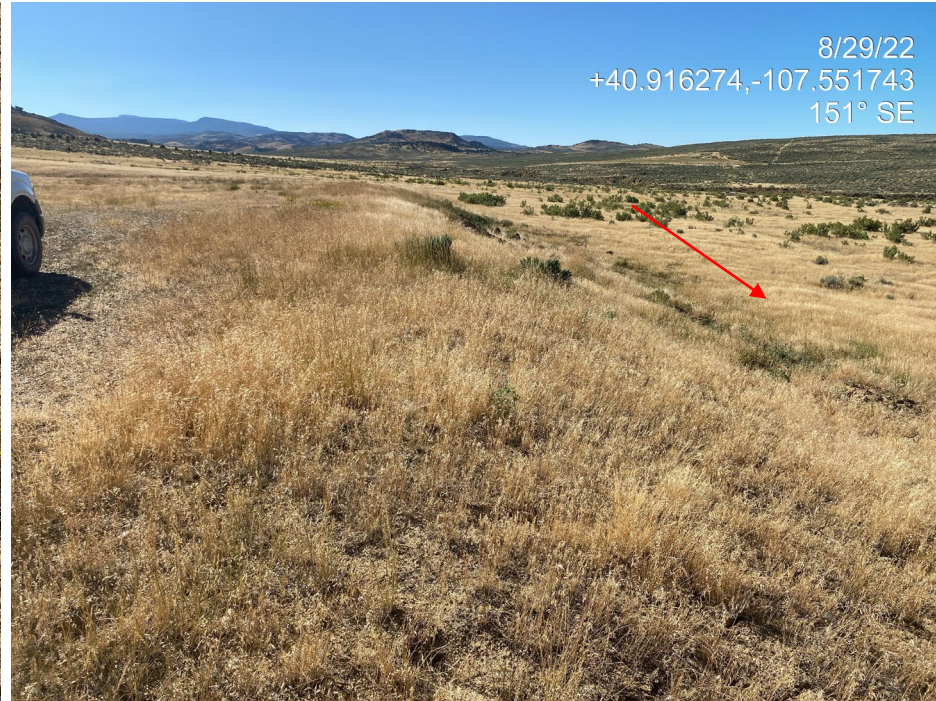
Photo 4. Photo taken from the west shows the fill slope remains. The Location has not been recontoured/regraded to match the surrounding landscape. Also note areas adjacent to the working pad/areas previously disturbed during pad construction have not been properly reclaimed and are a monoculture of cheatgrass.