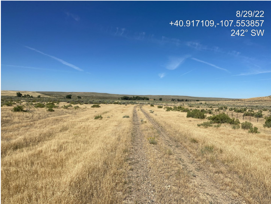
Photo 1. Photo taken from the northwest of the Location shows the access road. The road has not been reclaimed.