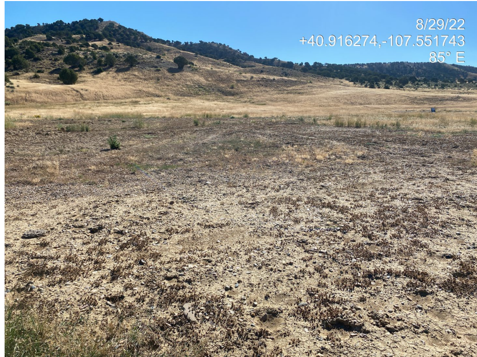
Photo 2. Photo taken from the north shows an overview of the Location. The Location has not been reclaimed.