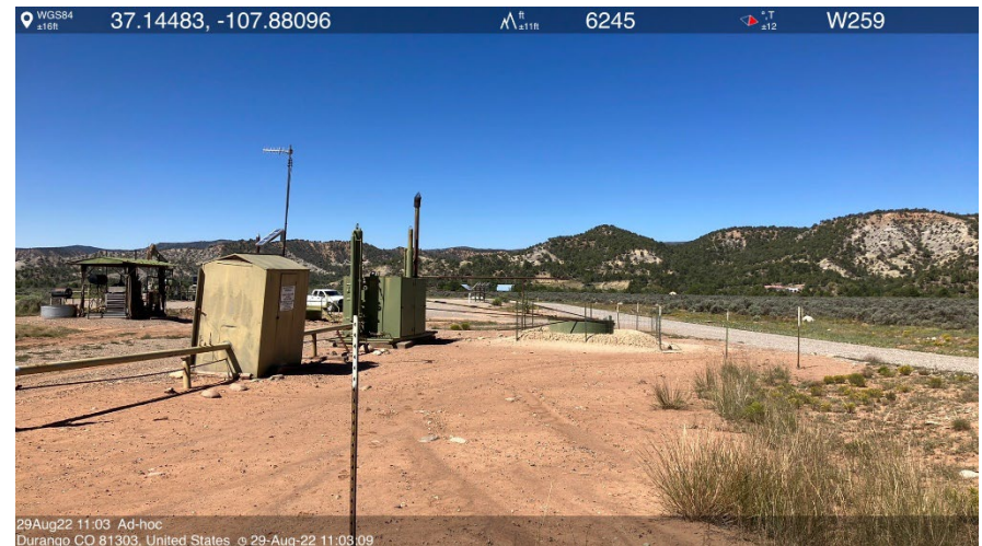
IMG 02 Location overview