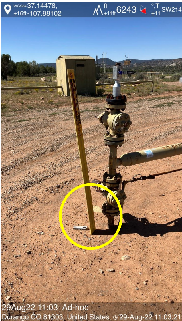
IMG 03 Debris