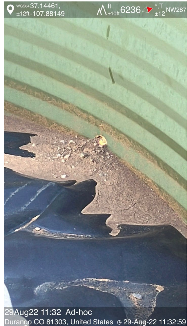
IMG 04 Secondary containment