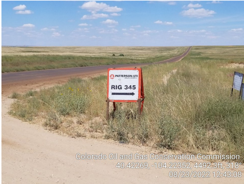
Photo 1 – Rig Sign at the Lease Road Entrance off of Main County Road 89