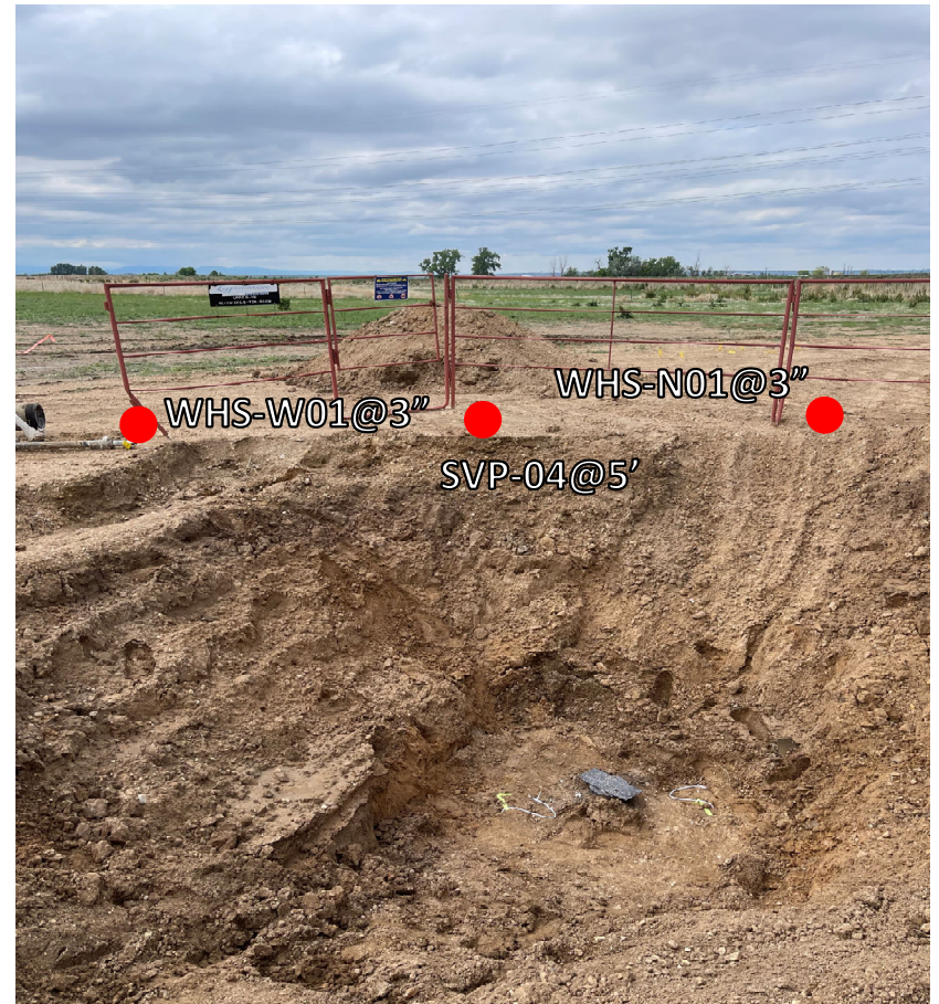
Wellhead surface sample locations looking northwest.