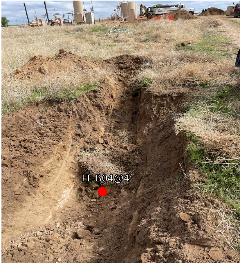
Flowline soil screening location looking south.