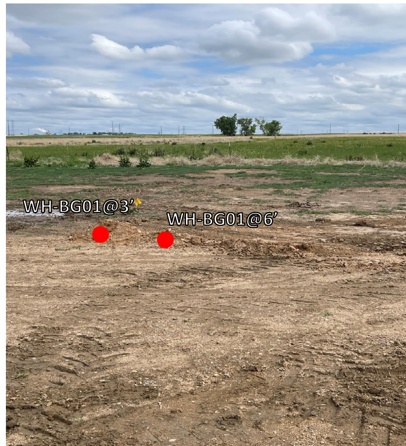
Wellhead background sample location looking north.