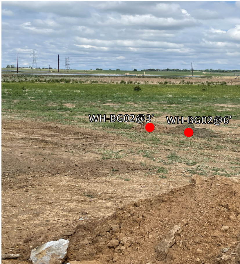
Wellhead background sample location looking southeast