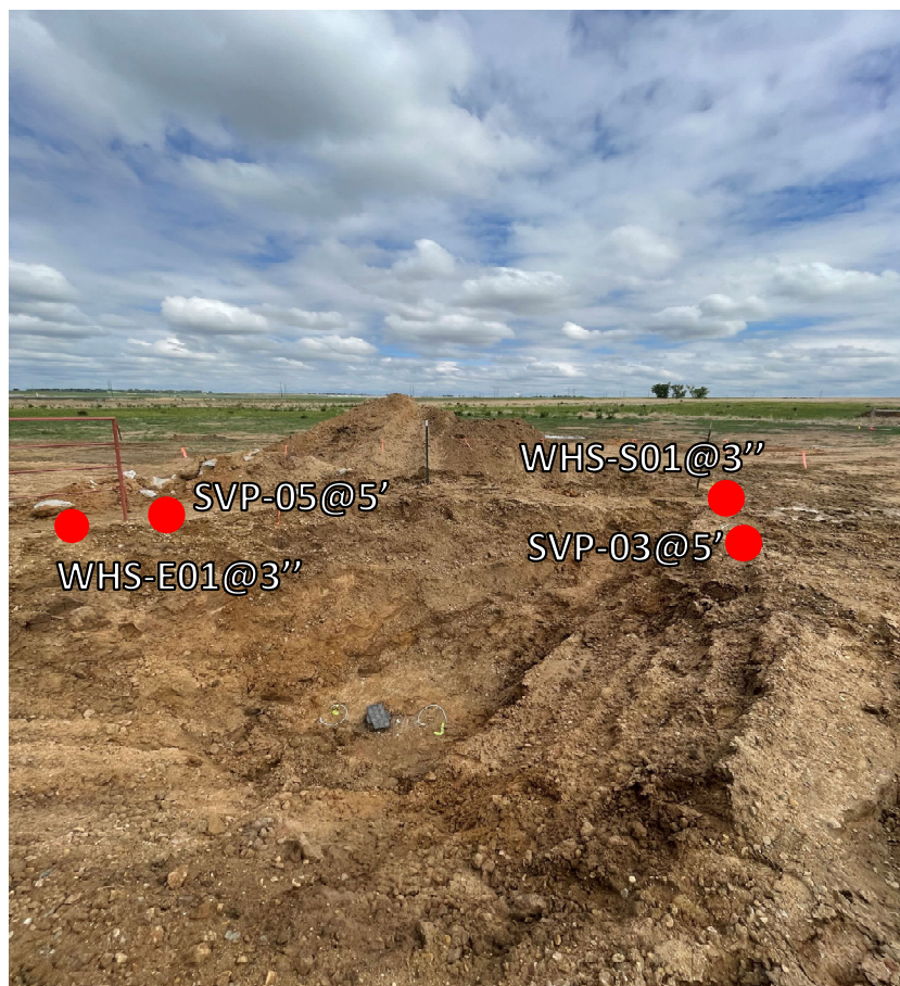
Wellhead surface sample locations looking southeast. SVP = soil vapor point