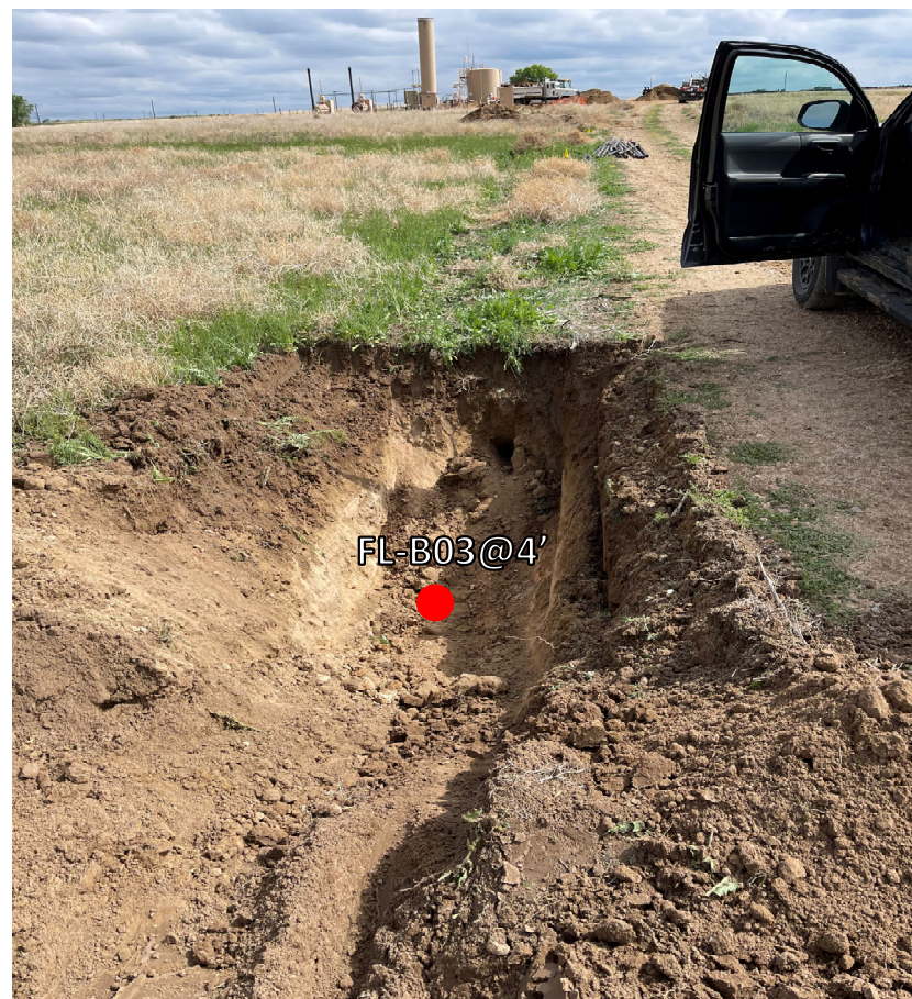
Flowline soil screening location looking south.