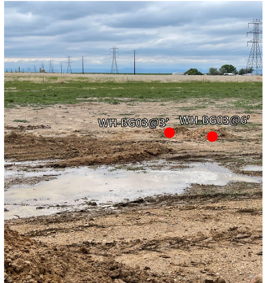
Wellhead background sample location looking northwest.