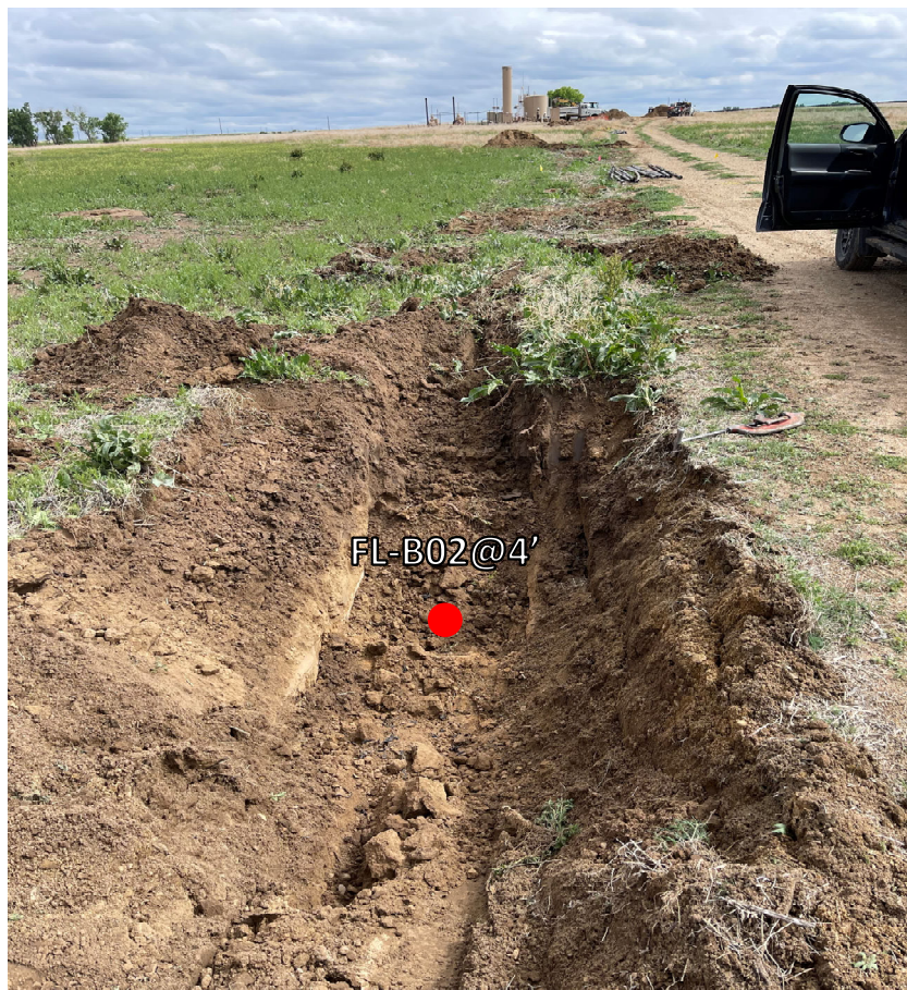
Flowline soil screening location looking south.