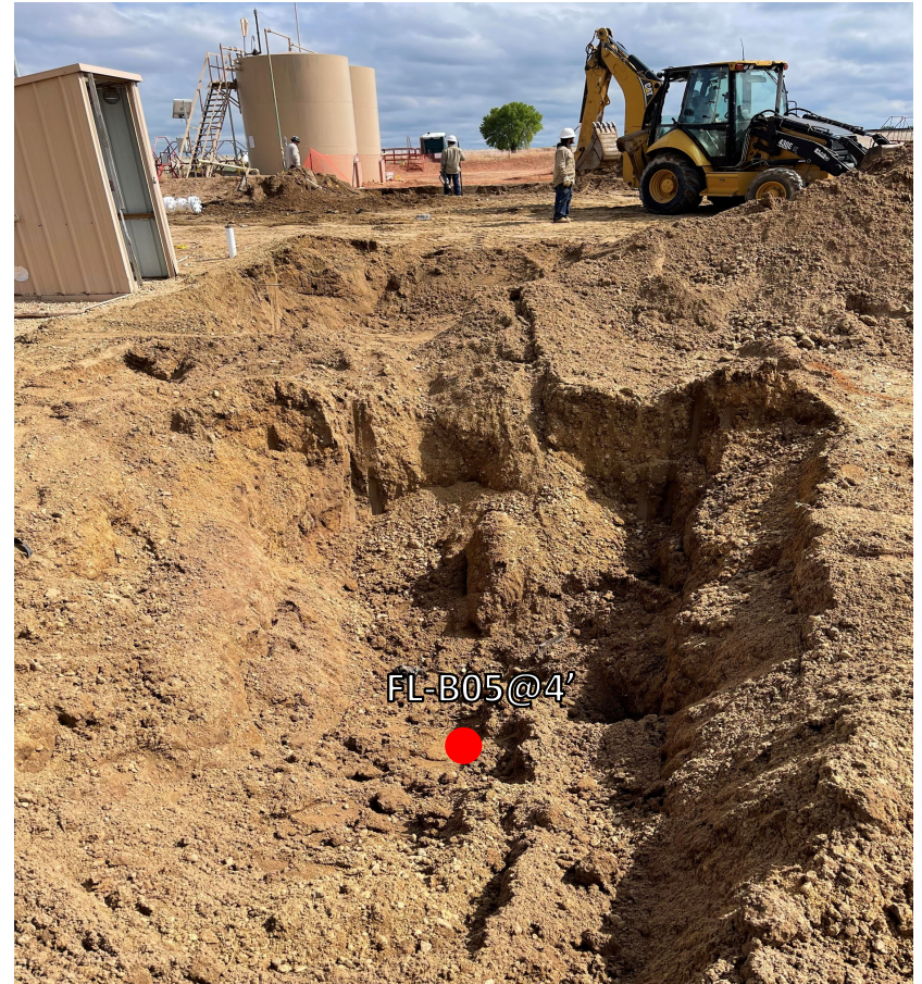
Flowline soil sampling location looking south.