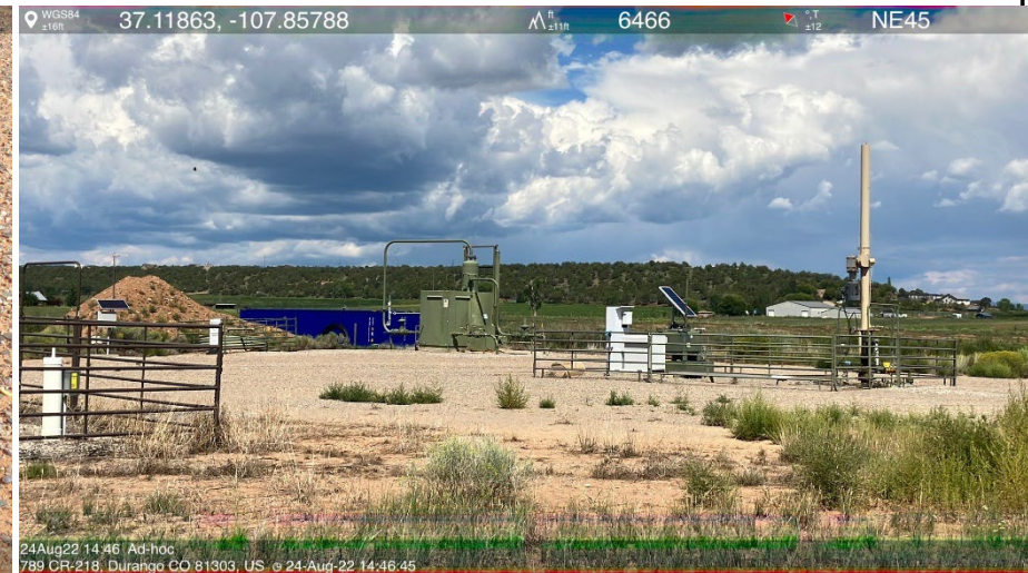
IMG 02 Location overview