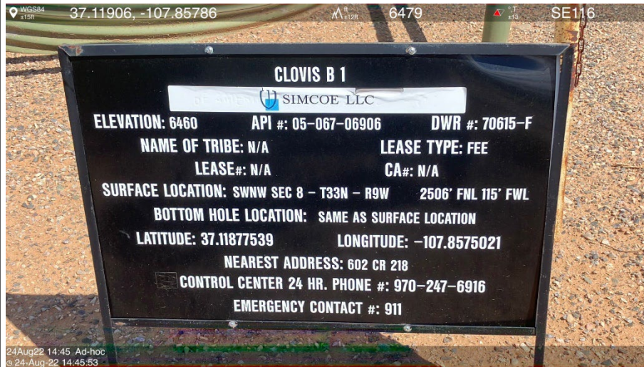
IMG 01 Well sign