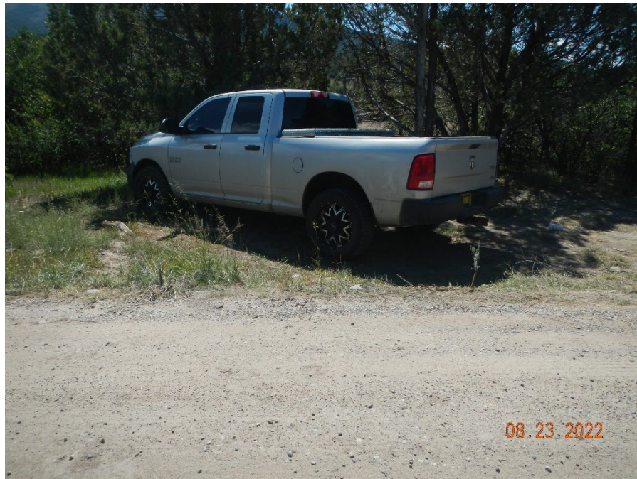
IMG 07 Vehicle parked off road