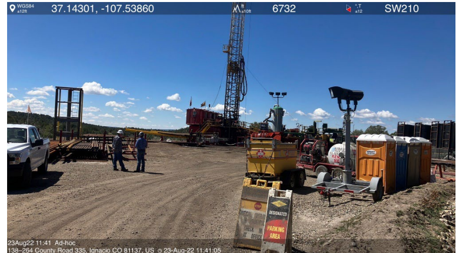
IMG 02 Location overview