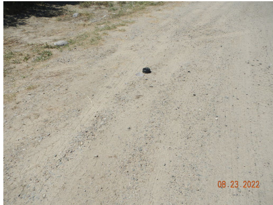
IMG 08 Trash on access road