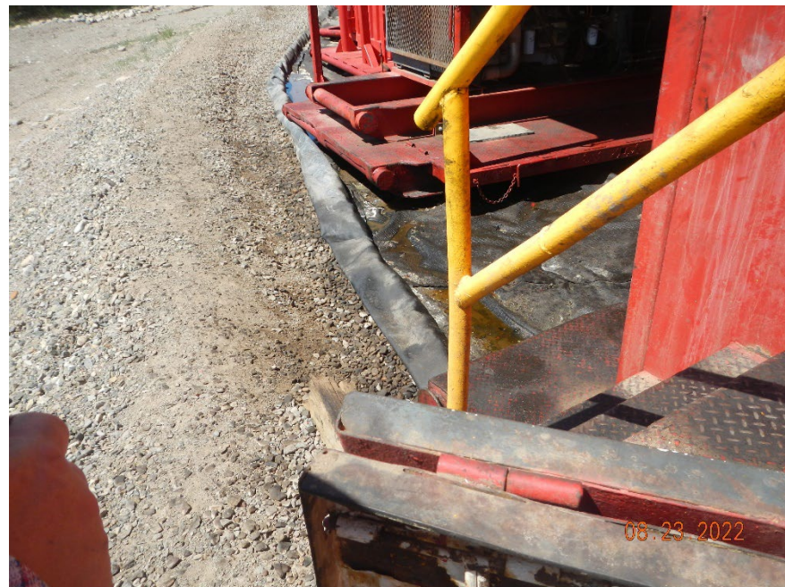
IMG 06 Material handling