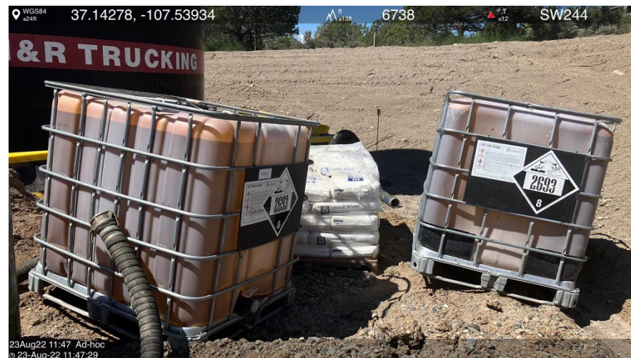
IMG 04 Chemical storage