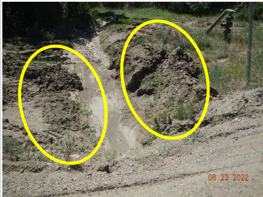
IMG 09 Sediment stockpiled