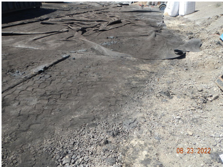
IMG 05 Material handling