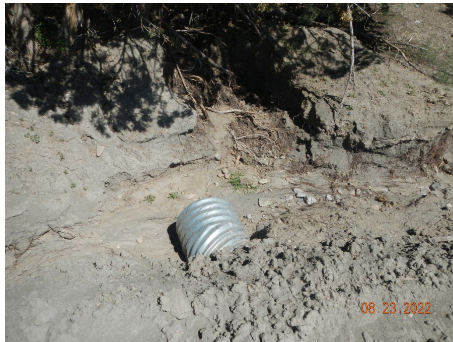
IMG 10 Culvert inlet