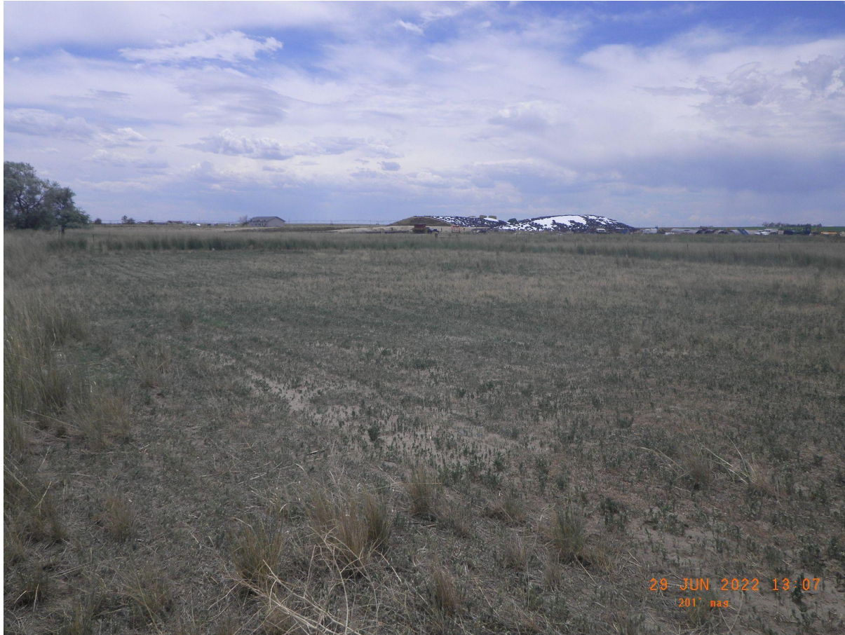
Photo 3. Overview photo of the tank battery taken at ground level from the eastern edge looking southwest. Note: tank battery is scheduled for 2022 maintenance. Tank battery will remain with a no status until it can be re-inspected in 2023.