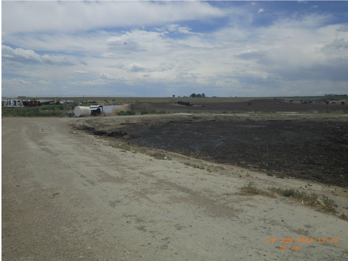
Photo 2. Overview photo of the well pad taken at ground level from the eastern edge looking west.