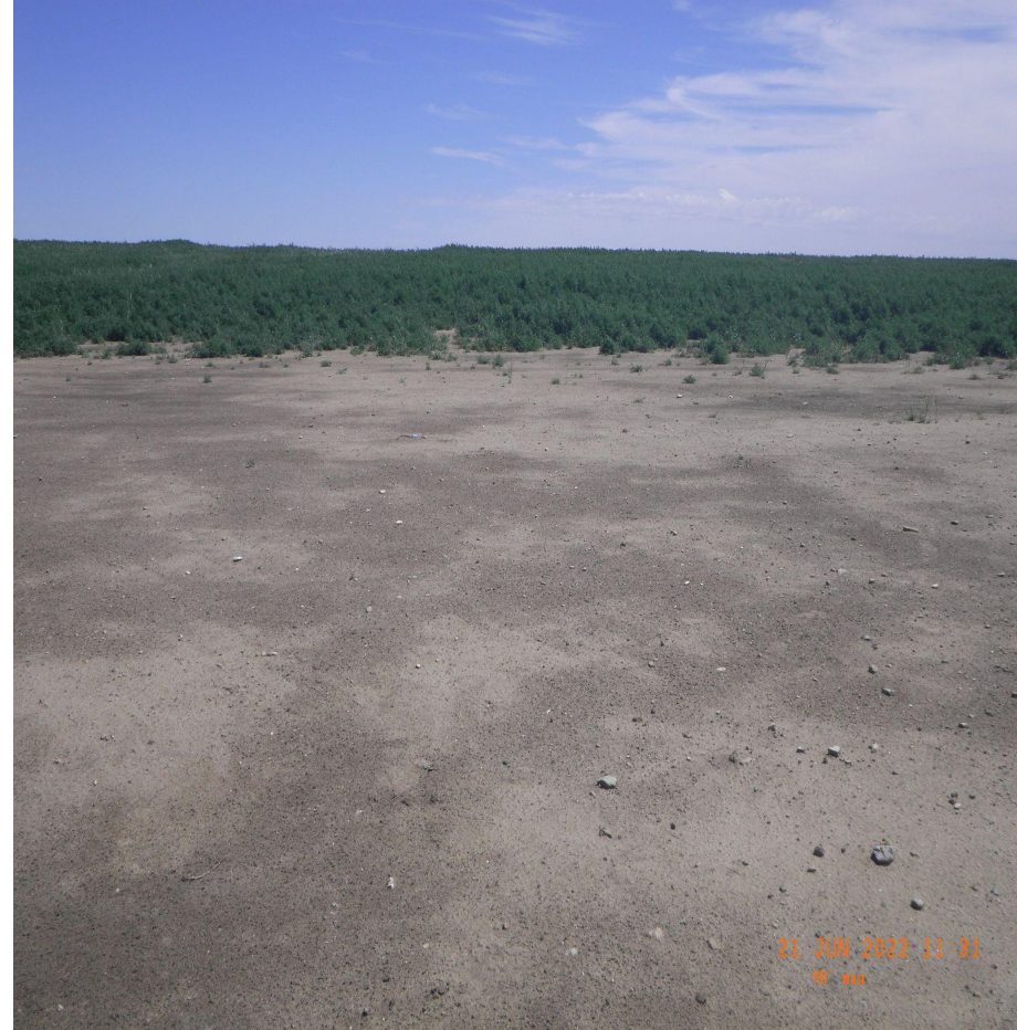
Photo 3. Cardinal photos taken from the middle of the well pad. Left photo facing north, right facing east.