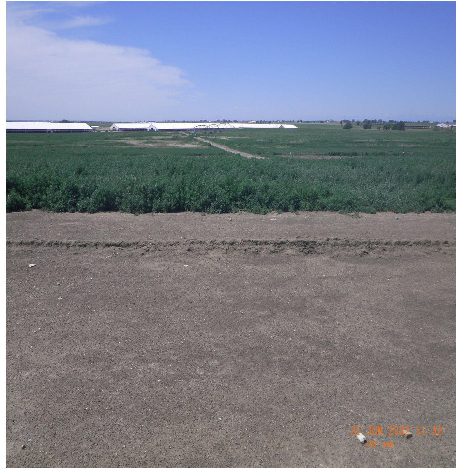
Photo 4. Cardinal photos taken from the middle of the tank battery. Left photo facing south, right photo facing west.