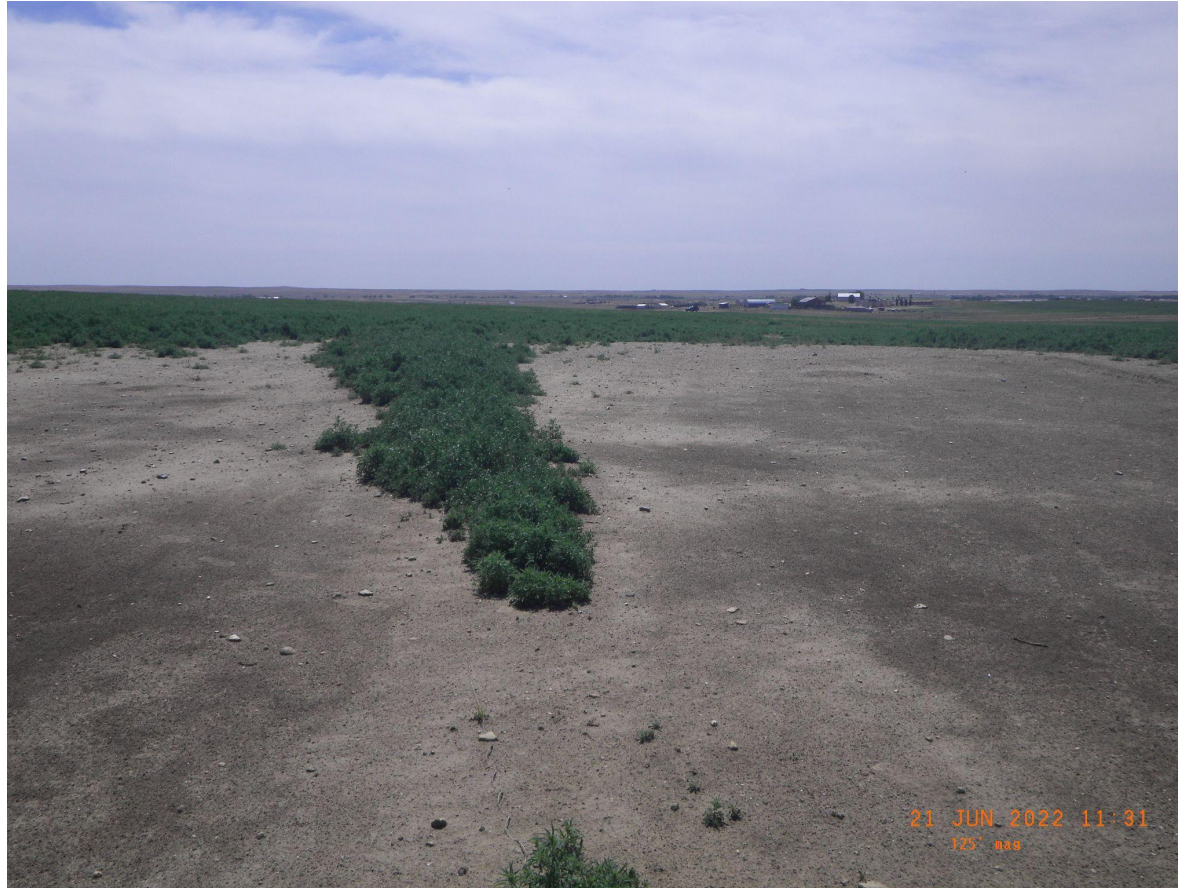
Photo 2. Overview photo of the well pad taken at ground level from the western edge looking east. Note: entire field is dominated by Kochia, site will remain in process until field has had crop planted.