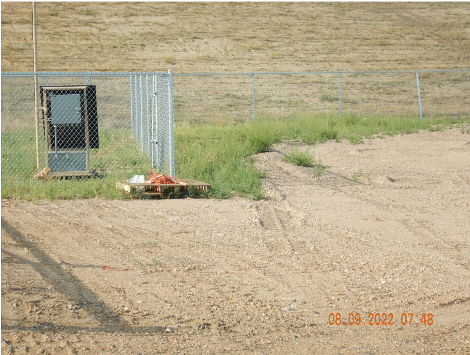
Photo 13. Photo taken from the entrance of location, facing South. Photo illustrates debris/trash.