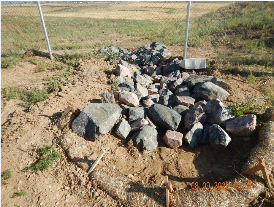
Photo 9. Photo taken from the northeastern well pad, facing North. Operator has installed a stabilized riprap channel.