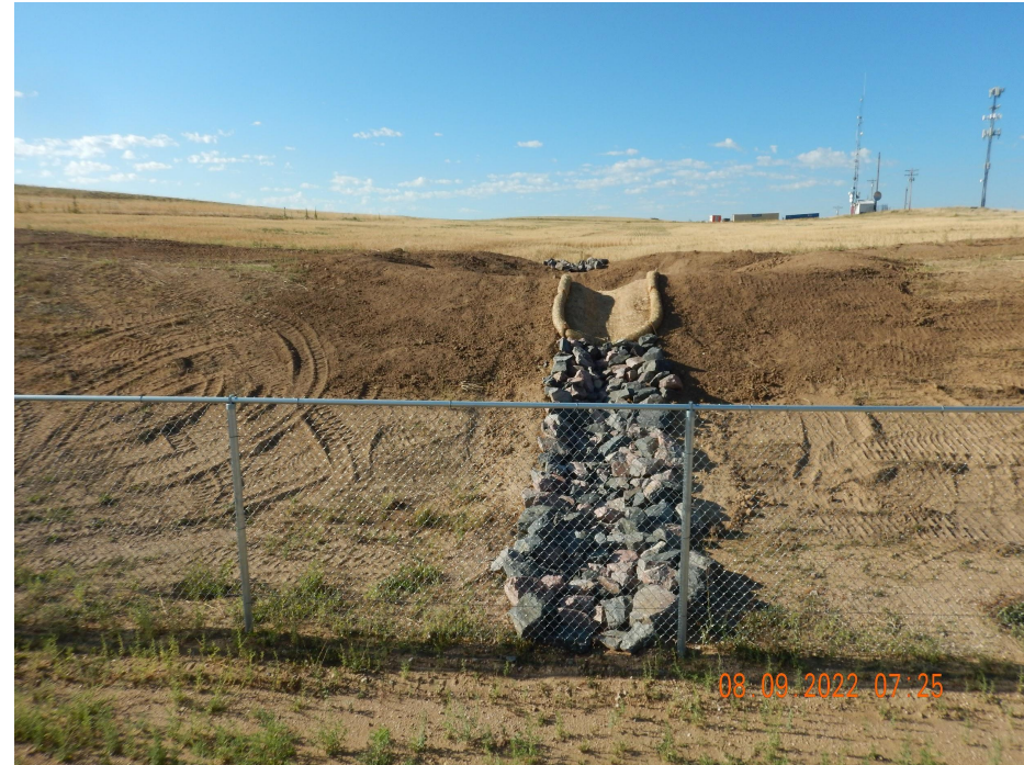
Photo 8. Photo taken from the southern location, facing South. See comments under Photo 2.