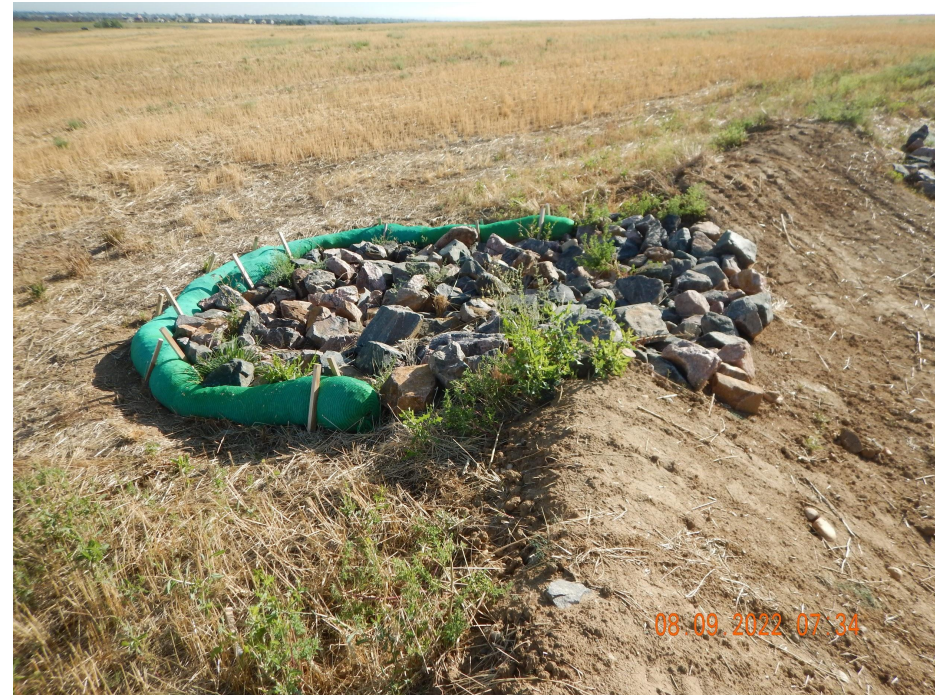
Photo 12. Photo taken from the previous photo illustrates the stabilized outlet of the sediment trap.