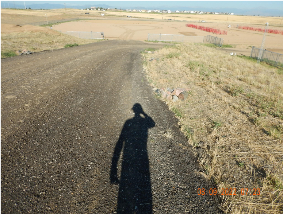
Photo 7. Photo taken from the entrance of location, facing West. See comments under Photo 6. Also, Operator has added recycled asphalt along the entire length of the access road to stabilize it and control erosion.