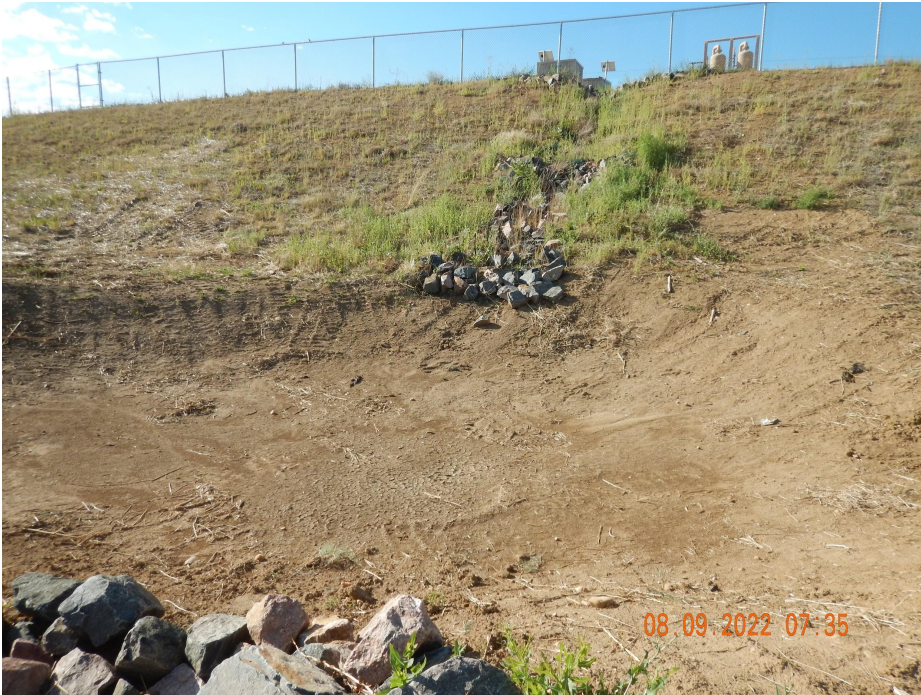
Photo 11. Photo taken from the northern facility pad, facing South. Photo illustrates the current BMPs appear to be in proper functioning condition.