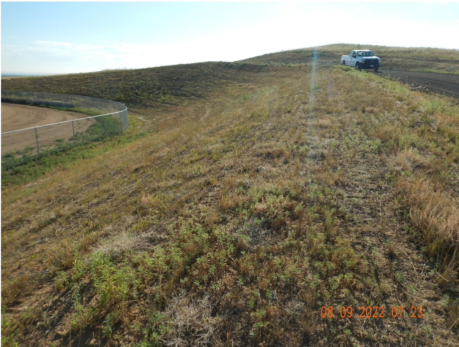
Photo 5. Photo taken from the entrance of location, facing East. Photo illustrates the cut slopes have been seeded and desirable vegetation is establishing to provide long term stabilization.