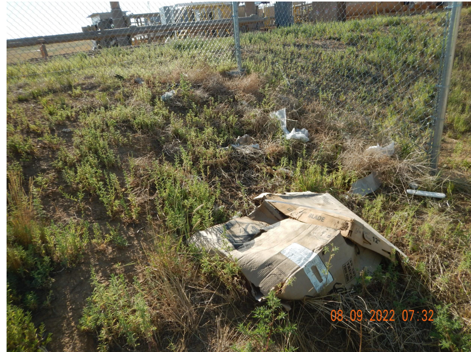
Photo 10. Photo taken from the previous photo illustrates trash within the disturbance area of the location.