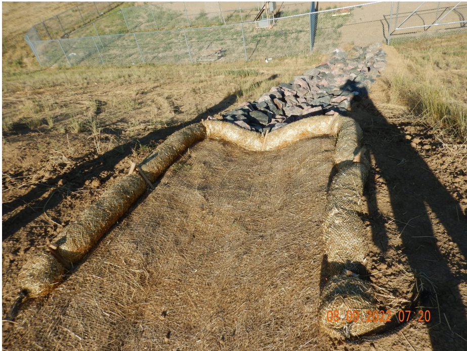
Photo 3. Photo taken of the stabilized outlet on the previous photo.