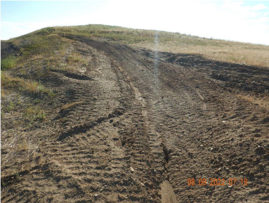
Photo 1. Photo taken from the entrance of location, facing East. Photo illustrates a ditch BMP along the perimeter of location. Operator should consider stabilizing the ditch BMP to reduce the velocity of stormwater.