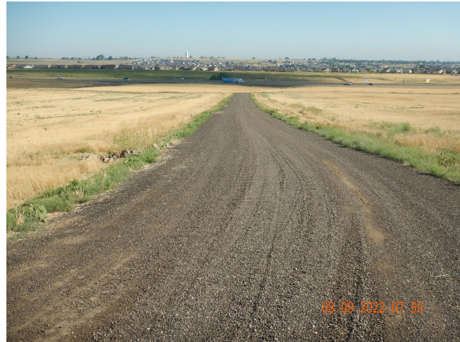
Photo 14. Photo taken along a portion of the main access road, facing North. See comments under Photo 7.