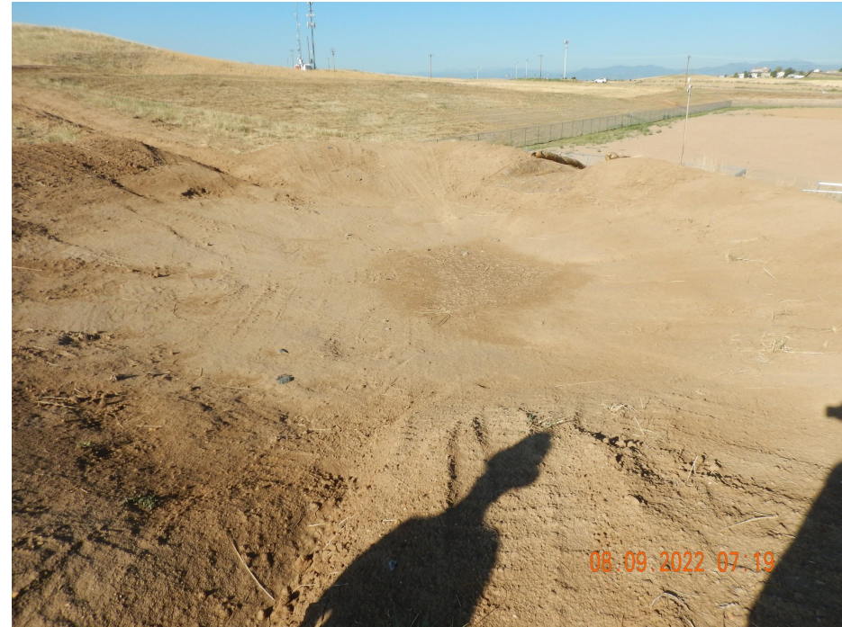
Photo 2. Photo taken from the entrance of location, facing West. Photo illustrates Operator has installed an additional BMP- sediment trap with a stabilized outlet.