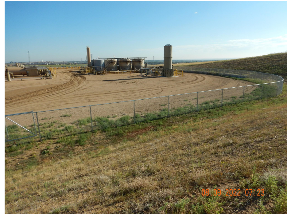
Photo 6. Photo taken from the entrance of location, facing North. Photo illustrates a fence has been installed around the entire location.