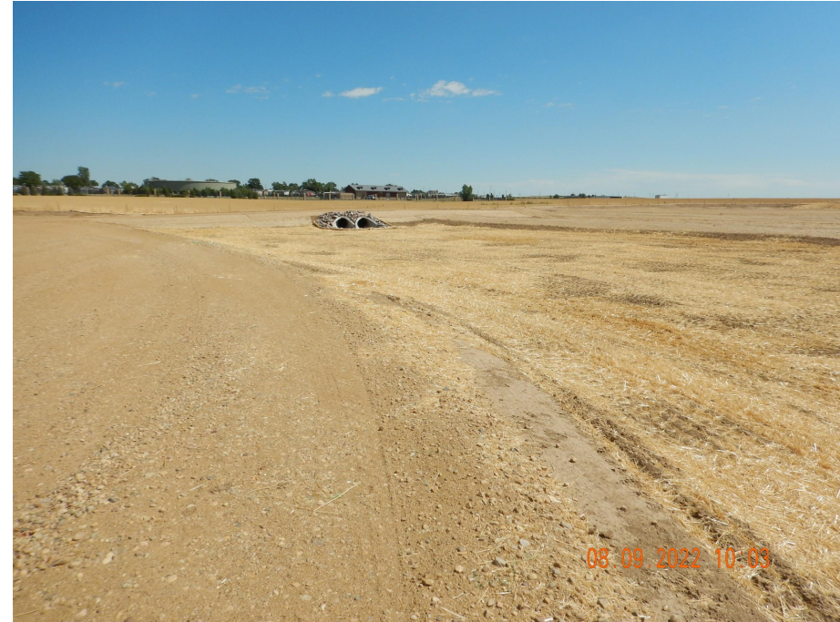
Photo 9. Photo taken from the southern location where it transects with a drainage flowing to First Creek, facing Northeast. Photo illustrates the Operator has installed engineered culverts to not impede channelized flow into First Creek.