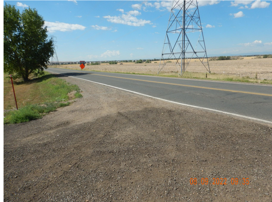
Photo 4. Photo taken from the entrance of location, facing South. See comments under Photo 3.