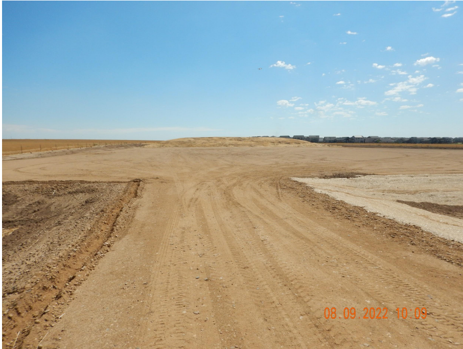
Photo 12. Photo taken from the drainage crossing, facing East. Photo illustrates topsoil has been stockpiled along the eastern perimeter of location.