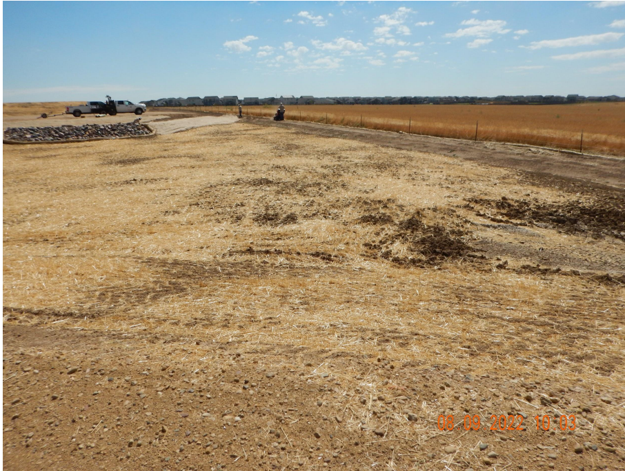
Photo 8. Photo taken from the southern location where it transects with a drainage flowing to First Creek, facing East. Photo illustrates the area has been straw crimped with mulch and seeded.