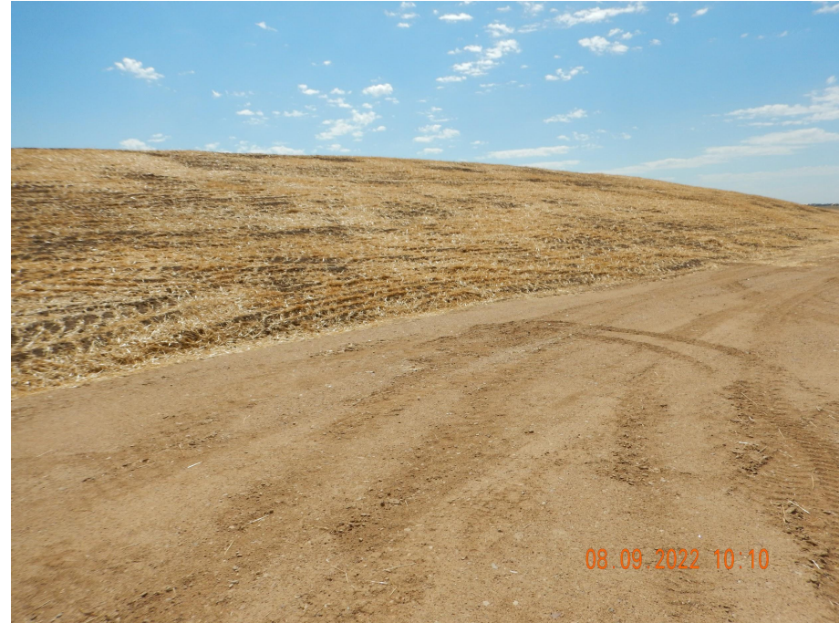
Photo 13. Photo taken from the eastern location, facing Southeast. Photo illustrates the topsoil stockpile has been straw crimped with mulch and seeded.