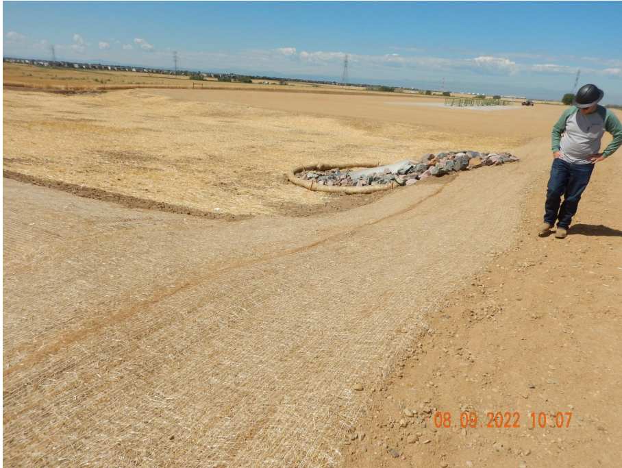
Photo 10. Photo taken from the outlet of the engineered culvert, facing West. Photo illustrates portions of the cut slope have been stabilized with erosion control blankets.