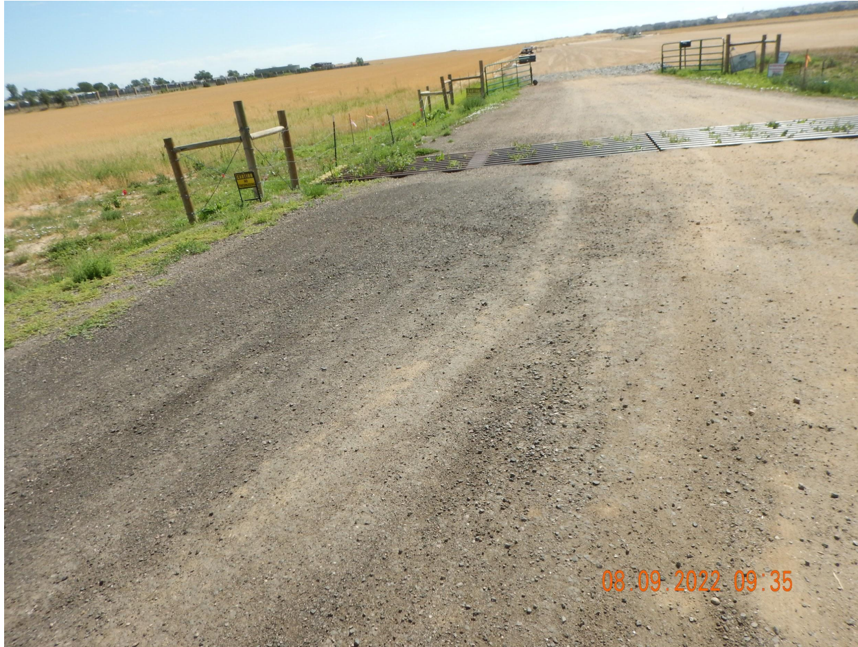
Photo 5. Photo taken from the entrance of location, facing East. Photo illustrates the VTC devices and the stabilized access road.