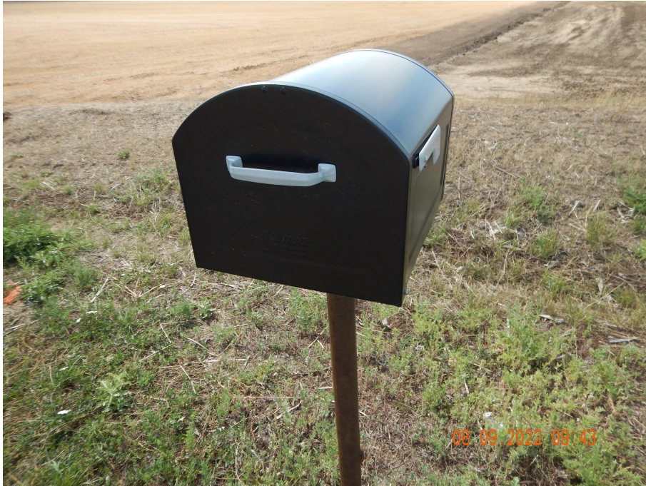
Photo 1. Photo taken from the entrance of location. Photo illustrates a mailbox to comply with 406.c. with the required paperwork.