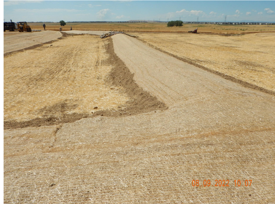
Photo 11. Photo taken from the outlet of the engineered culvert, facing South. Photo illustrates another retention area for the eastern portion of the location.