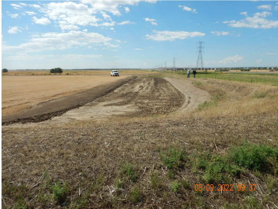
Photo 6. Photo taken from the entrance of location, facing South. Photo illustrates the retention pond with the contractor performing an inspection.