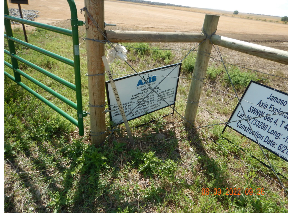
Photo 2. Photo taken from the entrance of location. Photo illustrates the Operator signage.