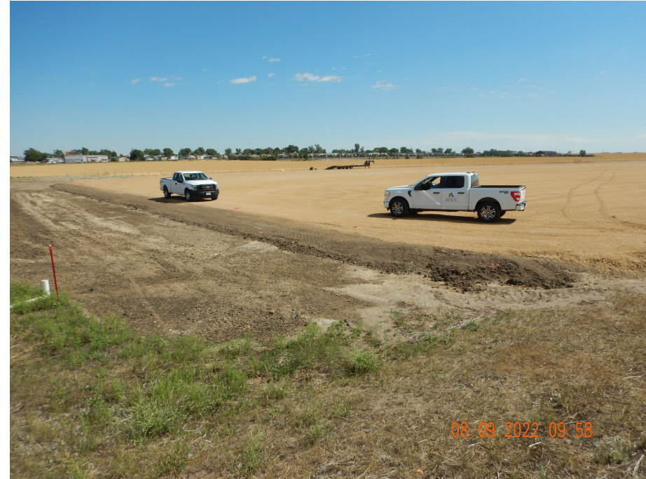
Photo 7. Photo taken from the southwestern location, facing North. See comments under Photo 6. Also, the photo illustrates the location is stabilized with road base.