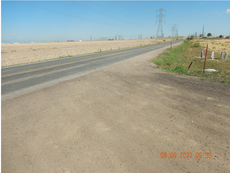
Photo 3. Photo taken from the entrance of location, facing North. Photo illustrates there was no observed vehicle track out.