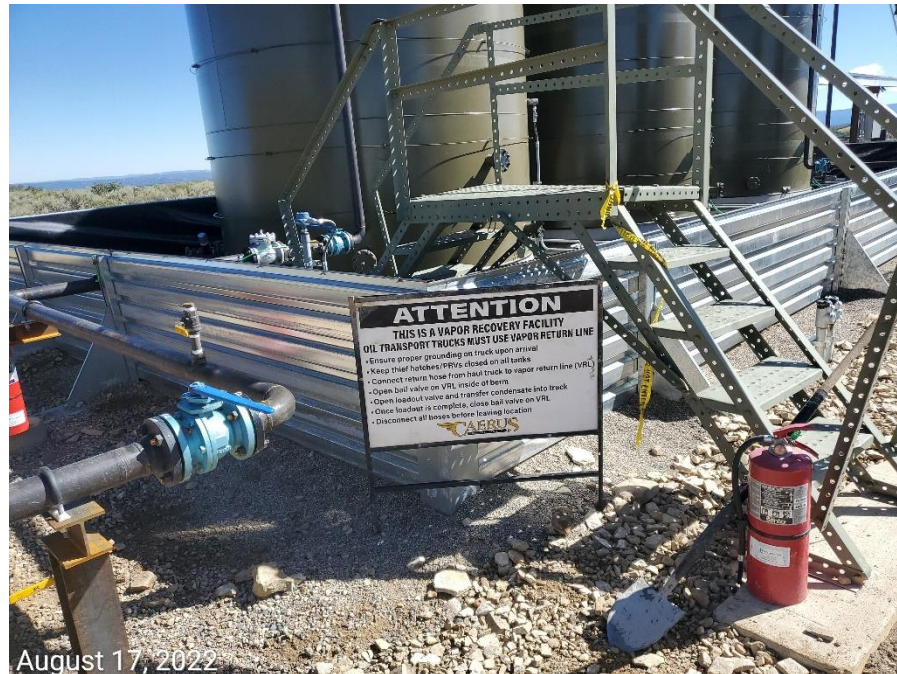
Photo 1: Tanks/Battery on the north end of the Location; tanks missing required labeling.