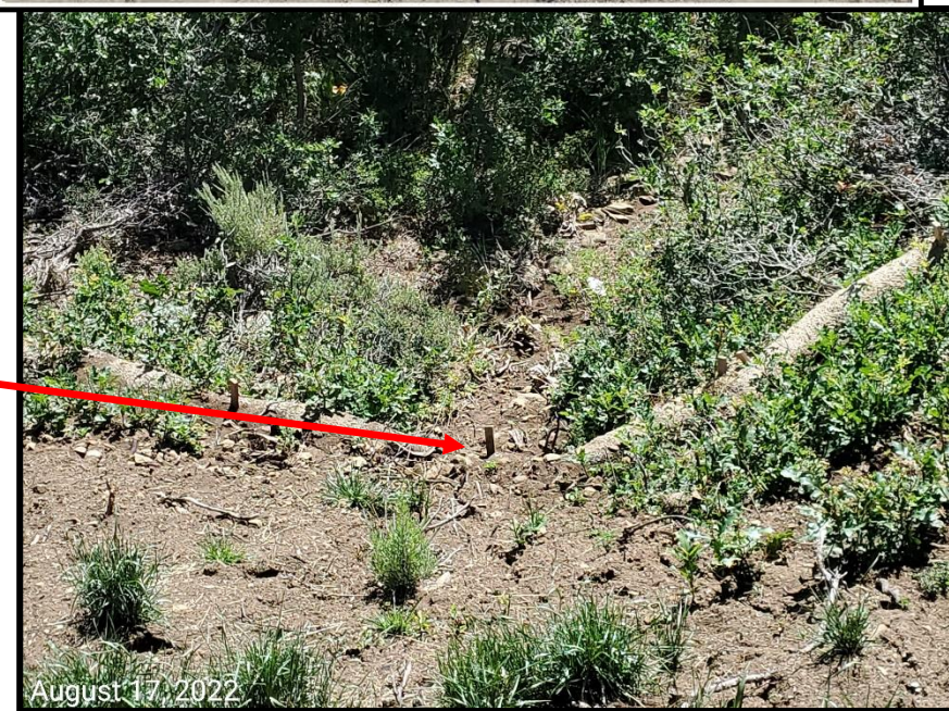
Photo 4: Top photos show areas identified in the 9/3/2021 and 6/22/2022 inspections, where offsite sediment transport from the topsoil stockpiles is evident. Bottom photos from 8/17/2022 show BMPs to protect/stabilize topsoil stockpiles, and to prevent offsite sediment (red arrow) transport remains inadequate and/or have not been maintained.