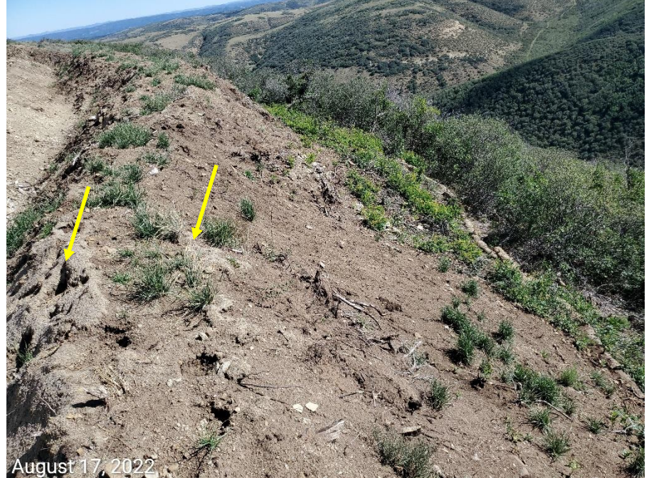
Photo 3: Photos examples showing BMPs to protect the topsoil stockpiles are missing or insufficient; soils at the stockpiles are exposed and at risk to wind and water erosion. Arrow shows areas of hydromulch that had been previously applied; BMP has not been maintained.