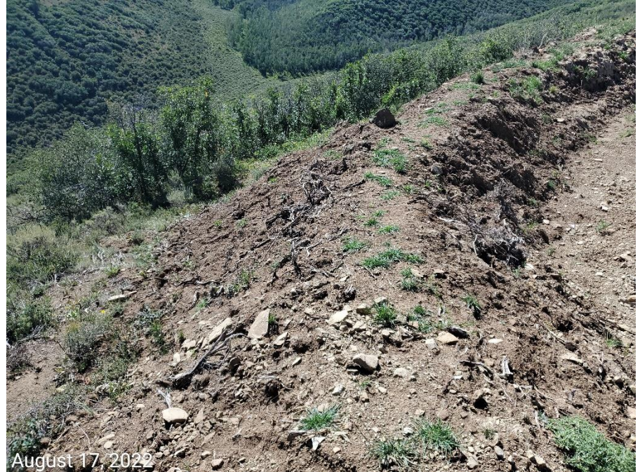
Photo 2: Photos taken from the perimeter topsoil stockpile on the east end of the Location. Photos examples showing topsoil remains (red arrow) in use as part of the Location perimeter stormwater ditch/berm and sediment trap (yellow arrow). Photos also examples showing BMPs to protect and stabilize the topsoil stockpiles remains missing or insufficient; hydromulch previously implemented has not been maintained in proper functioning condition.