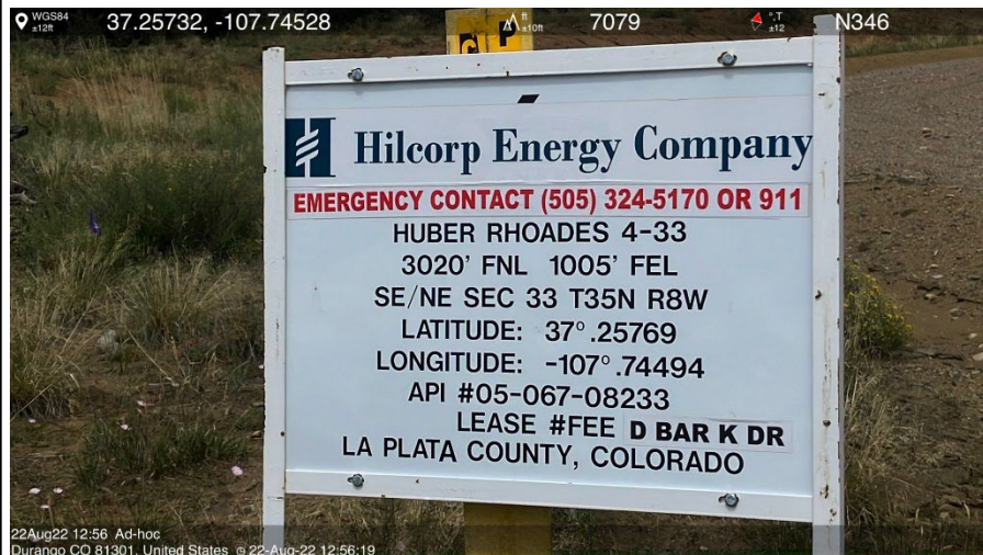
IMG 01 Well sign