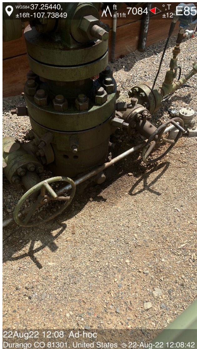
IMG 03 Impacted material