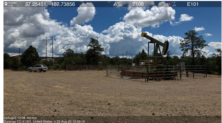
IMG 02 Location overview