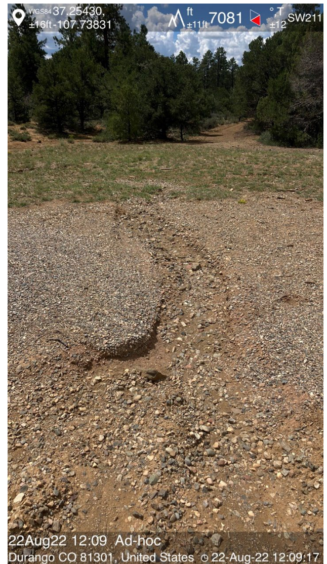
IMG 04 Stormwater impact