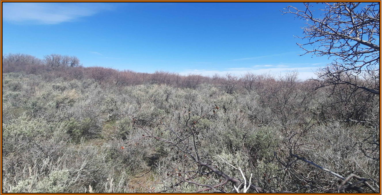
PHOTO: VIEW OF REFERENCE AREA - FACING NORTH