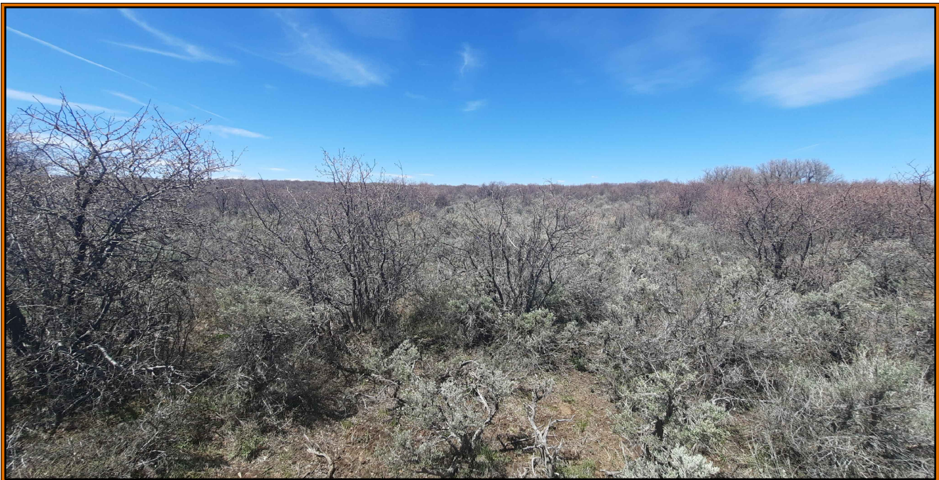
PHOTO: VIEW OF REFERENCE AREA - FACING WEST