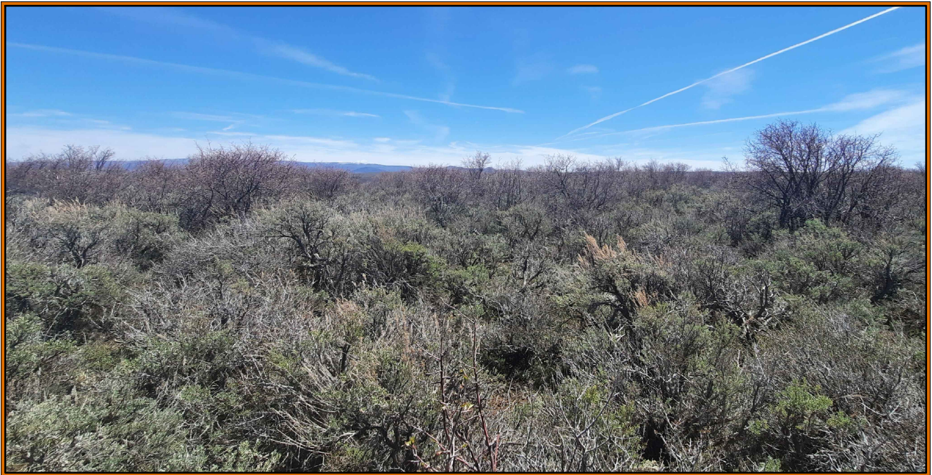
PHOTO: VIEW OF REFERENCE AREA - FACING EAST

ELU A18 495 WELL PAD NW1/4 NW1/4, SECTION 18, T4S, R95W, 6TH P.M. RIO BLANCO COUNTY, COLORADO