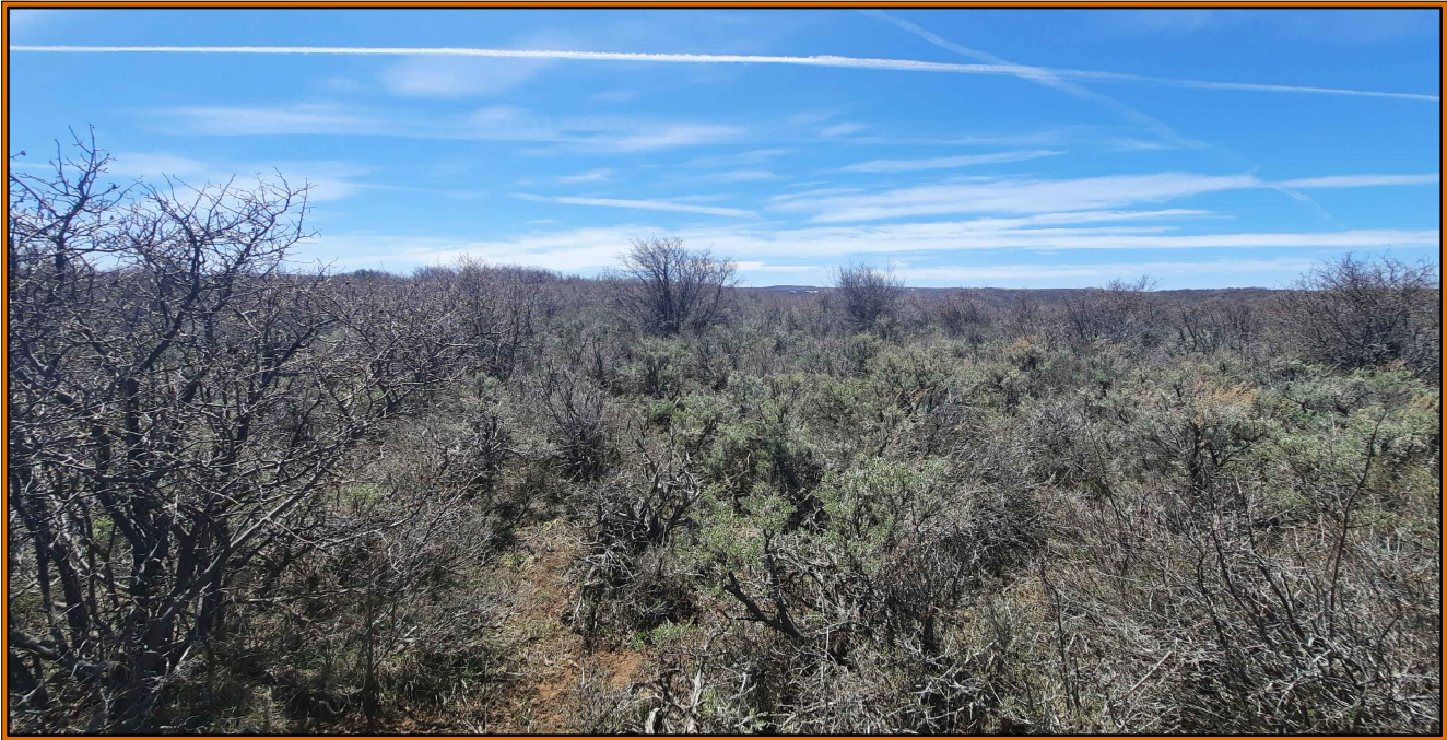
PHOTO: VIEW OF REFERENCE AREA - FACING SOUTH