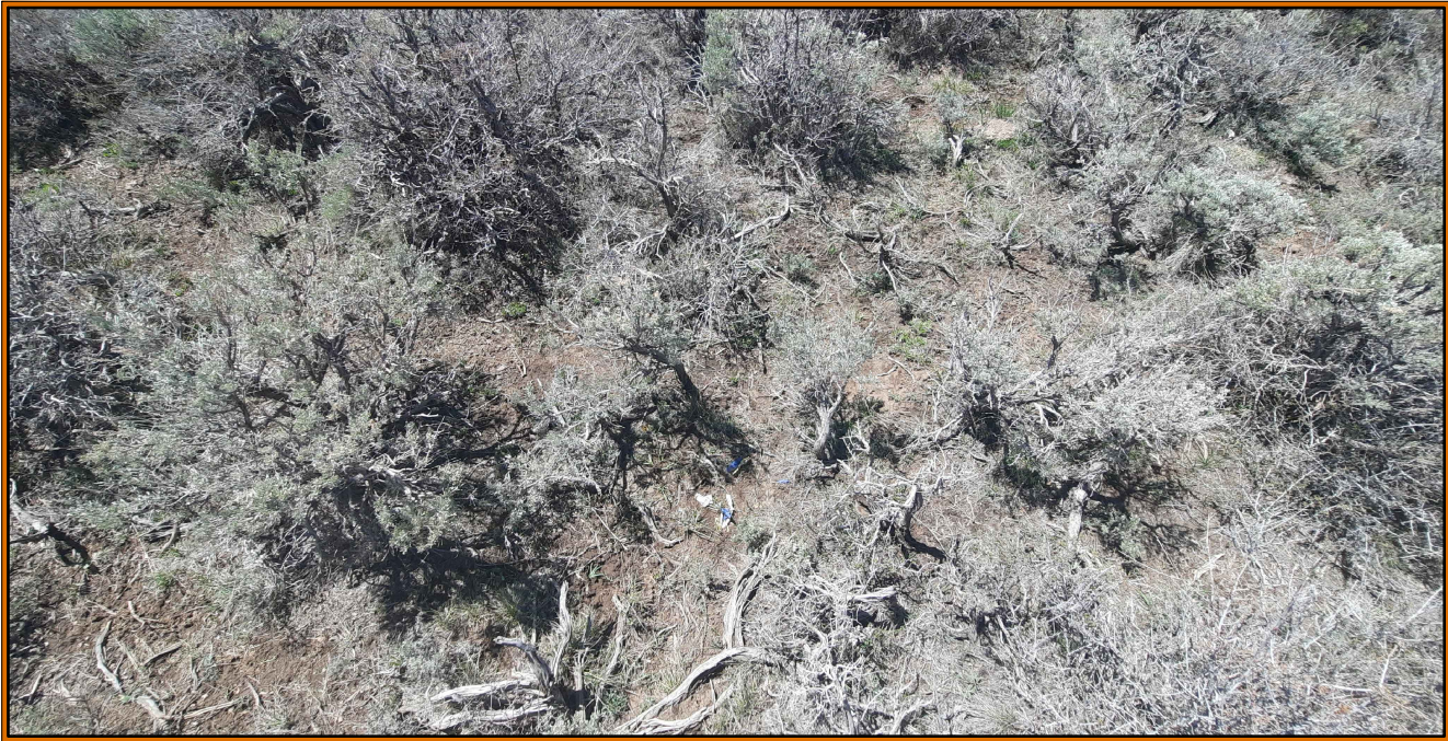
PHOTO: VIEW OF REFERENCE AREA - FROM ABOVE

ELU A18 495 WELL PAD NW1/4 NW1/4, SECTION 18, T4S, R95W, 6TH P.M. RIO BLANCO COUNTY, COLORADO