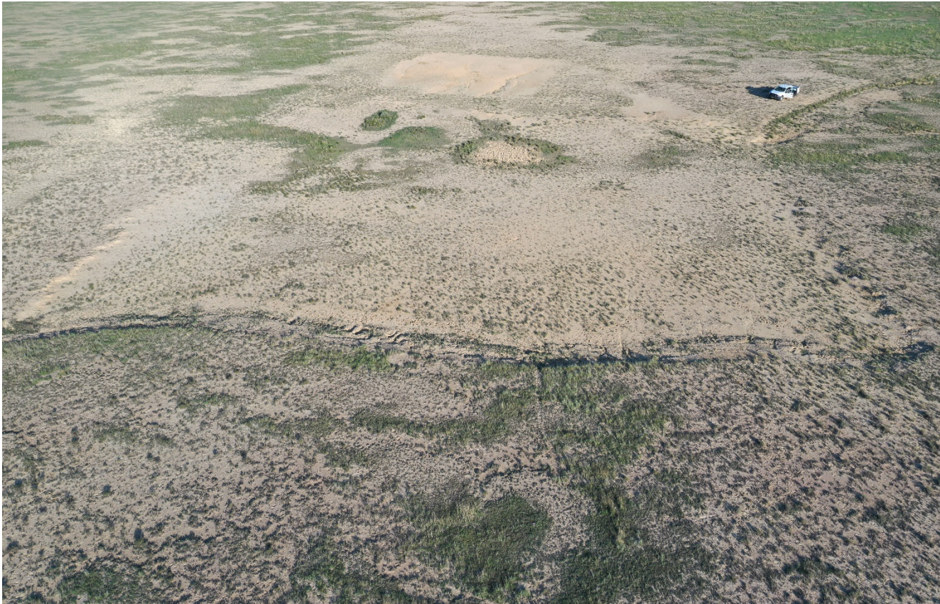
Photo 8. Drone aerial photo facing northwest toward the location.