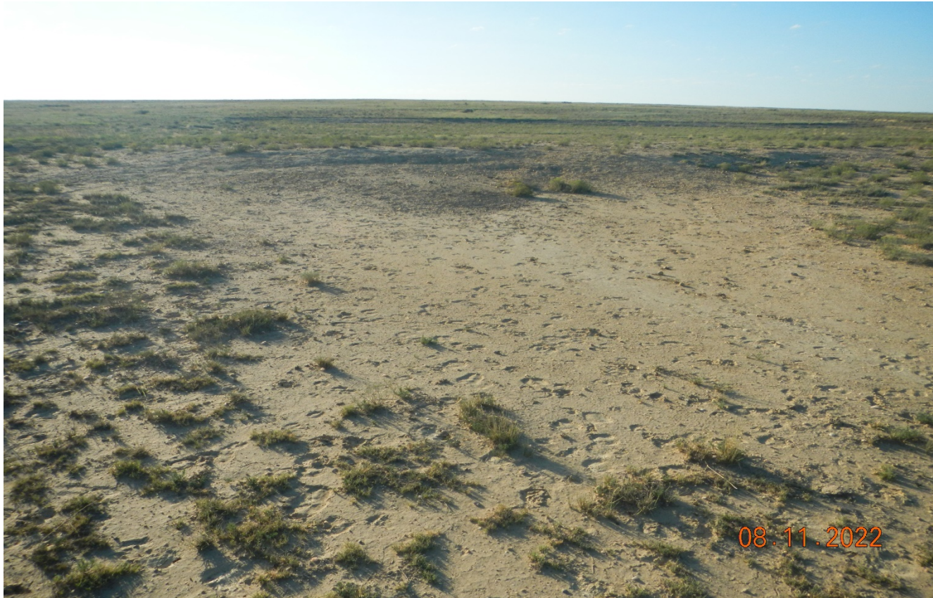
Photo 2. Facing southeast at the location. The fill slope has not been recontoured. There is no vegetation growth along this area.