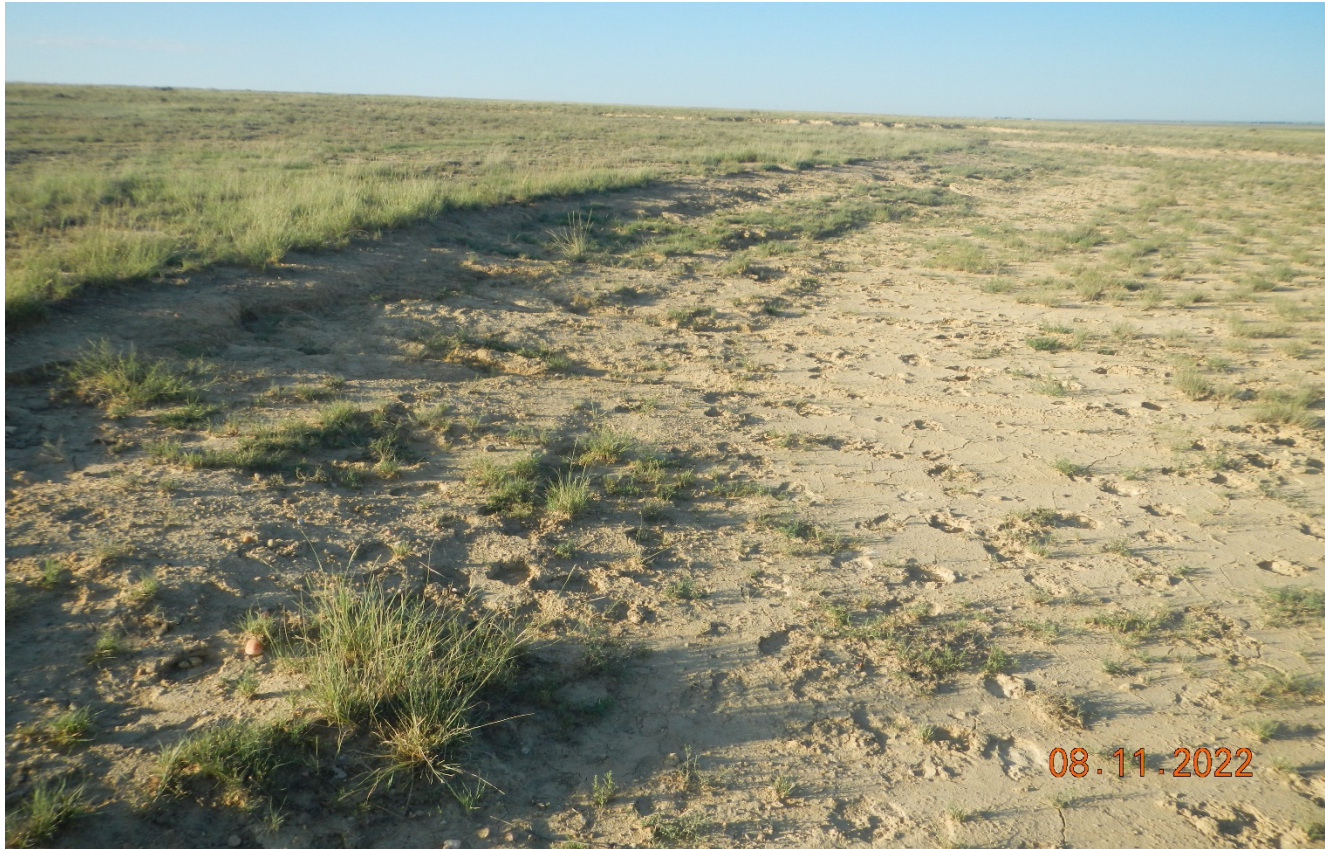
Photo 4. Facing southwest along the cut slope which is not recontoured. There are signs of erosion and soils are not stabilized.