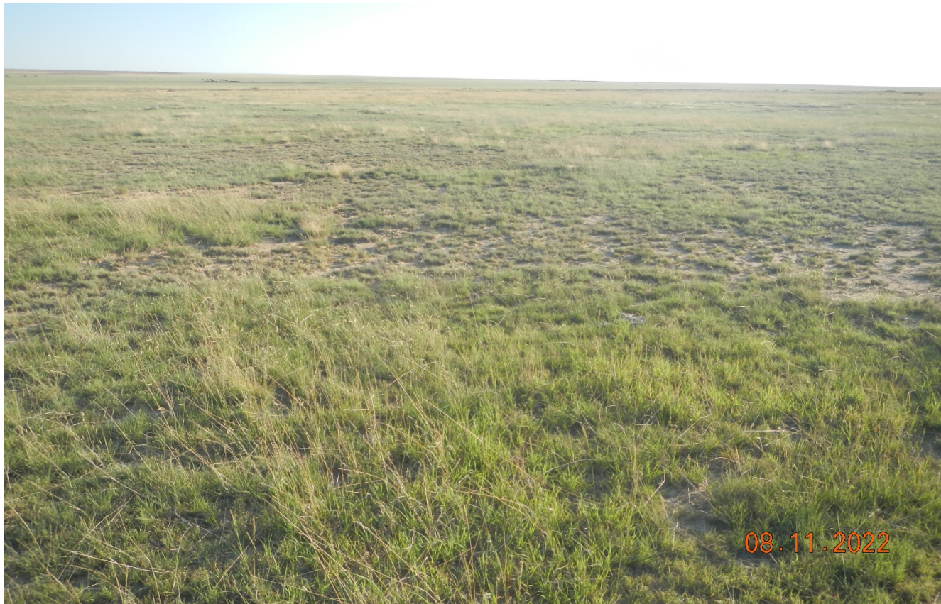
Photo 6. Facing east toward the surrounding undisturbed rangeland consisting of Blue grama, Sand dropseed among other native species.