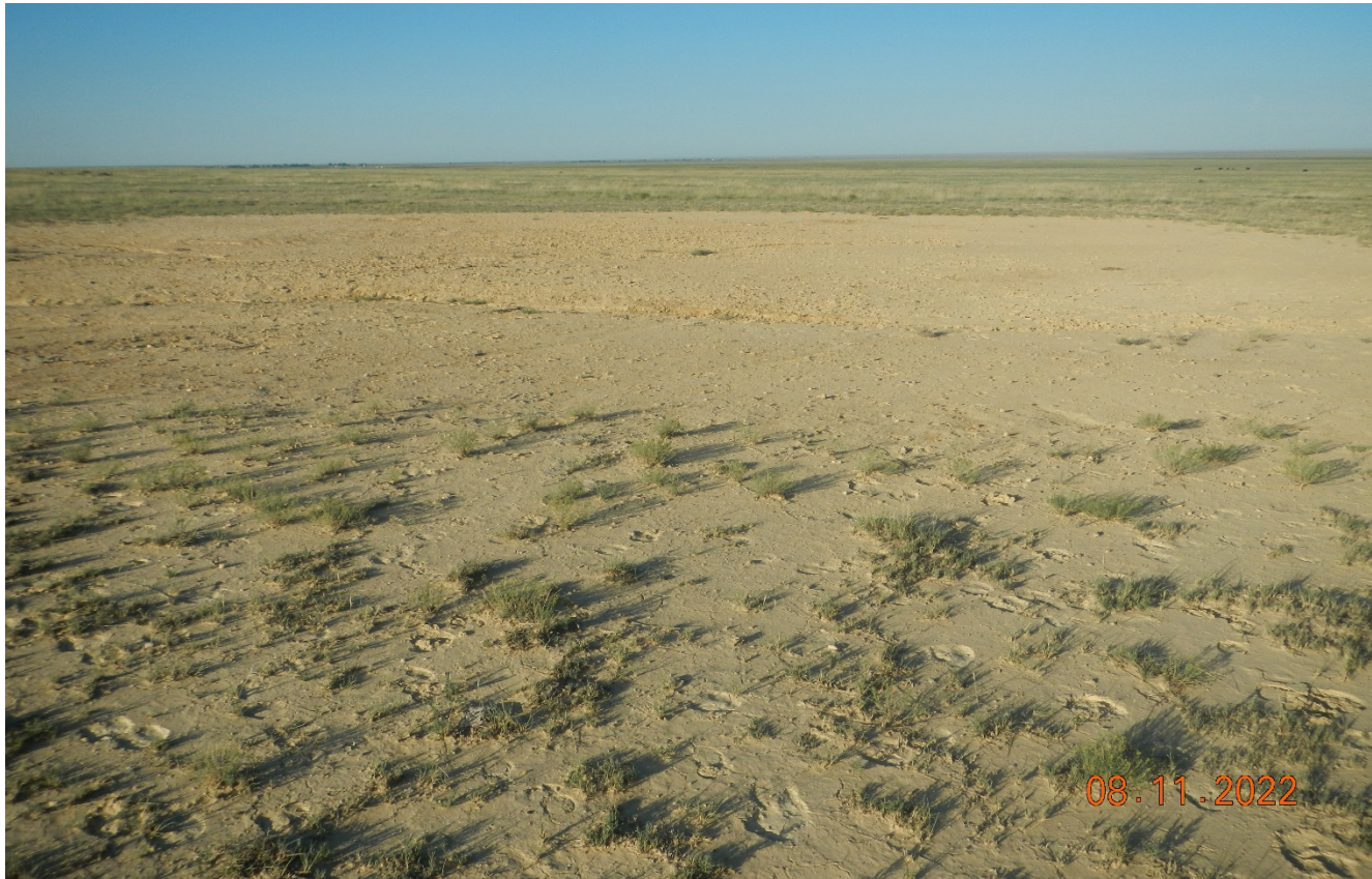
Photo 3. Facing southwest at the location. There is no vegetation observed in this bare area approximately 120'x120'. There may be soil issues preventing vegetation establishment.