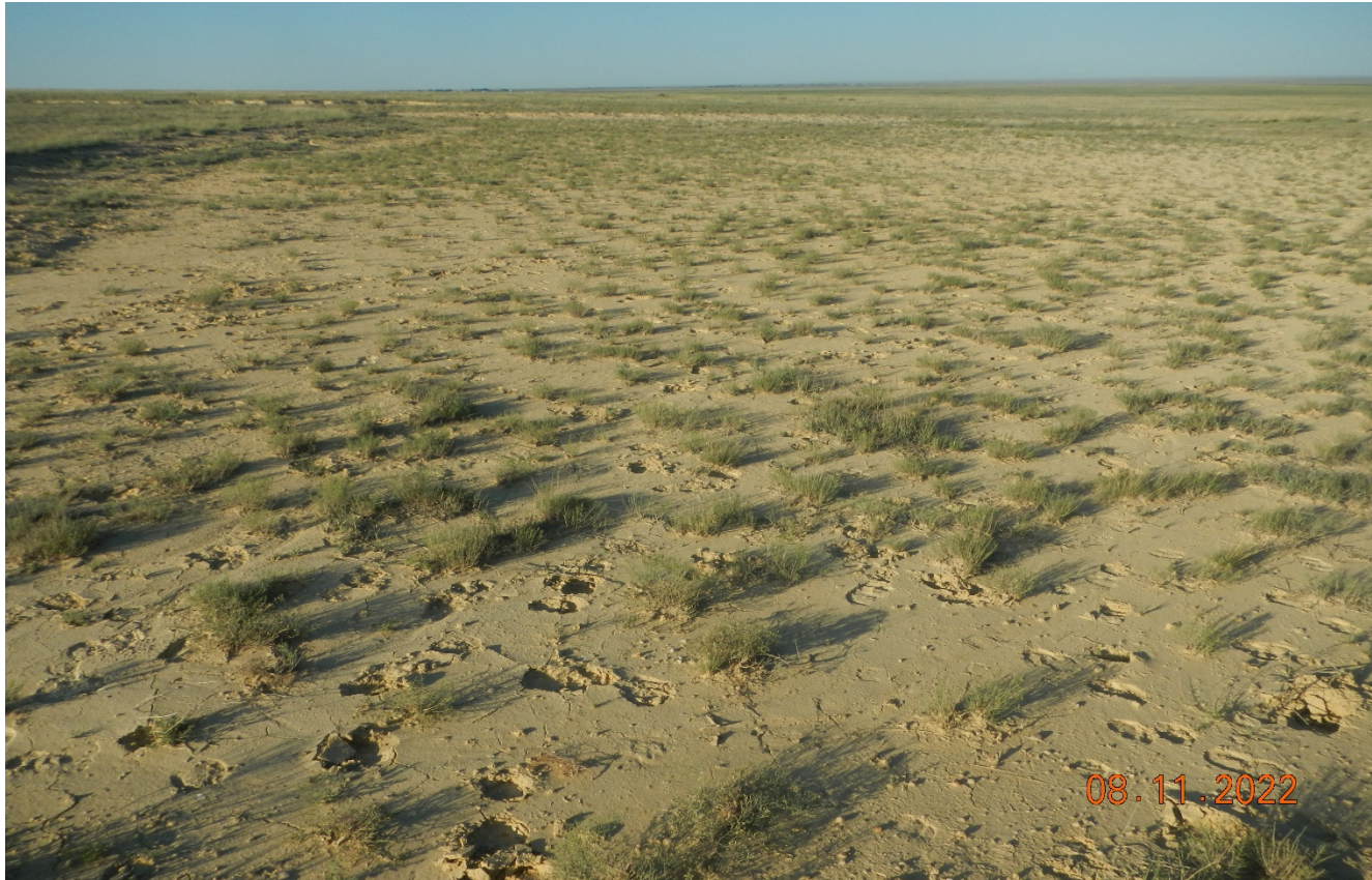
Photo 5. Facing southwest at the at the eastern corner of the location.