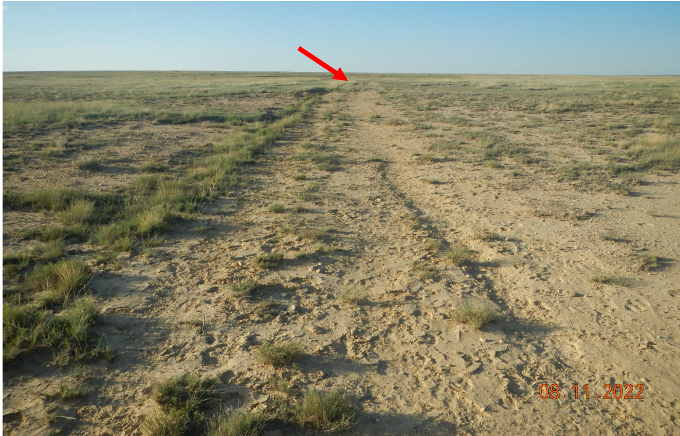
Photo 1. Facing southeast along the former access road. Vegetation has not re-established in this area and there is erosion. Location is shown at red arrow.