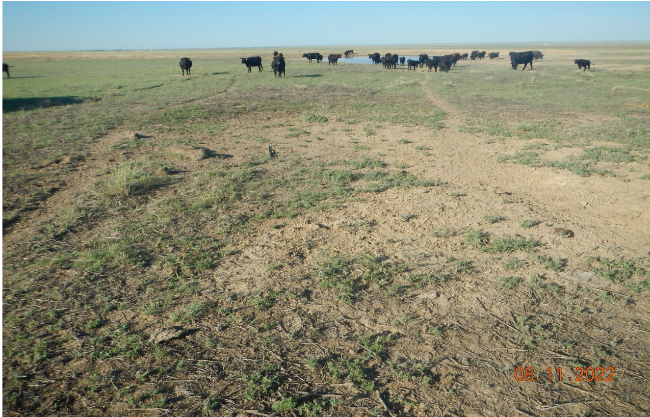
Photo 3. The abandoned engine compresor has been removed since the previous inspection. This area has not been reclaimed and consists of weeds and bare soil.