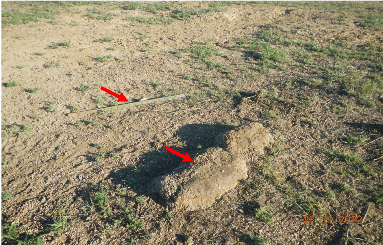
Photo 4. There is a pile of hardened oily waste that remains shown at red arrow. A t-post remains at red arrow.