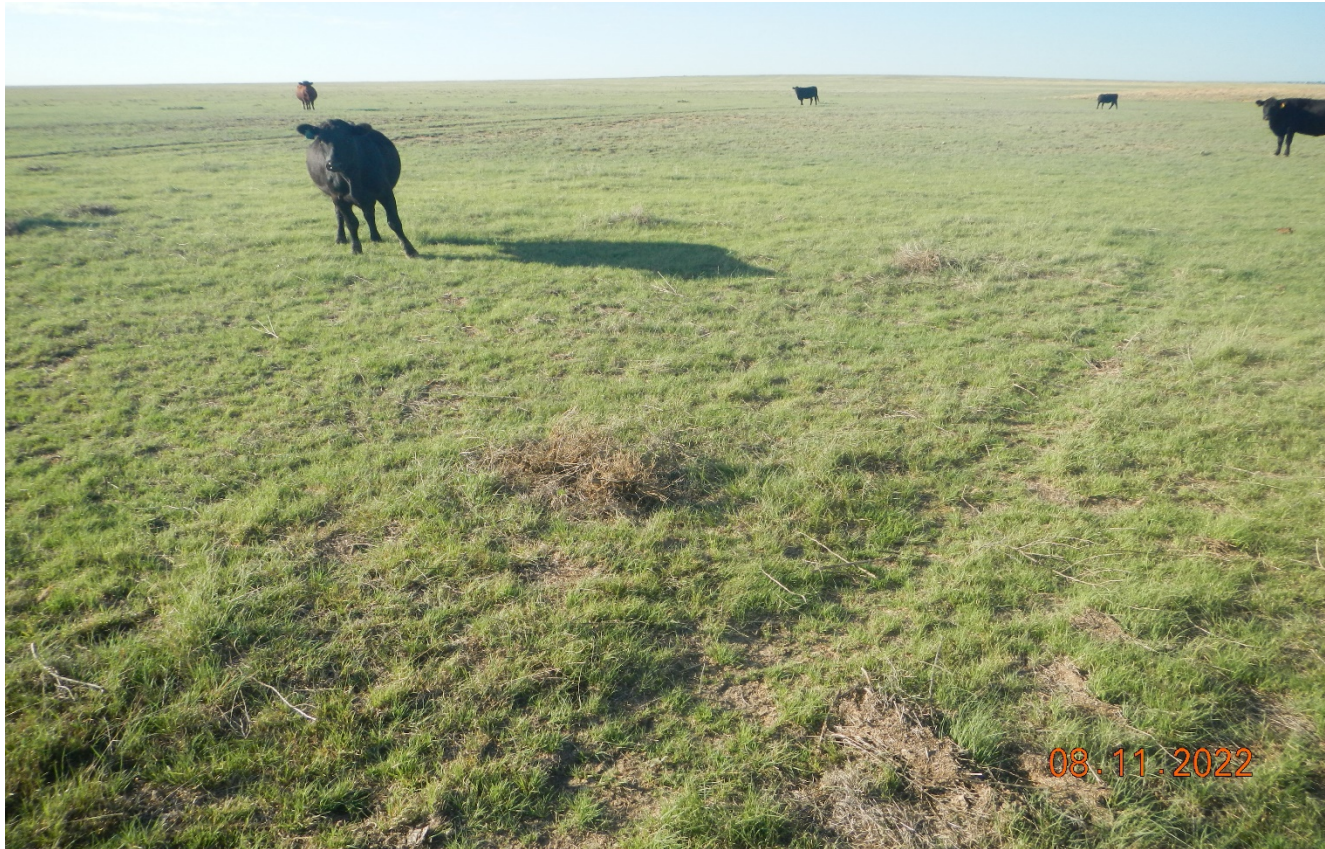
Photo 5. Facing toward the surrounding undisturbed pasture that consists of native Blue grama grassland.