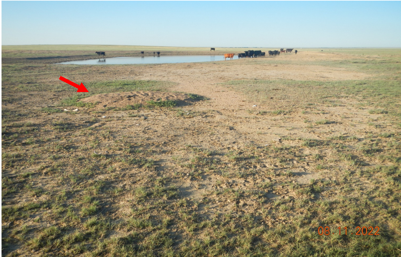
Photo 1. Facing southwest at the abandoned facility. The tank has been removed since previous inspection. No reclamation has been performed and there is some debris and gravel shown at red arrow.