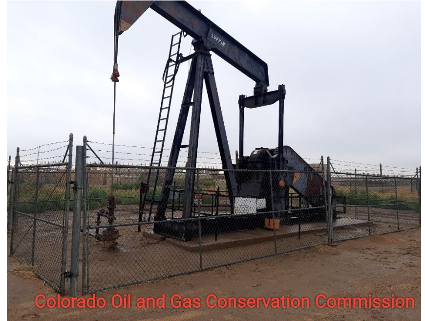
Photo 10 PU