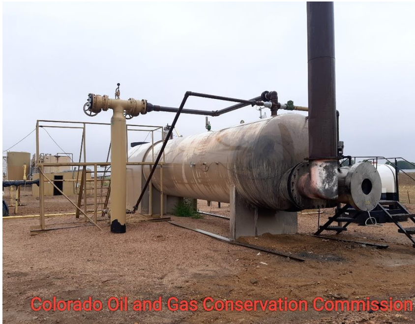
Photo 1 HOZ sep fire damage