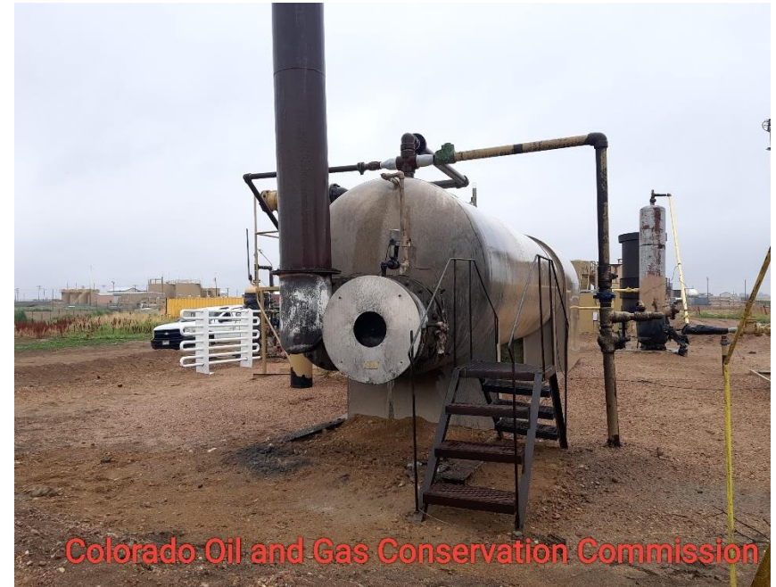
Photo 2 HOZ sep fire damage