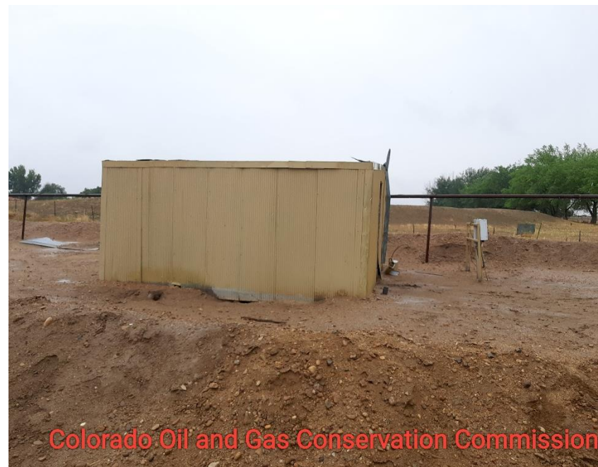
Photo 12 Recirc pump house.