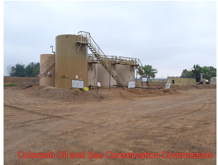
Photo 6 TNK BTRY