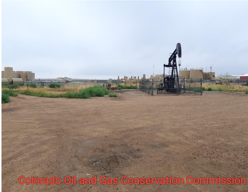
Photo 9 well head