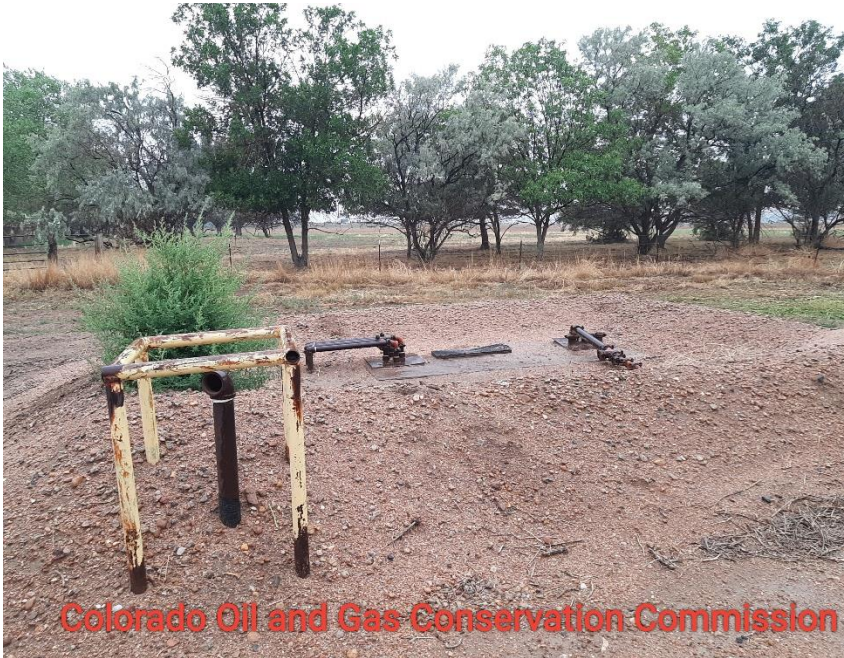
Photo 5 Cement vault not placards or tank volume markings