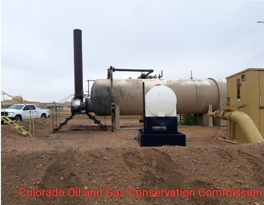
Photo 3 HOZ sep fire damage