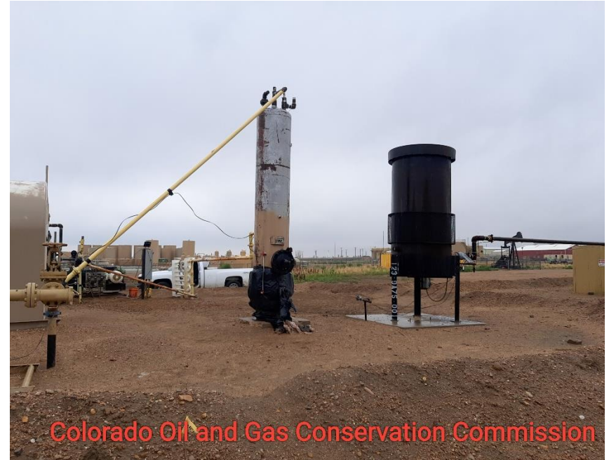
Photo 4 Vert sep and ECD