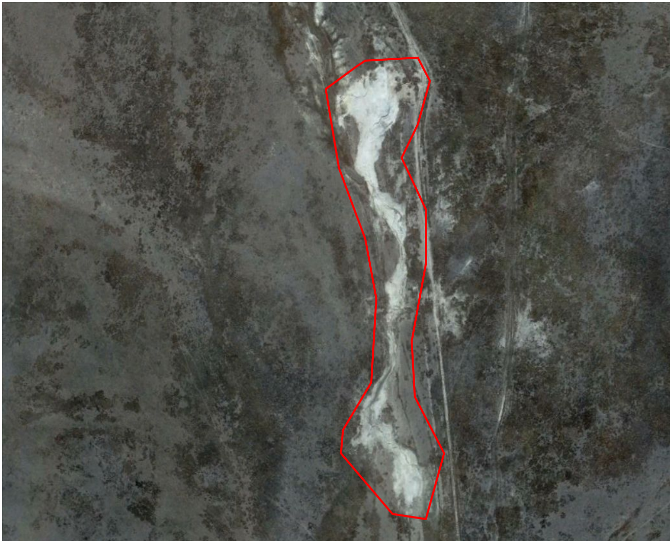
Photo 5. Google Earth aerial imagery from 10/15/2015 illustrates the visual extent of the produced water spill (red) which is further than previously illustrated in the 2016 inspection.