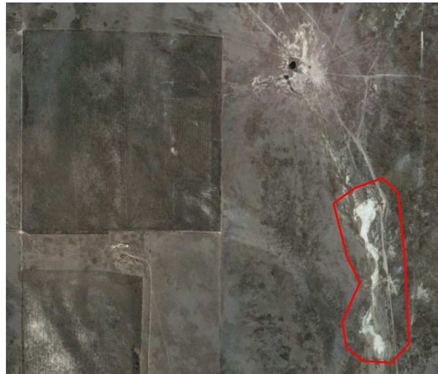
Photo 2. Google Earth aerial imagery from 10/15/2015.