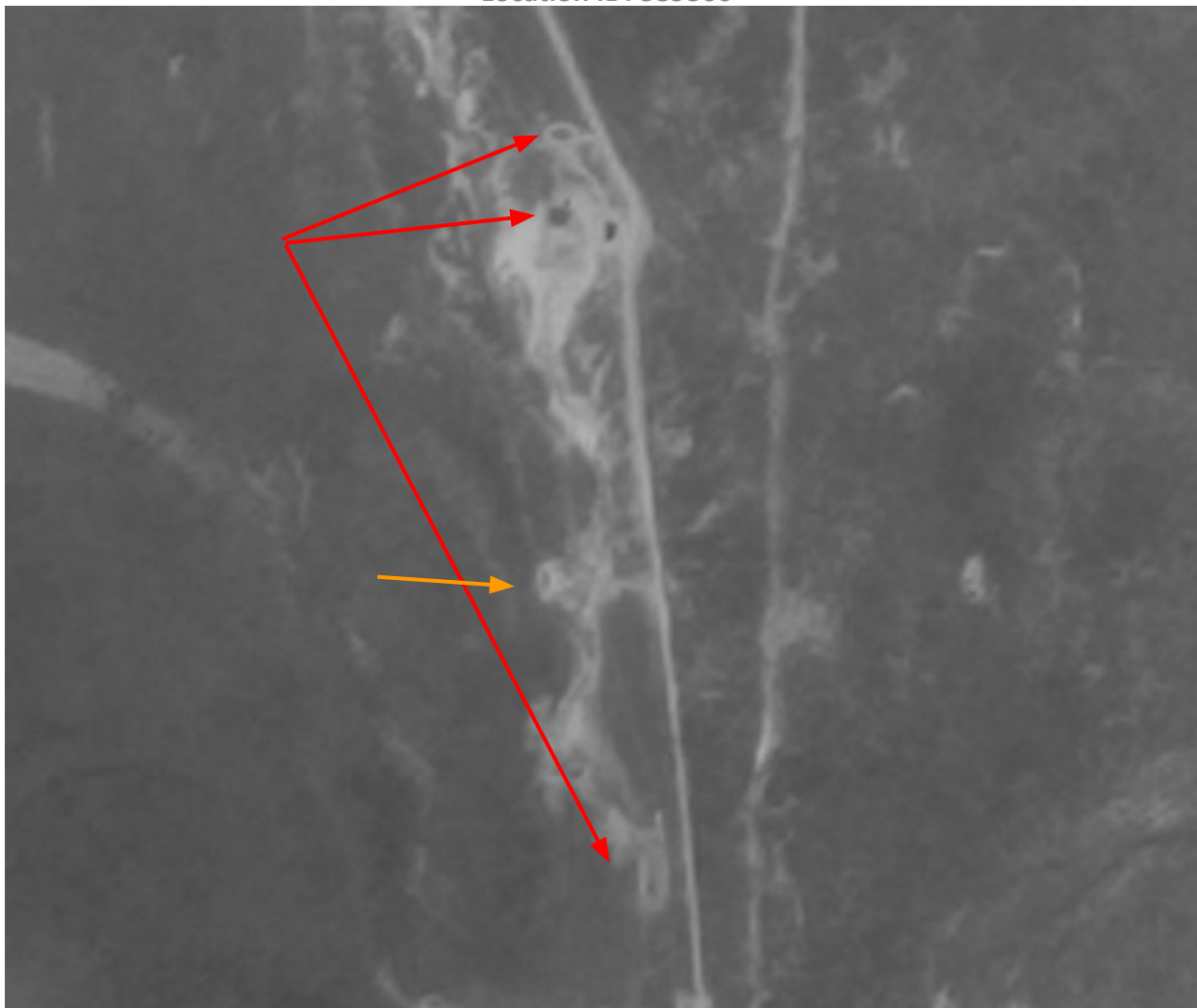
Photo 4. USGS imagery from 1993 illustrates the well, associated pit and produced water spill (red arrows). This imagery illustrates how the produced water spill has migrated further south.