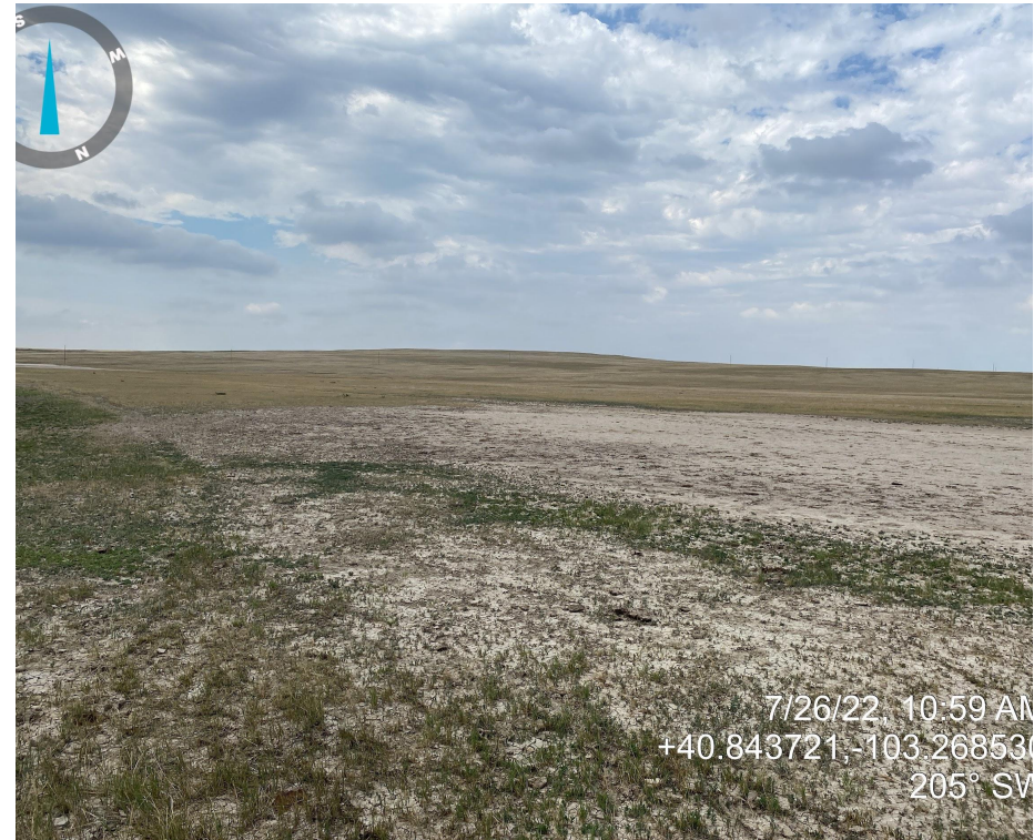
Photo 7. Photo taken from the southern spill area, facing Southwest. See comments under Photo 6.