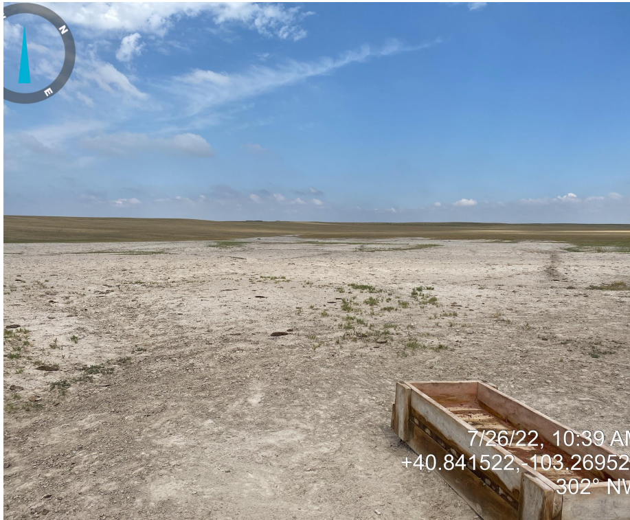
Photo 6. Photo taken from the southern spill area, facing Northwest. Photo illustrates an area that appears to be impacted by a produced water spill related this well.