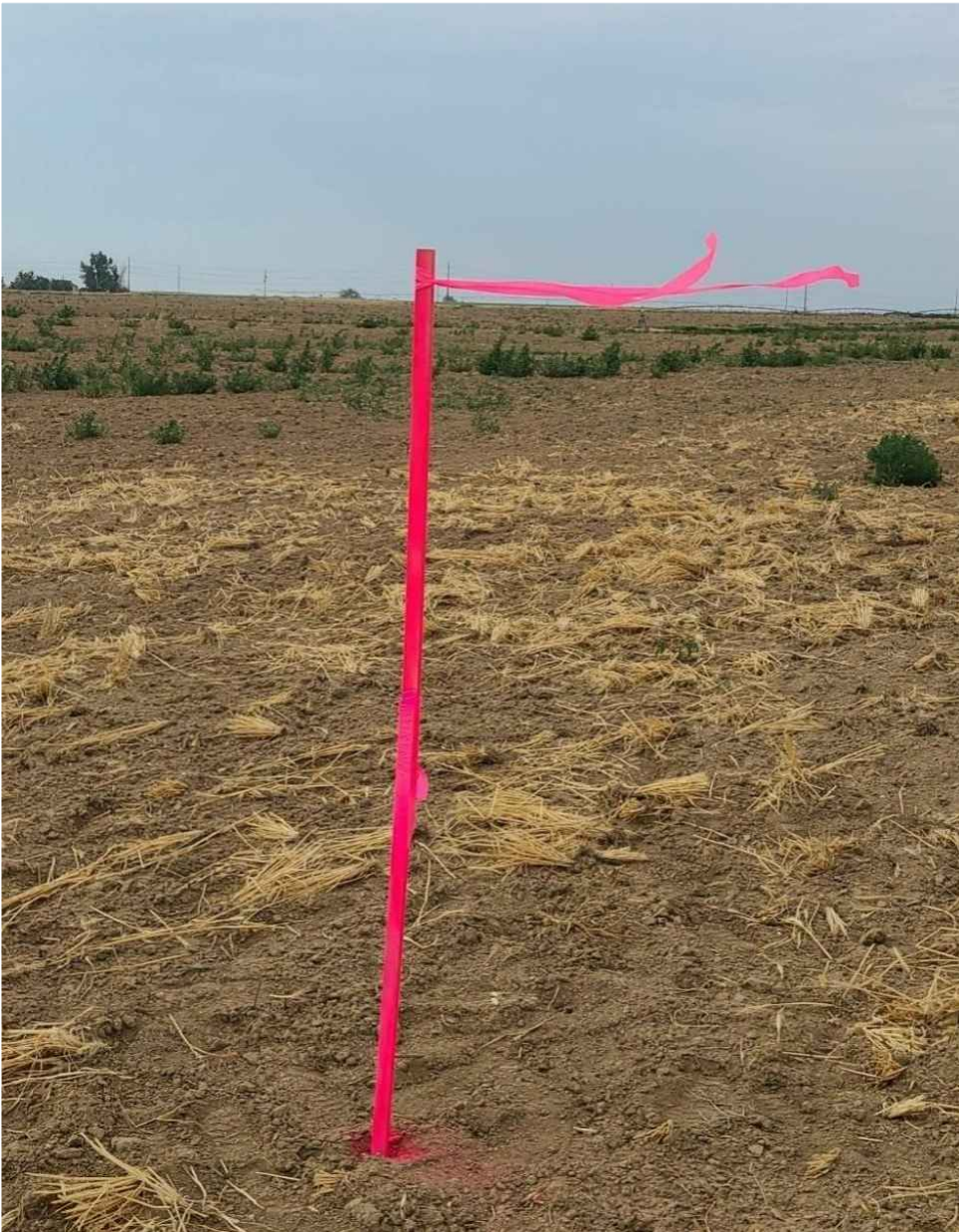
View to the North