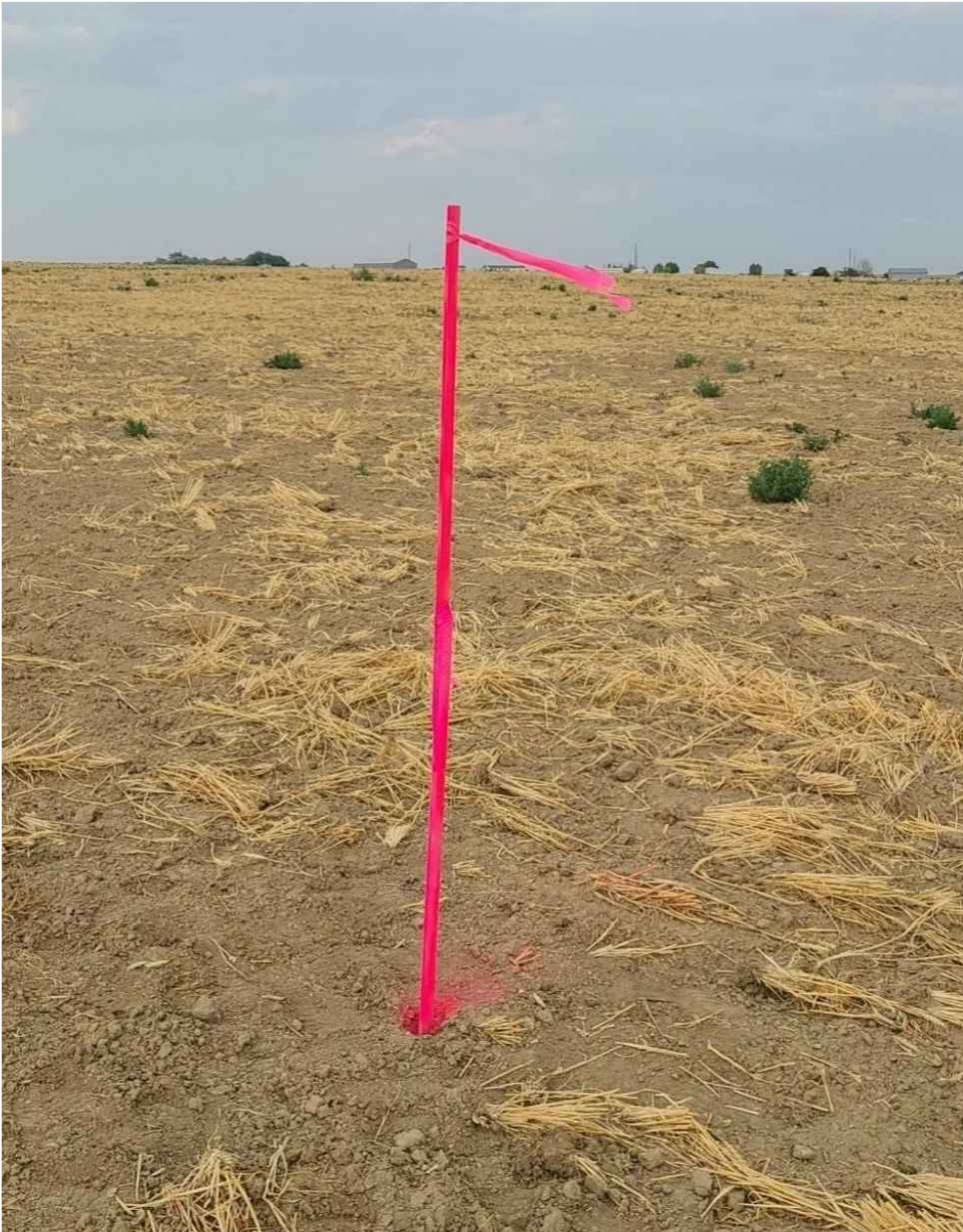
View to the East