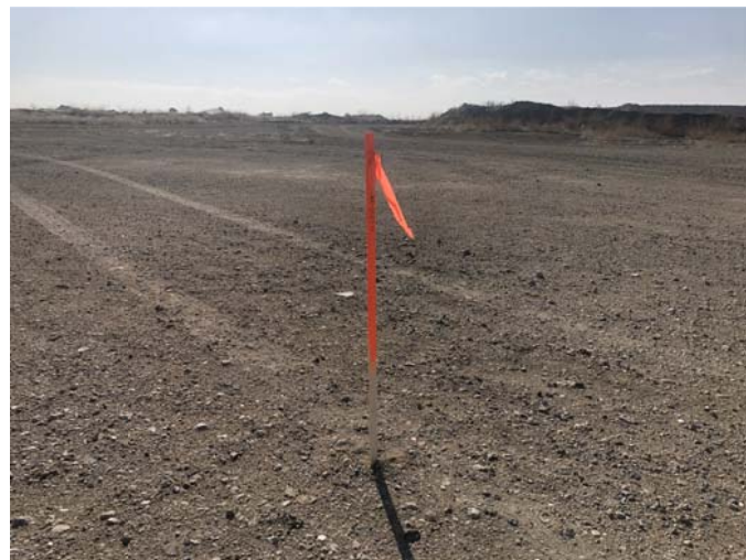
VIEW 6 – SOUTHWEST