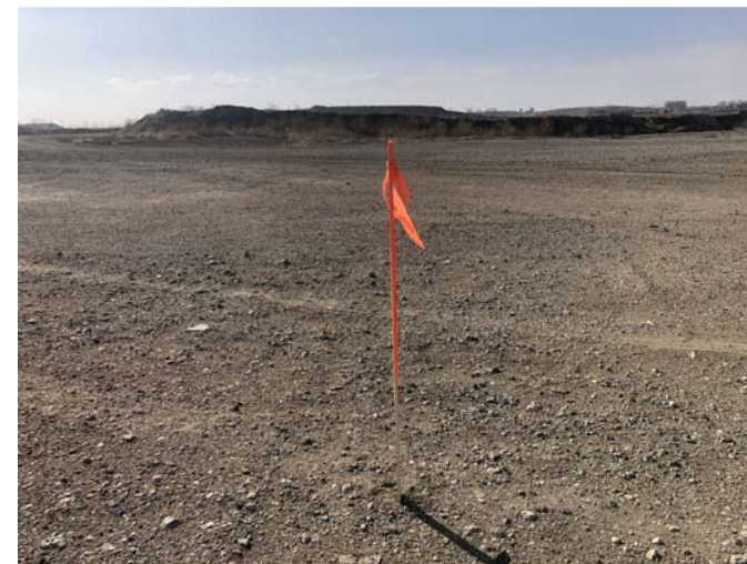
VIEW 7 – WEST