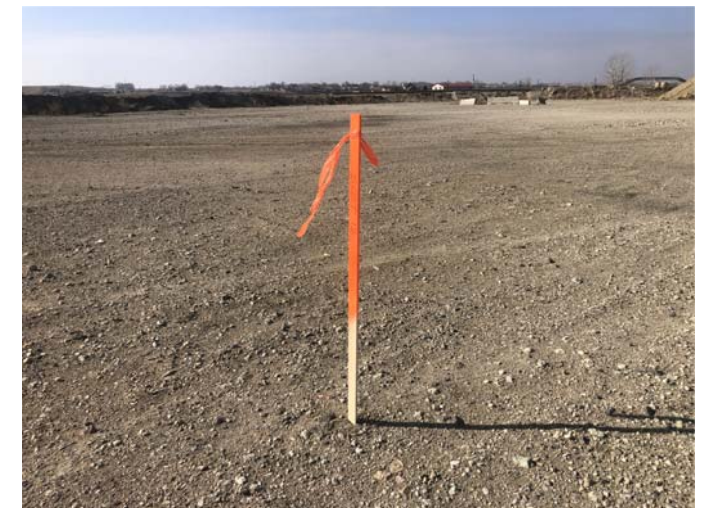
VIEW 8 – NORTHWEST