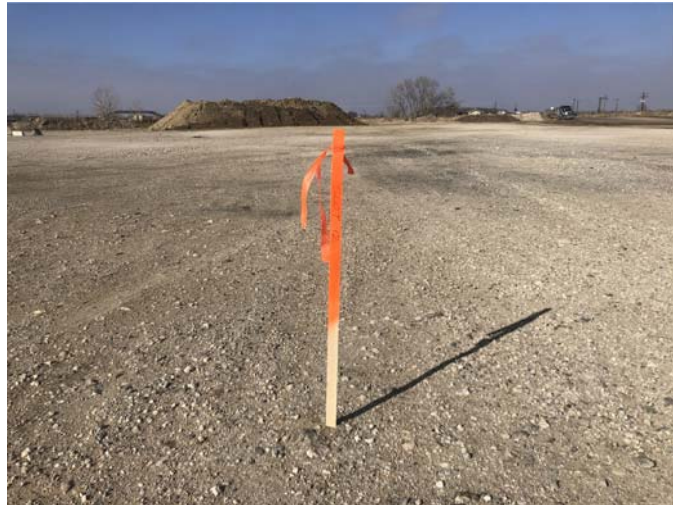
VIEW 1 – NORTH

SECTION: 30 TOWNSHIP: 2N RANGE: 66W 6TH. P.M. WELD COUNTY, CO DATE: 2/10/2021