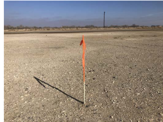
VIEW 3 – EAST