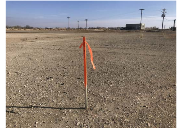
VIEW 4 – SOUTHEAST