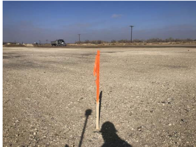
VIEW 2 – NORTHEAST