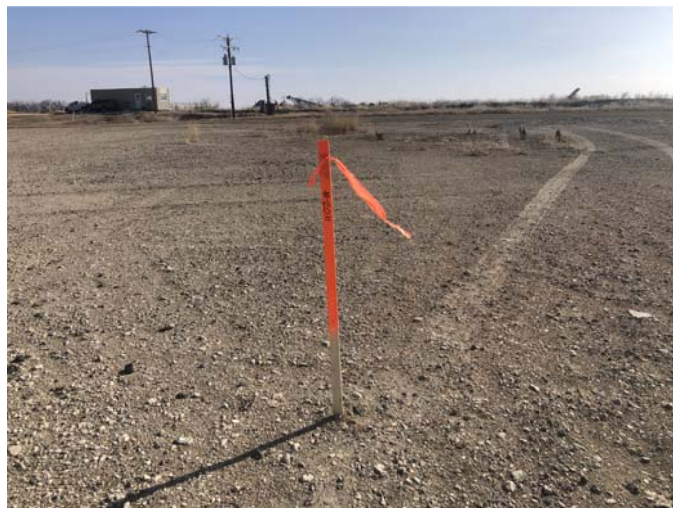
VIEW 5 – SOUTH