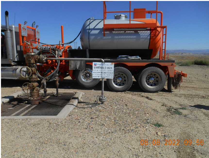
Injection wellhead during MIT