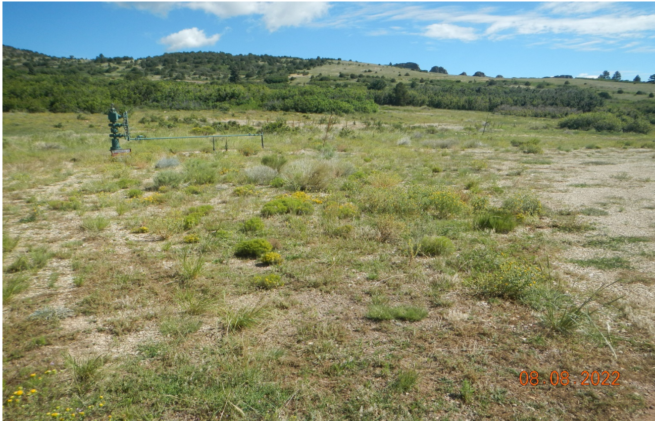
Photo 2. Facing northeast toward the multi well site.