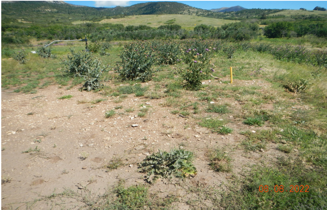
Photo 3. Facing north toward the location. There is numerous noxious weeds at the location that need to be controlled. The weeds have produced seed heads which should be cut and removed.