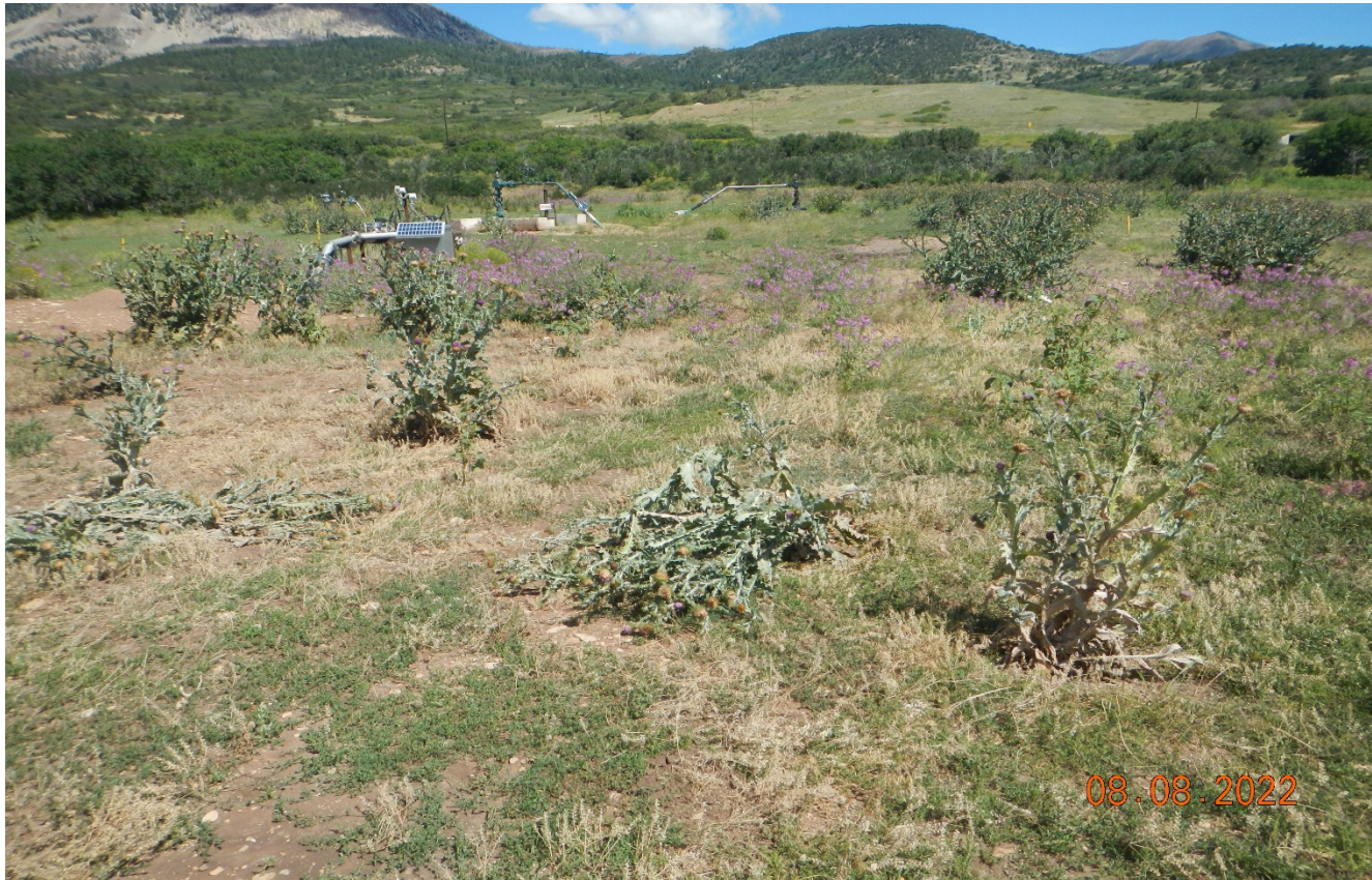
Photo 2. Facing northwest toward the location. There is numerous noxious weeds at the location that need to be controlled. The weeds have produced seed heads which should be cut and removed.