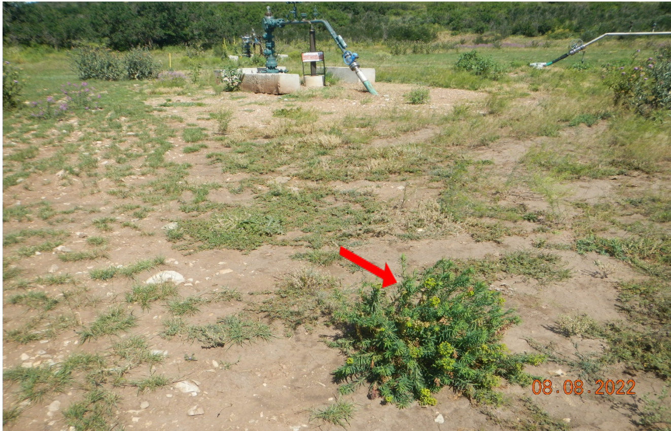
Photo 4. Facing northwest toward the well site. Red arrow points to Leafy spurge a List B noxious weed that needs to be controlled.