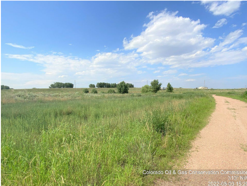
Photo #3 Bashor PC AA 17-02D, 17-18 Battery site Abandoned: ALL Equipment removed