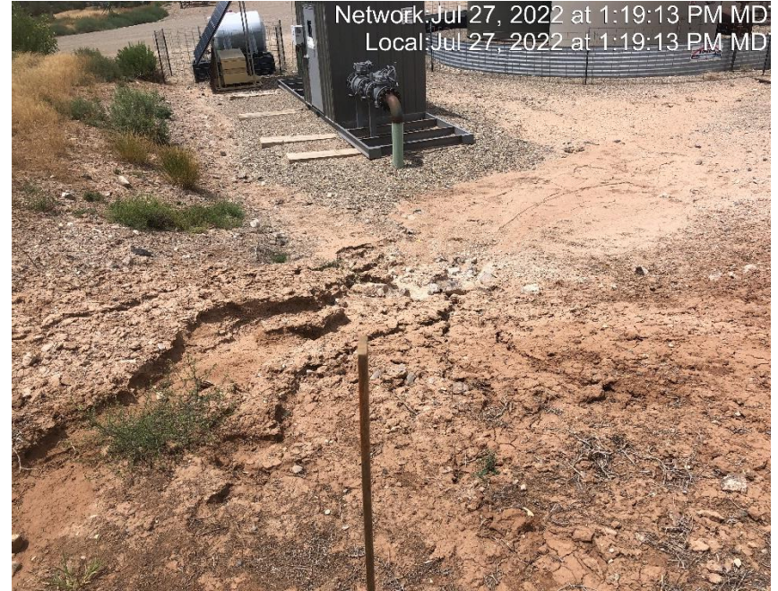
Photo #7339 Rill erosion occurring in North West corner of location.