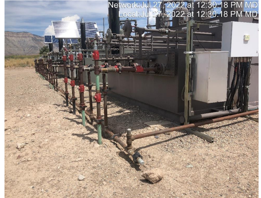
Photo #7320 2" flowline system that manifolds all 16 wells together.