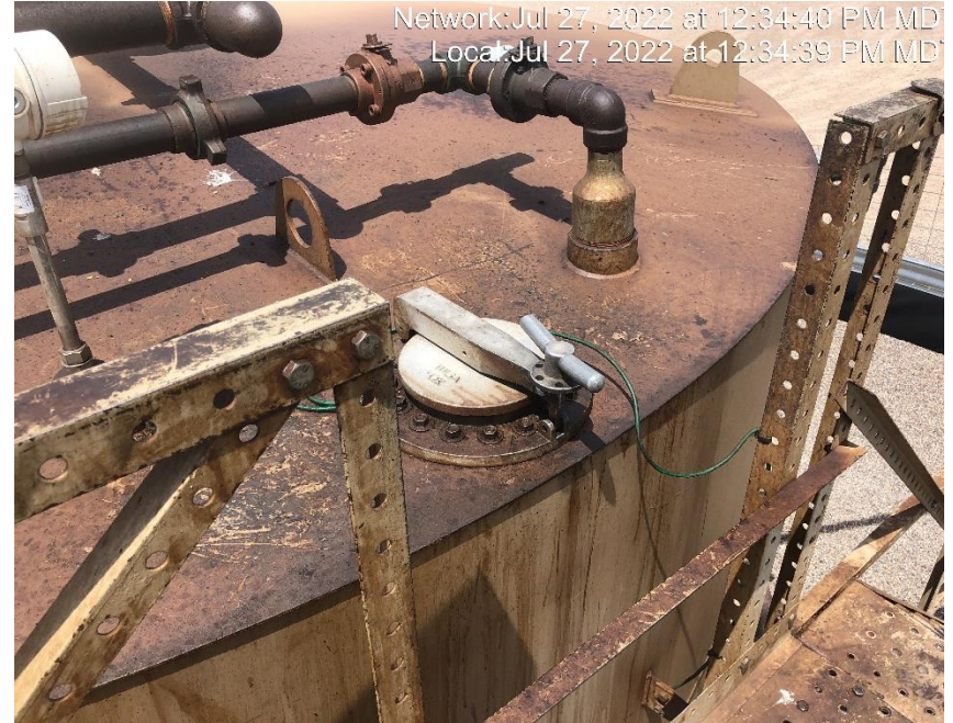
Photo #7332 Staining on top of tank indicates the tank has been over pressured.