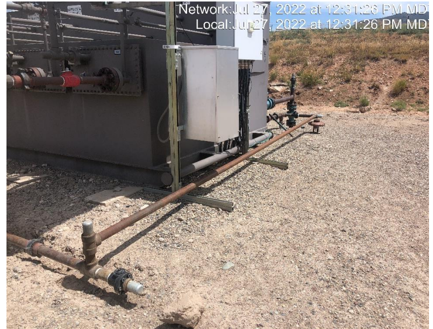
Photo #7324 2" flowline appears to have been added for liquid unloading operations.