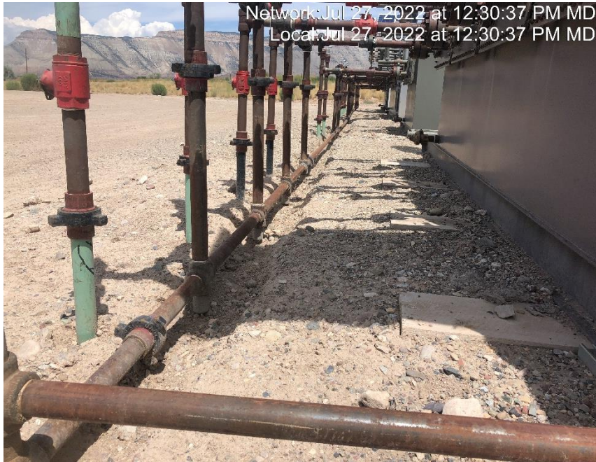
Photo #7321 It appears the 2" line has been added post location construction.