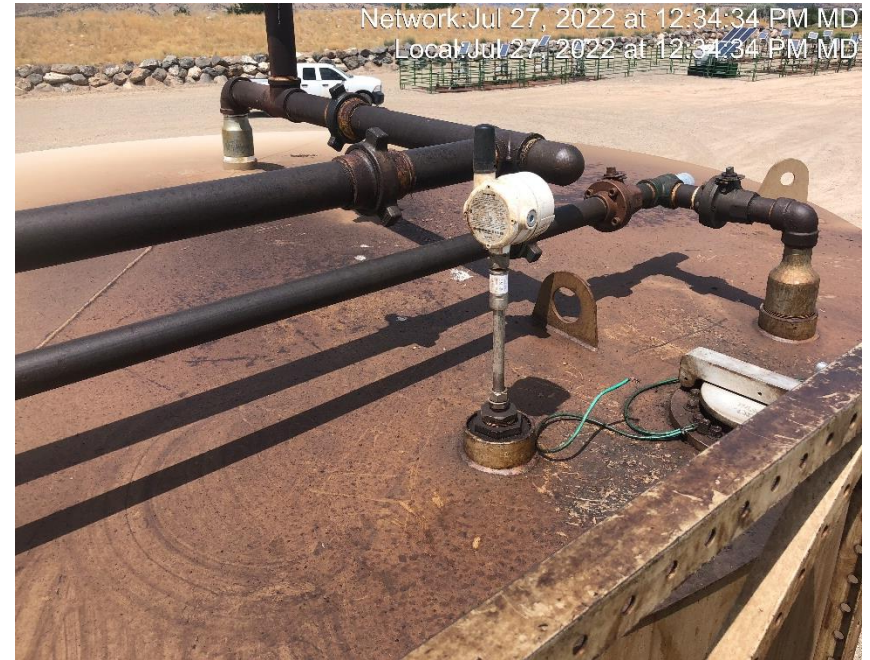
Photo #7331 Staining on top of tank indicates the tank has been over pressured.