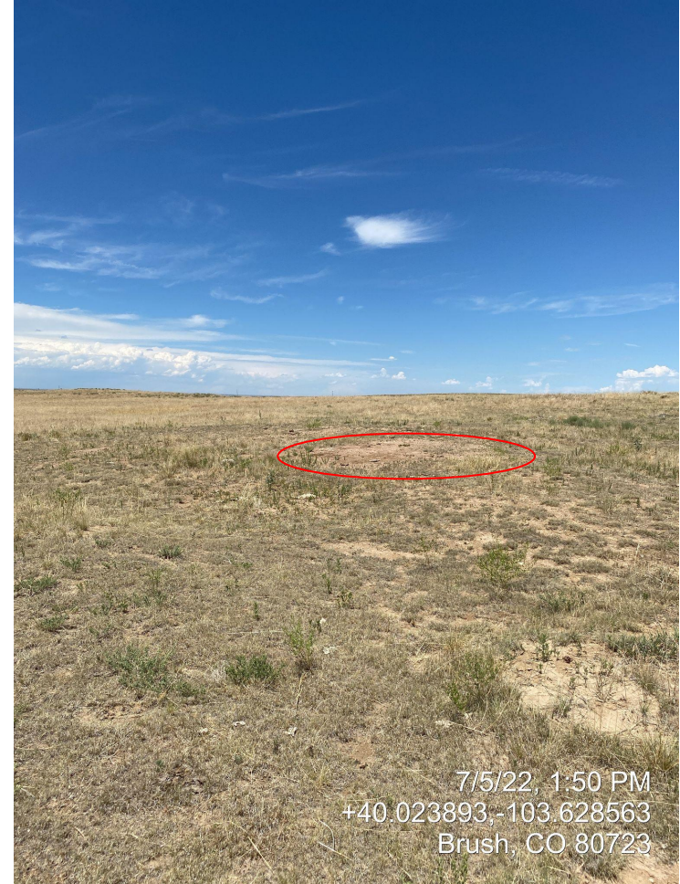
Photo 5. Location photo taken from southern portion, facing north. Non-uniform vegetation cover resulting in bare soil.