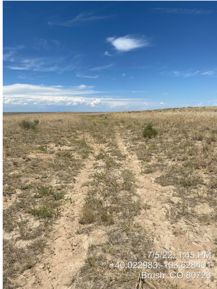
Photo 1. Photo taken south of location, facing north. Access road has not been reclaimed (e.g. recontoured, regraded, revegetated).