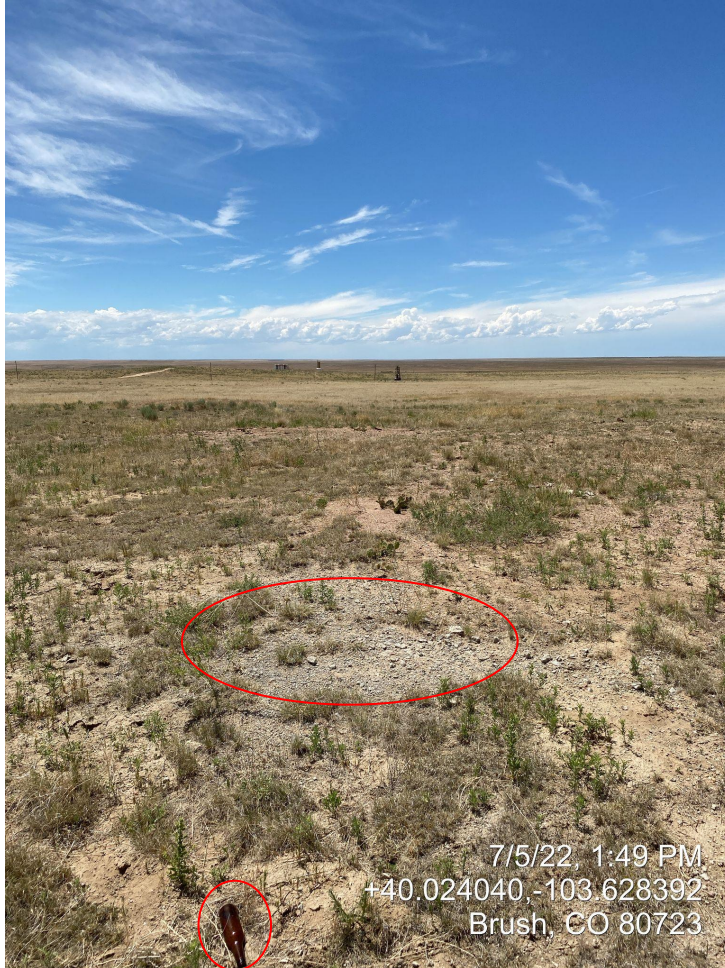
Photo 4. Location photo taken from eastern portion, facing west. Debris observed on location.