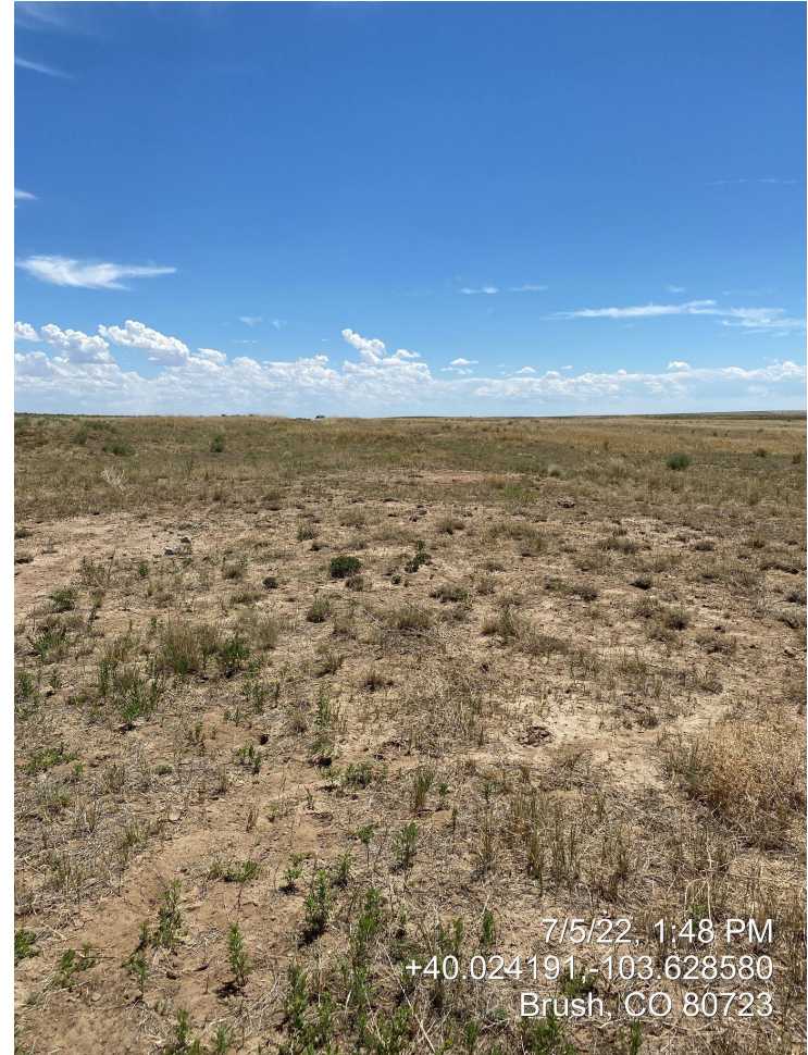
Photo 3. Location photo taken from northern portion, facing south. Non-uniform vegetation cover resulting in bare soil.