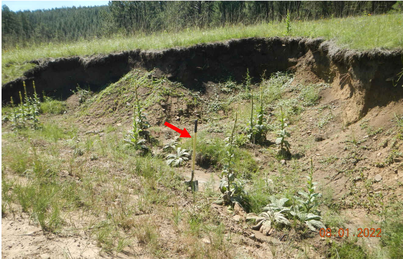
Photo 3. The side of the road is eroded and not stabilized. Erosion head cutting is continuing to occur further back. This area needs to be repaired and stabilized. Previous corrective action not completed. Red arrow points to 4.5 ft. shovel. Lat/Long:36.99952,-104.83425. There are also noxious shown in the photo.