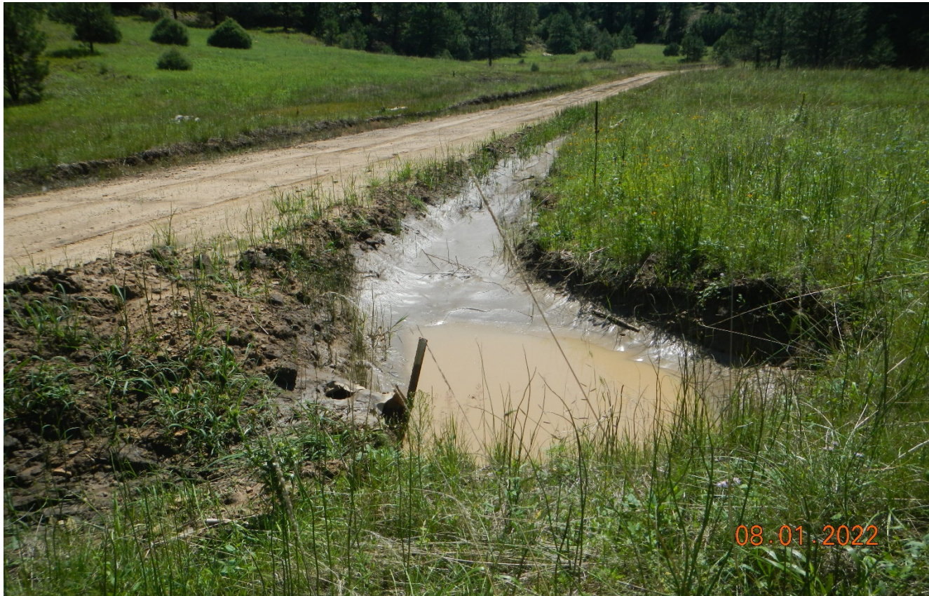
Photo 1. This culvert inlet was cleaned out however, the culvert is full of sediment. Previous corrective action was not completed. Lat/Long:37.00581,-104.83861.