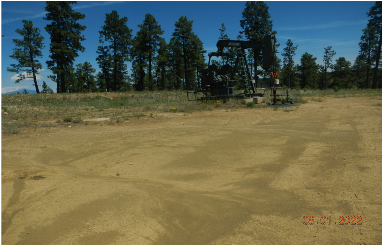
Photo 6. Facing northeast toward the well site.