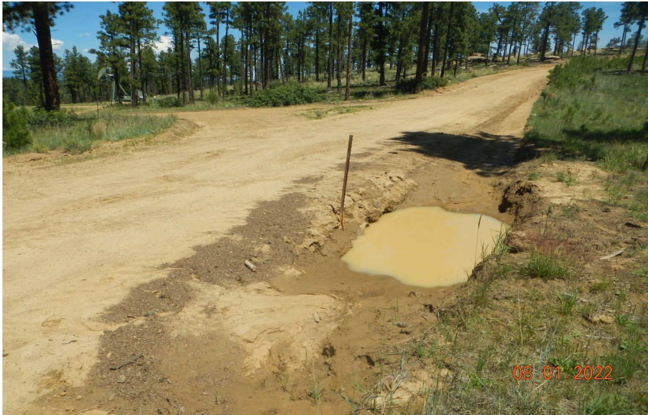
Photo 5. This culvert inlet was cleaned out however, the culvert is full of sediment which needs to be cleaned out. Lat/Long:36.99405,-104.84710.

Previous corrective action not completed.