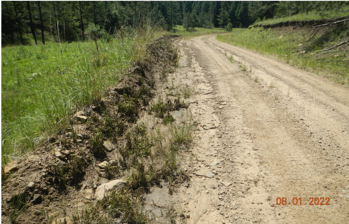
Photo 4. There are noxious weeds along the access road that are wilted from recent weed control. Canada thistle is shown wilted in the photo.