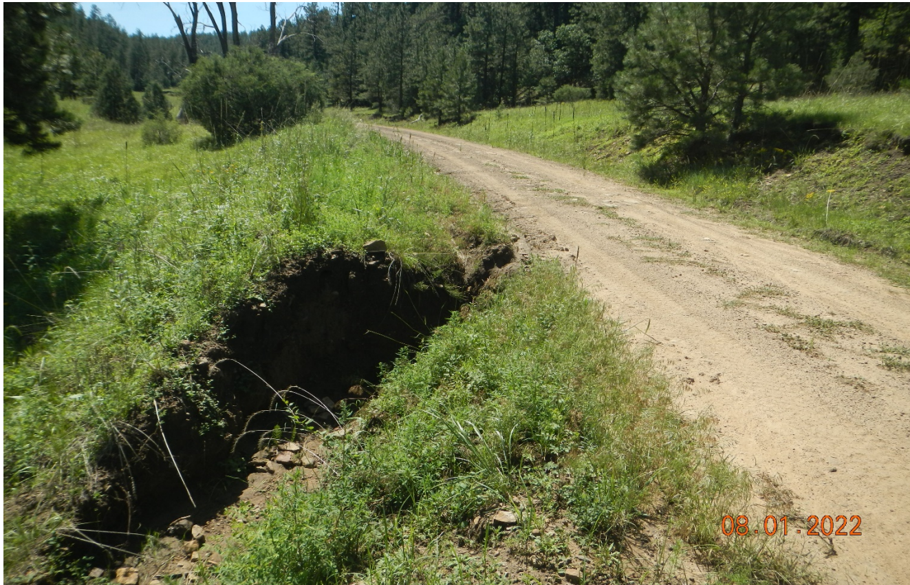
Photo 2. There is an erosion gully along the road that needs to be repaired and stabilized. Previous corrective action was not completed.