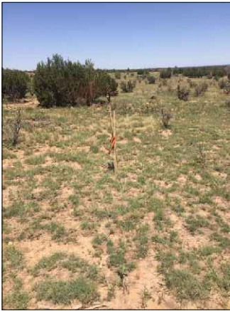
REFERENCE AREA LOOKING NORTH 7/4/2021