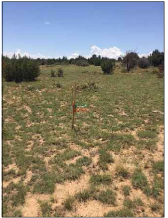
REFERENCE AREA LOOKING SOUTH 7/4/2021