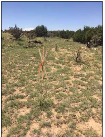
REFERENCE AREA LOOKING WEST 7/4/2021