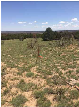
REFERENCE AREA LOOKING EAST 7/4/2021