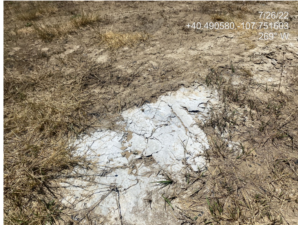
Photo 10. Photo taken from the south of the Location shows cement waste has been discharged on Location.