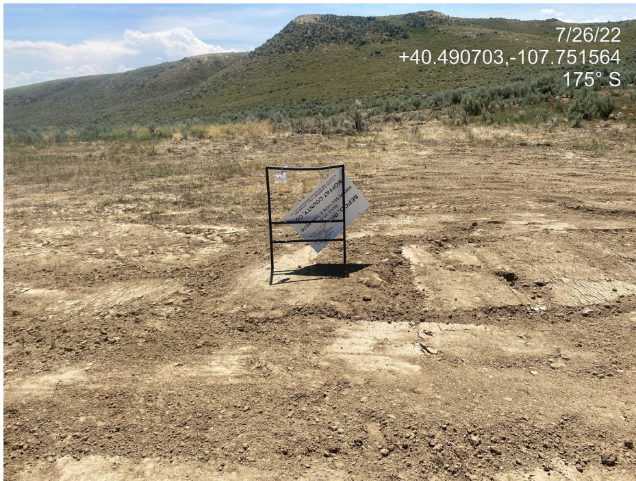
Photo 1. Photo taken from the center of the Location shows the Location sign.