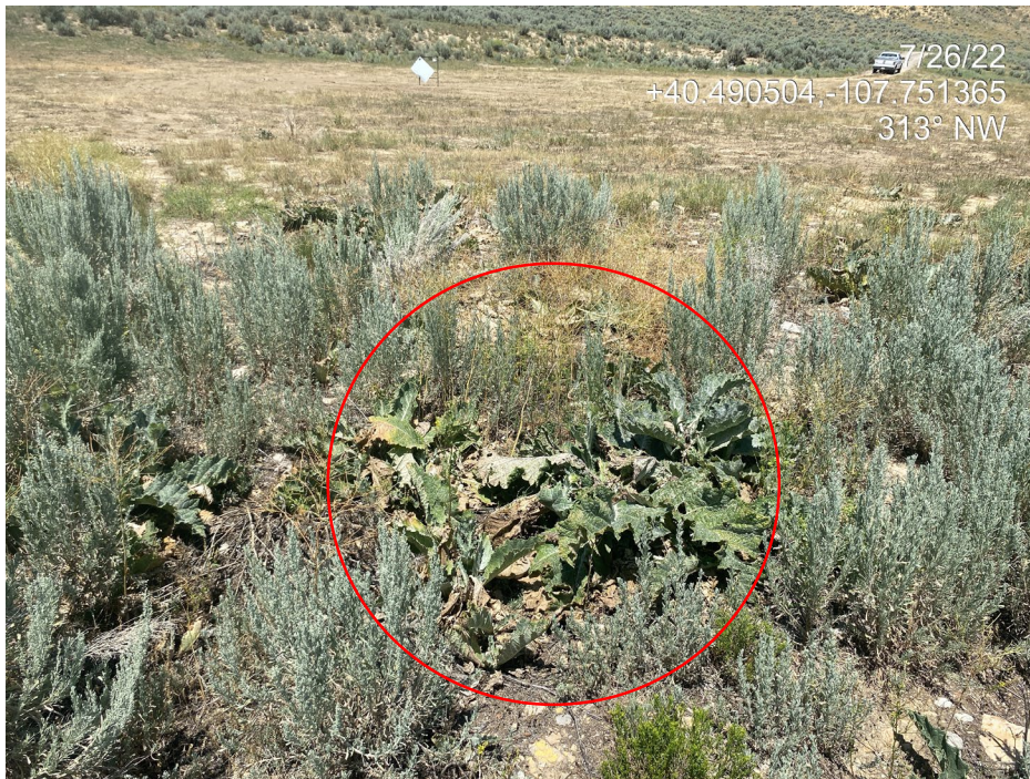
Photo 7. Photo taken from the southeast of the Location shows Scotch thistle, a CO List B Noxious Weed.