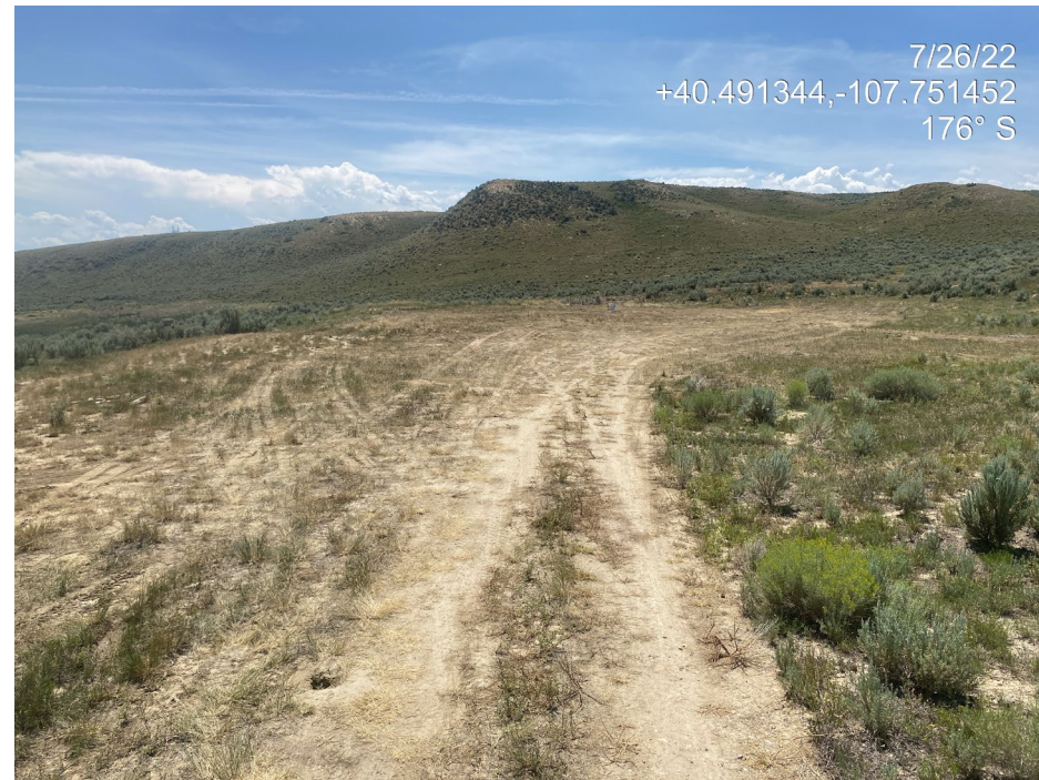
Photo 2. Photo taken from the north, at the Location entrance shows an overview of the Location.