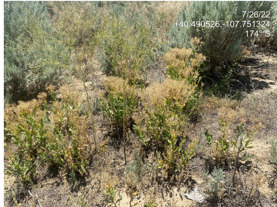
Photo 6. Photo taken from the southeast of the Location shows whitetop, a CO List B Noxious Weed.