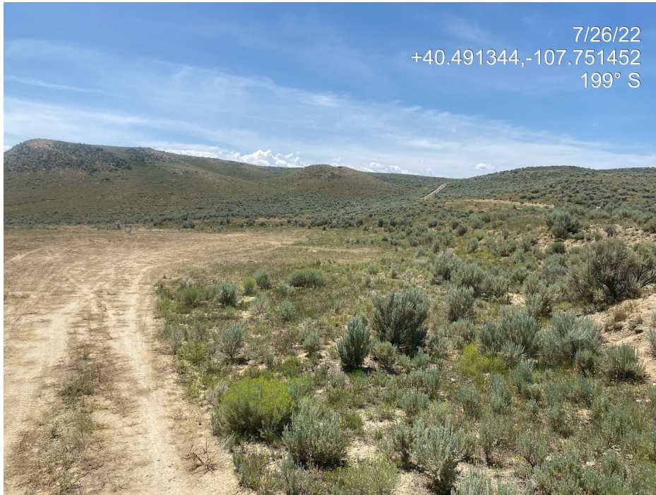
Photo 3. Photo taken from the north of the Location shows the cut slope of the Location. The Location must be recontoured/regraded for final reclamation.