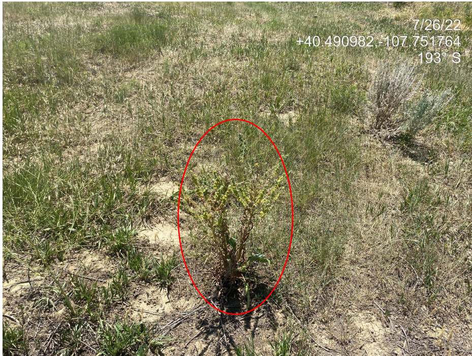
Photo 5. Photo taken from the northwest of the Location shows houndstongue, a CO List B Noxious Weed.