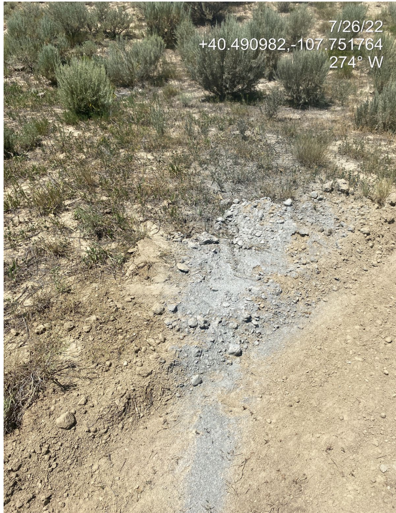
Photo 9. Photo taken from the northwest of the Location shows cement waste has been discharged on Location.