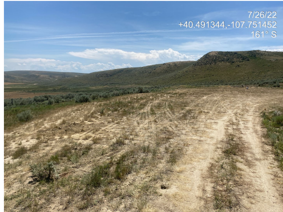
Photo 4. Photo taken from the north of the Location shows the fill slope of the Location. The Location must be recontoured/regraded for final reclamation.