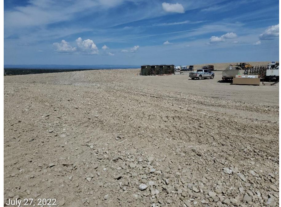
Photo 1: Photos 1-2 taken from the north end of the Location. Photos provide an overview of the Location, from west, northwest, northeast to east. Though interim reclamation has commenced, work in accordance with 1003 Rules have not been completed- topsoil has not been replaced and revegetation activities have not been conducted. Interim reclamation was required by 5/3/2021.