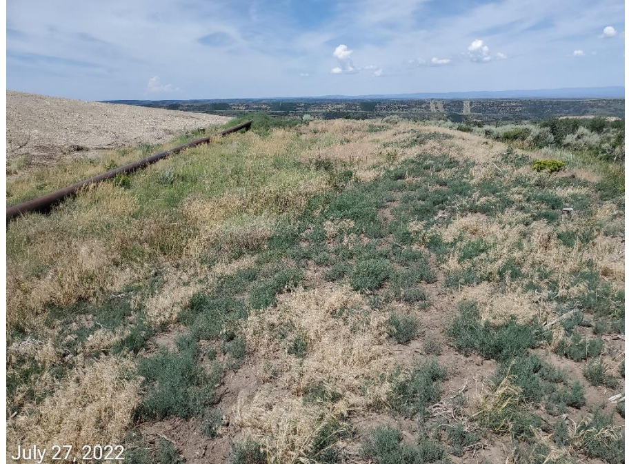
Photo 3: Photo taken from the topsoil stockpiles along the perimeter of the Location. Photos show 1) BMPs to protect topsoil stockpile per 1002.c remains inadequate, and 2) topsoil has not been replaced during interim reclamation. Vegetation predominantly undesirable plant species including Russian Thistle, cheatgrass. Noxious weeds including Houndstongue and musk thistle also observed along areas of the topsoil stockpile.