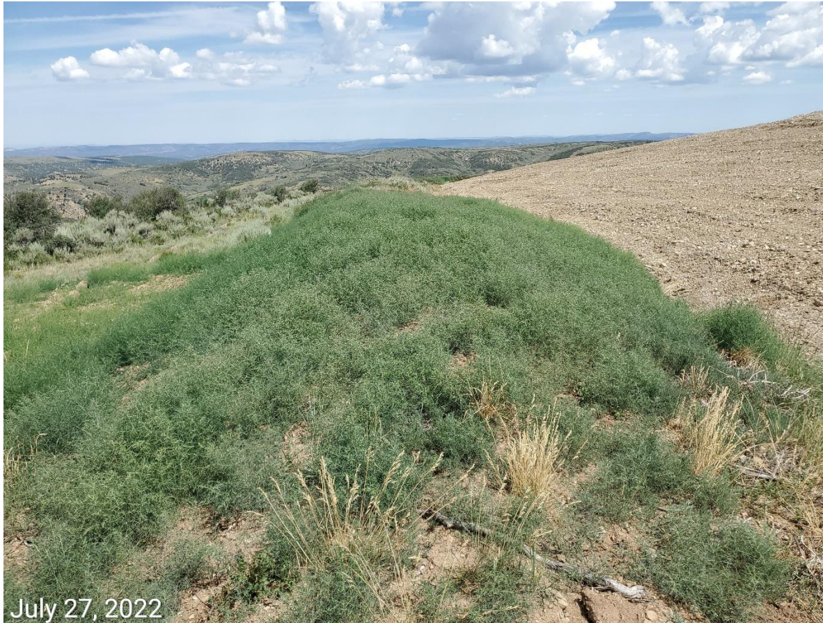
Photo 4: Photo taken from the topsoil stockpiles along the perimeter of the Location. Photos show 1) BMPs to protect topsoil stockpile per 1002.c remains inadequate, and 2) topsoil has not been replaced during interim reclamation. Vegetation predominantly undesirable plant species including Russian Thistle, cheatgrass. Noxious weeds including Houndstongue and musk thistle also observed along areas of the topsoil stockpile.