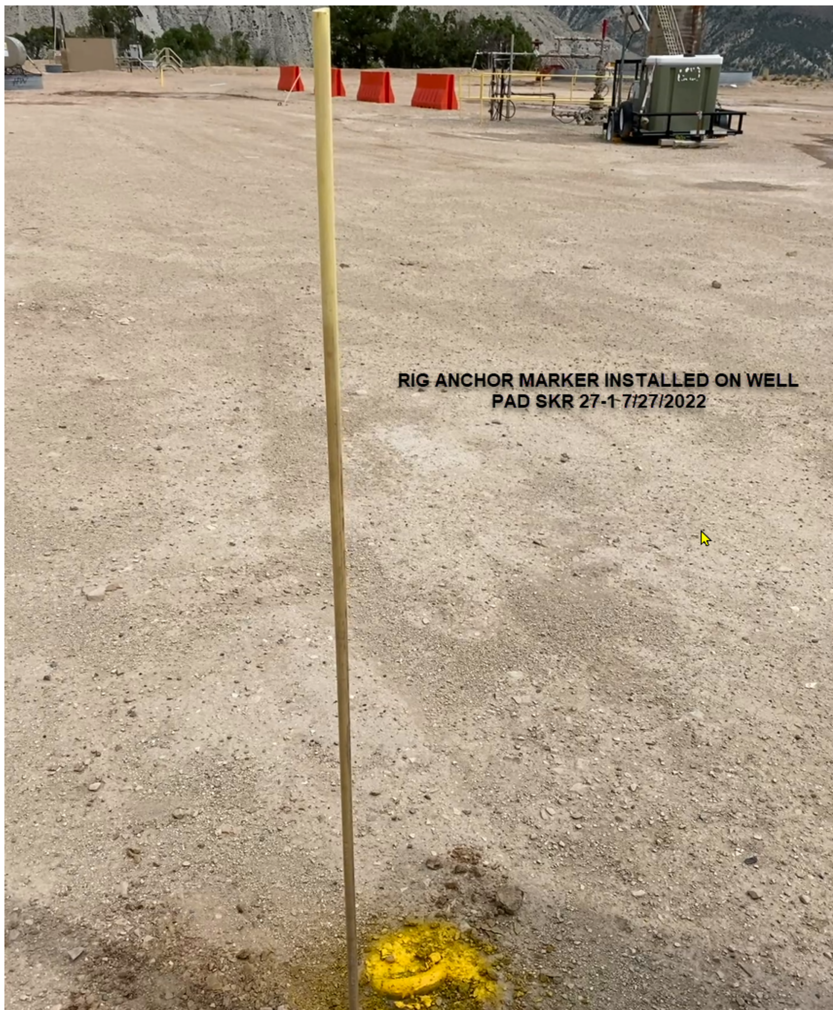
CA2: RIG ANCHOR MARKER ON NW CORNER OF WELL PAD SKR 27-1 INSTALLED ON 27 JULY 2022