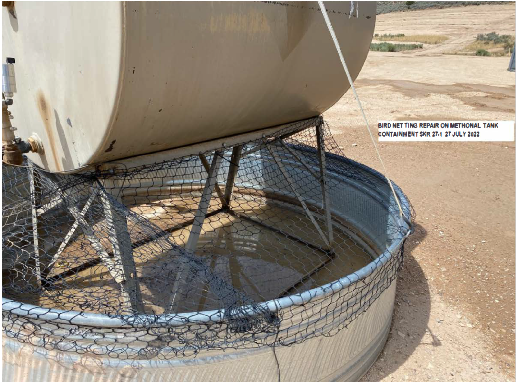
CA1: BIRD NETTING ON METHANOL TANK CONTAINMENT ON WELL PAD SKR 27-1 REPAIRED ON 27 JULY 2022