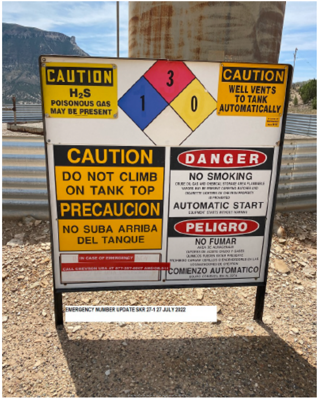
NEW HAZARD PLACARD PLACED ON METHANOL TANK AT SKR 27-1 ON 27 JULY 2022